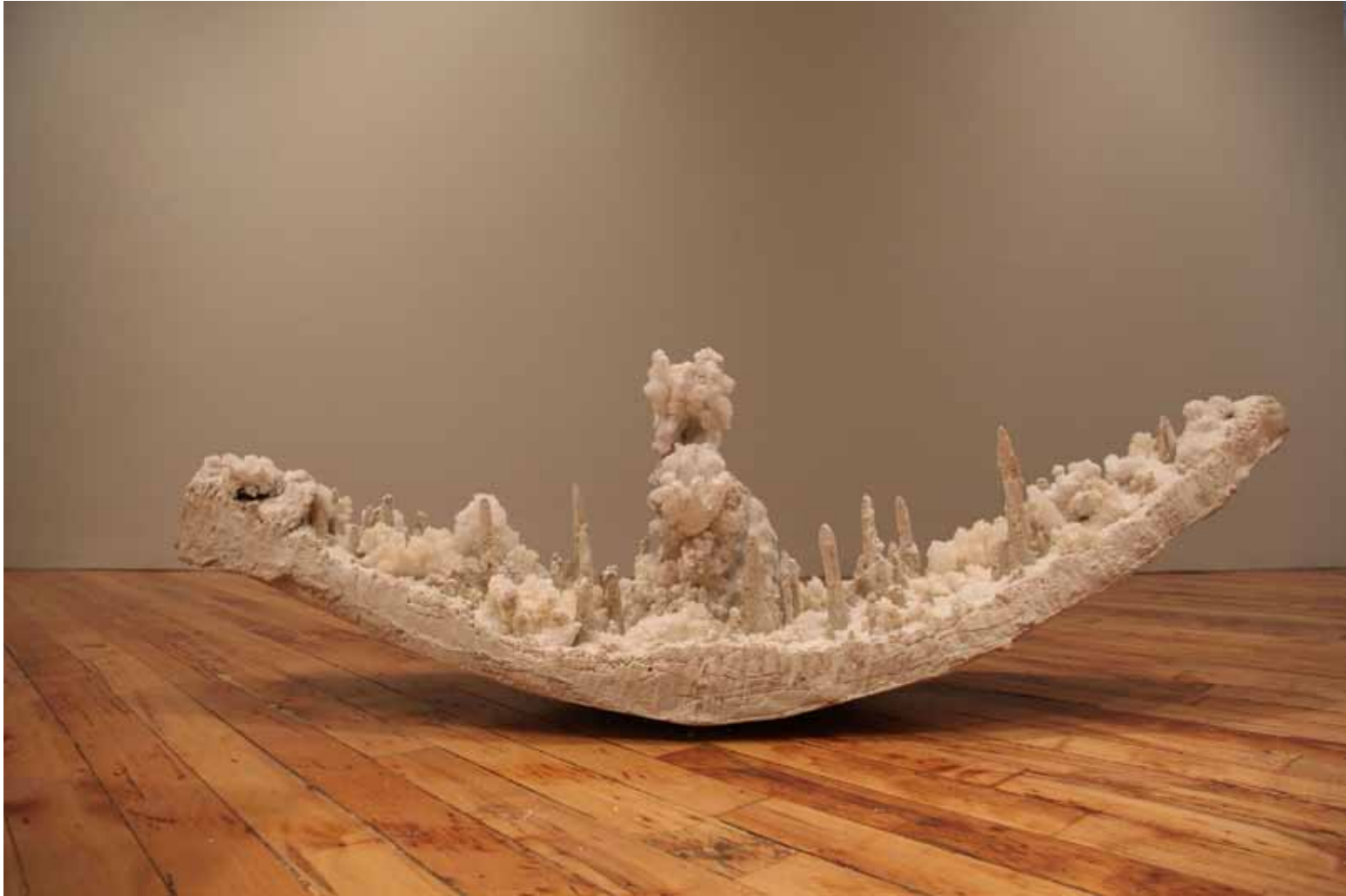
Kahn & Selesnick Crystal Barque , 2010