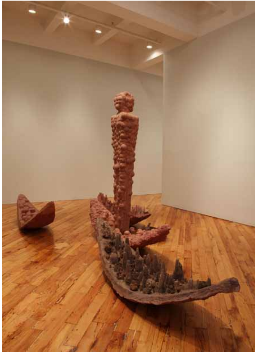
Kahn & Selesnick Stone Barques 2 , 2010