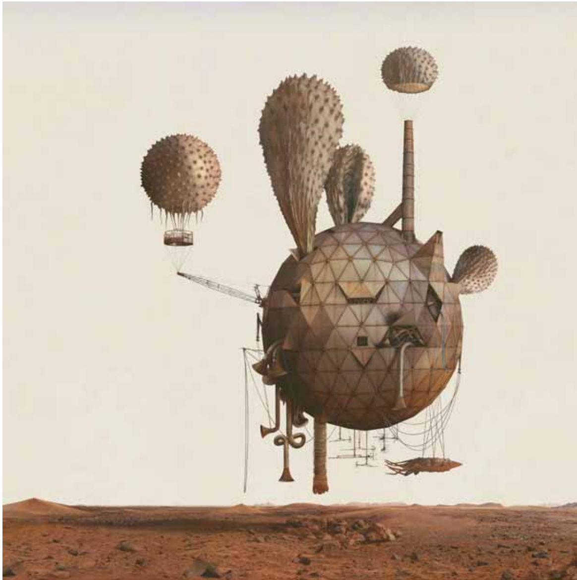
Kahn & Selesnick Floating Factory , 2010