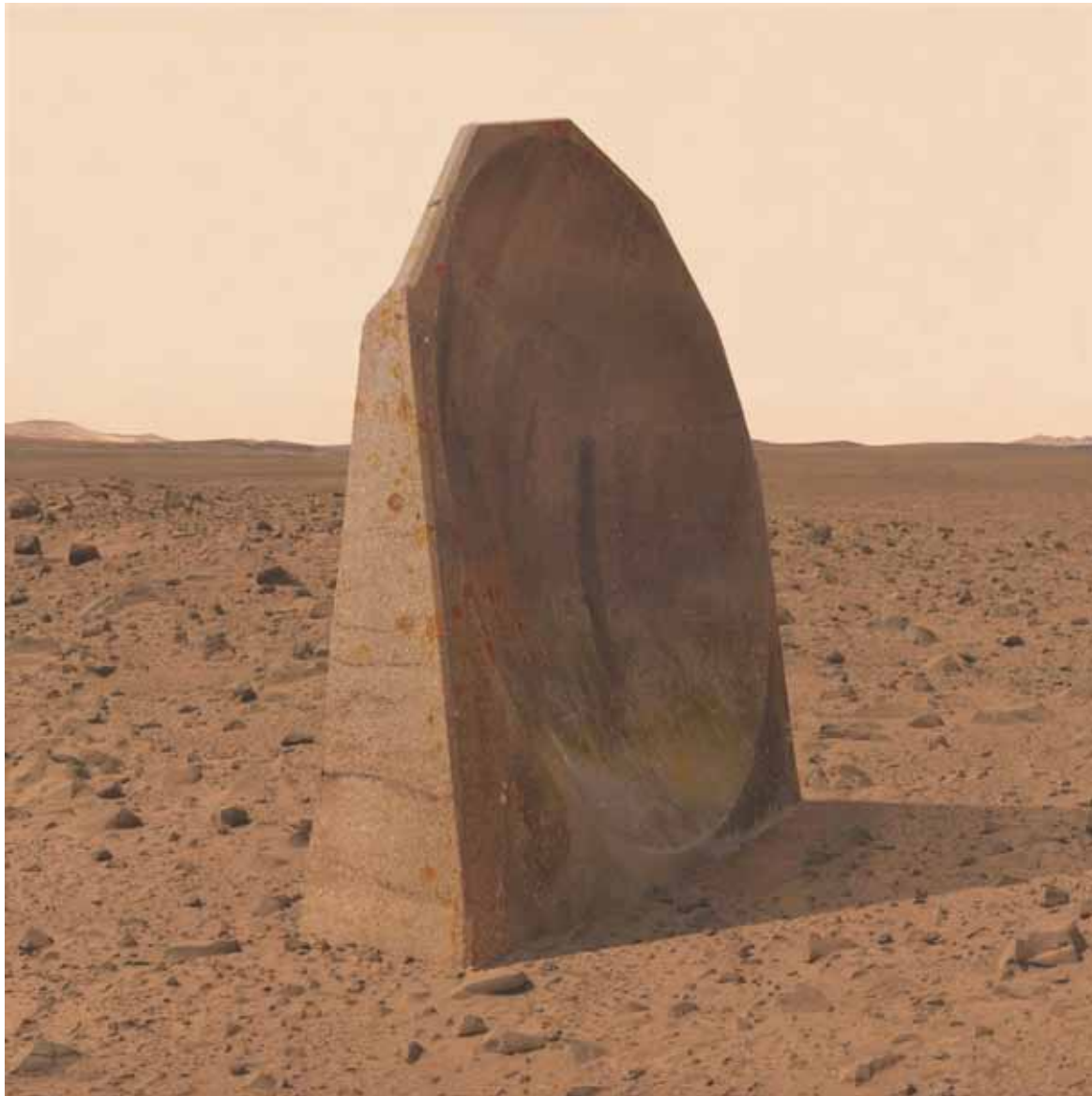
Kahn & Selesnick Concrete Ear 1 , 2010