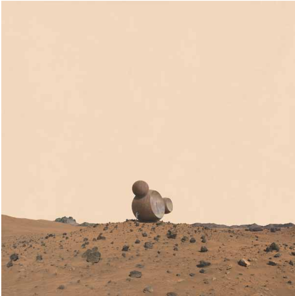
Kahn & Selesnick Concrete Ear 4 , 2010