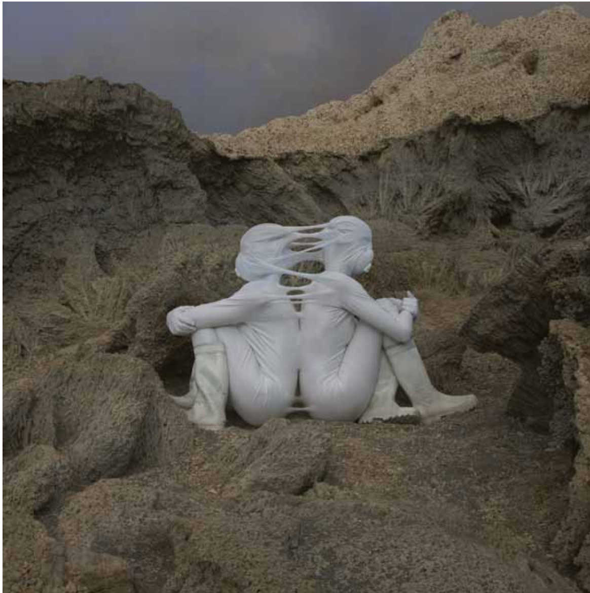
Kahn & Selesnick Janus Symbiosis , 2010