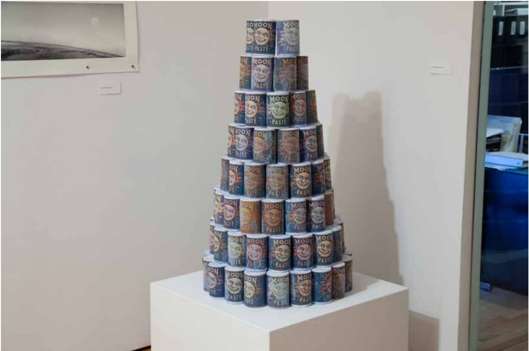
Installation shot, Museum of Contemporary Photography, 2011