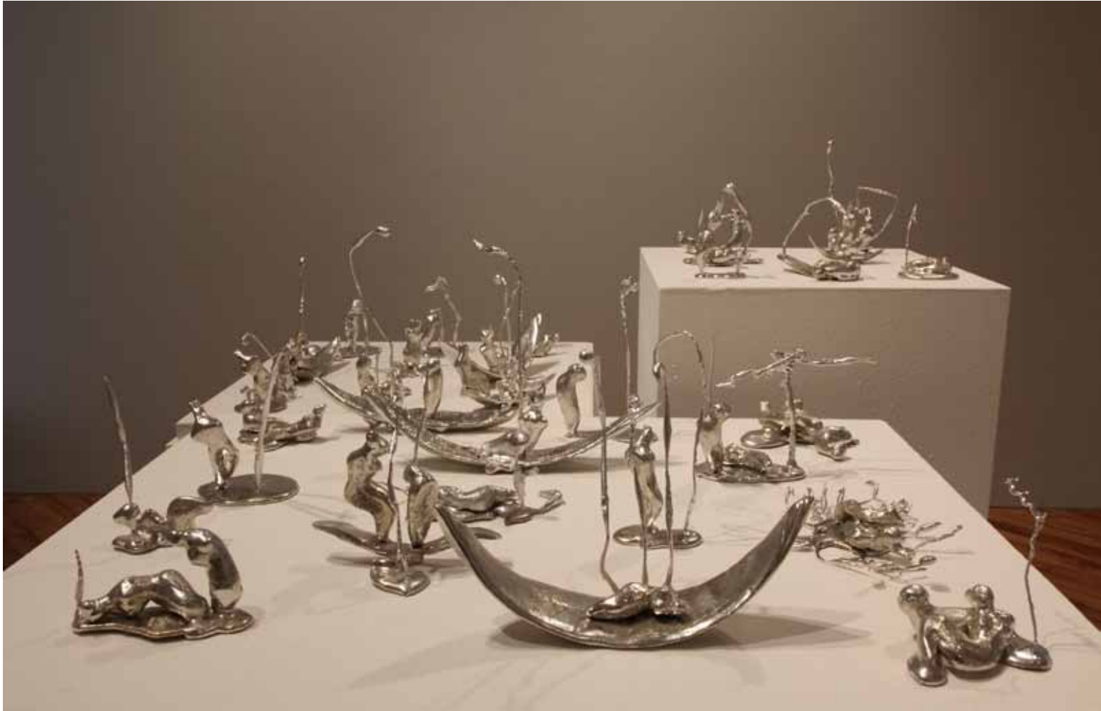
Kahn & Selesnick Tin Mothers , 2010