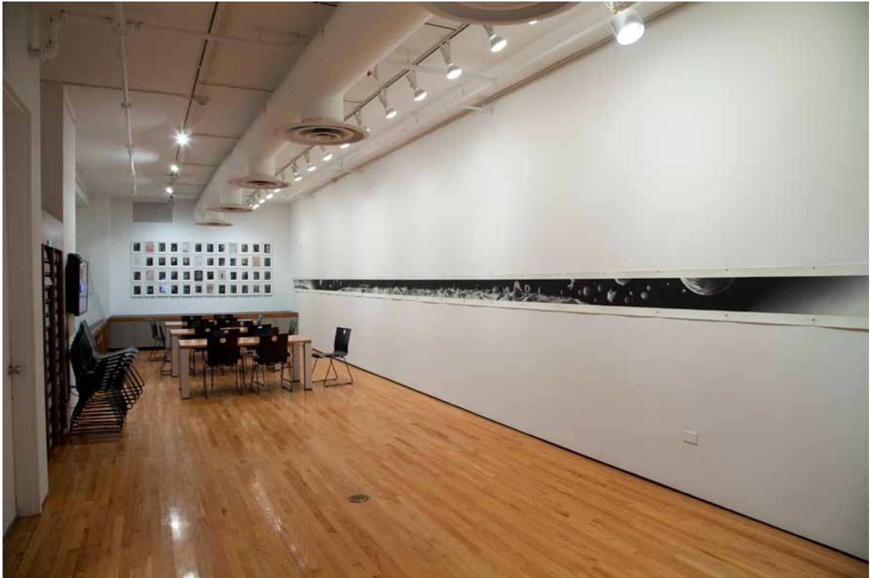
Installation shot, Museum of Contemporary Photography, 2011