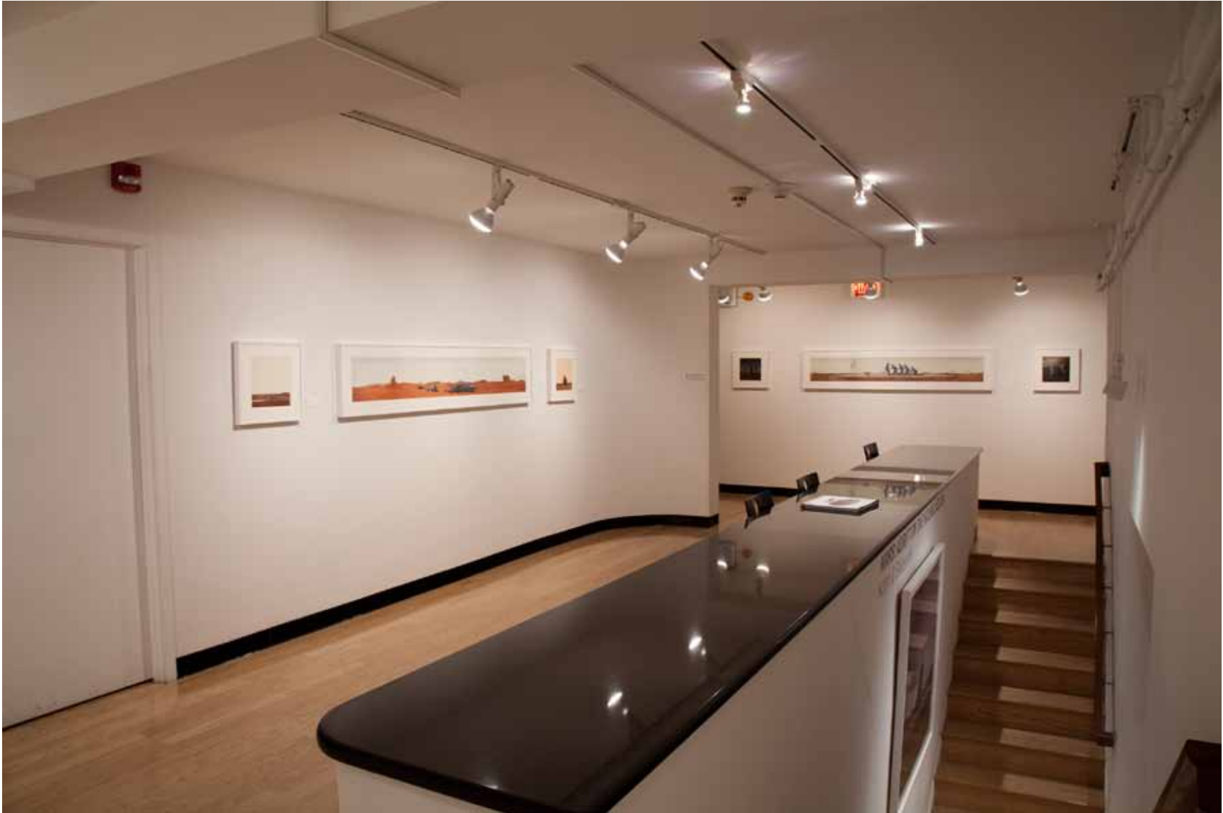
Installation shot, Museum of Contemporary Photography, 2011