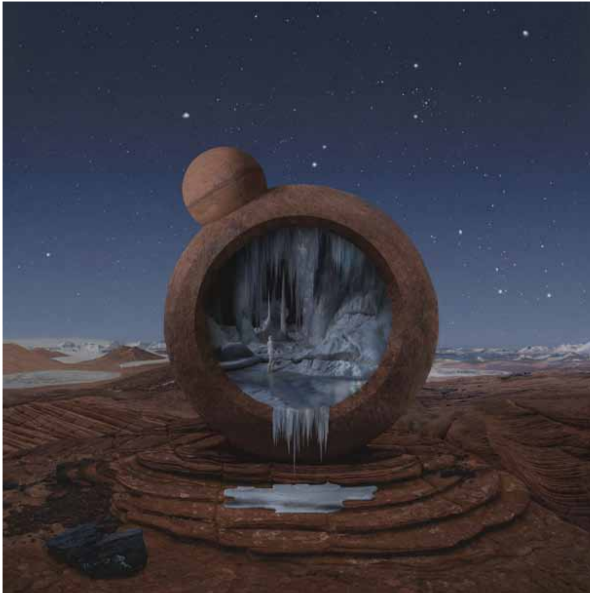
Kahn & Selesnick Cistern , 2010