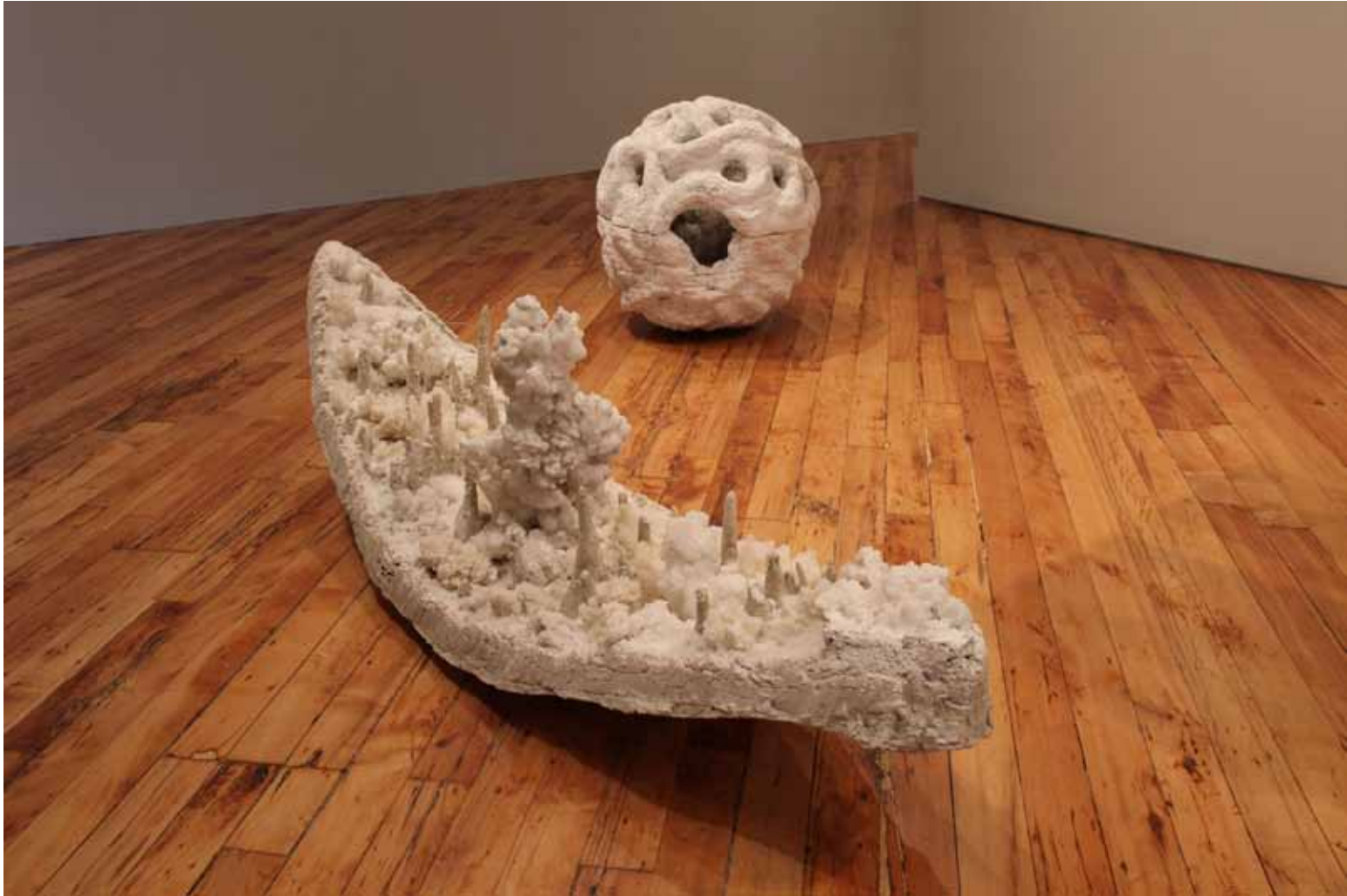
Kahn & Selesnick Crystal Barque & Serpent Seed , 2010