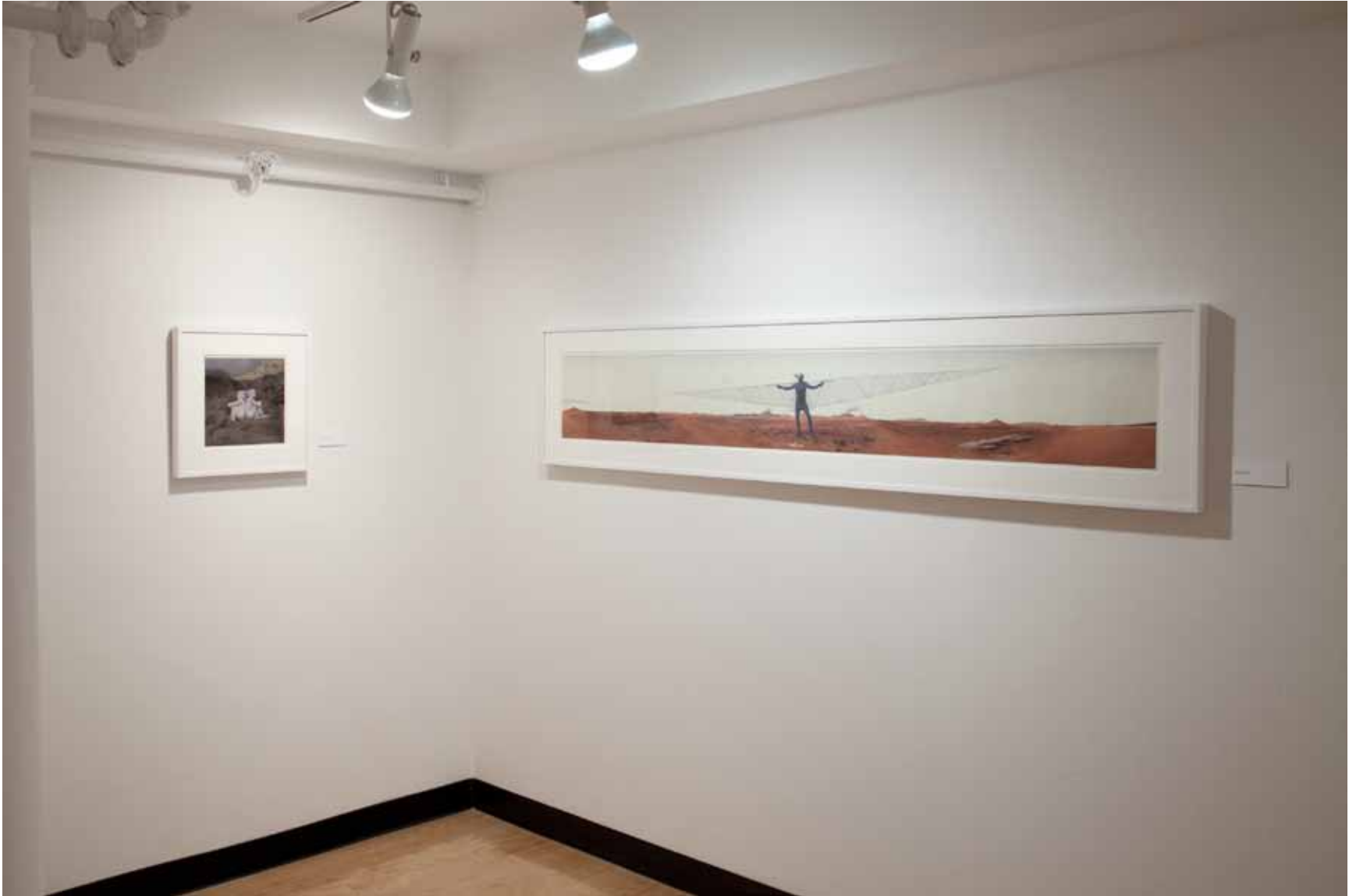
Installation shot, Museum of Contemporary Photography, 2011