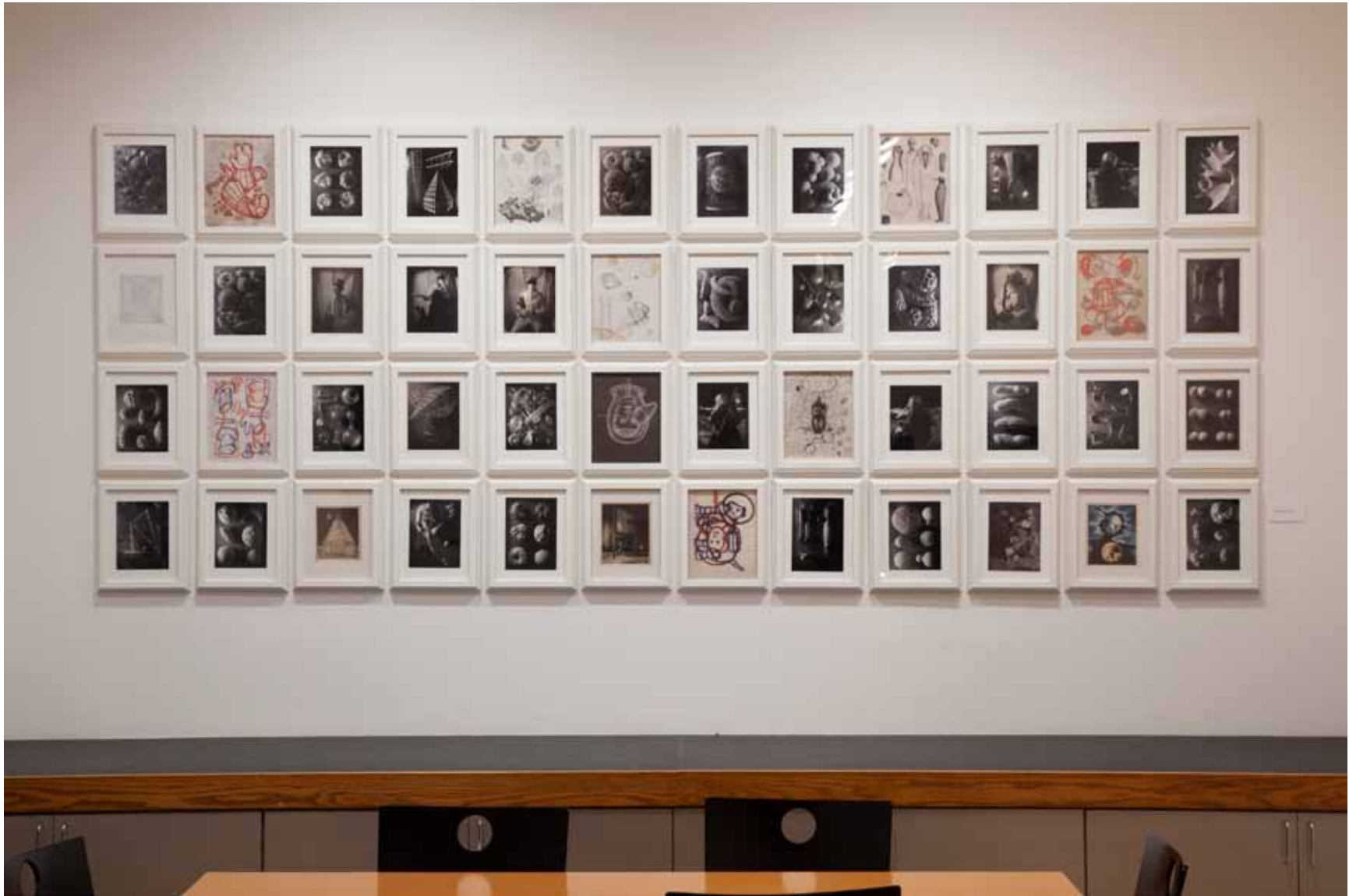
Installation shot, Museum of Contemporary Photography, 2011