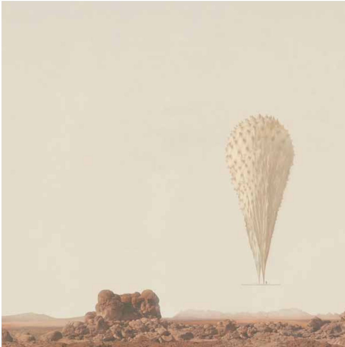
Kahn & Selesnick Distant Balloon , 2010