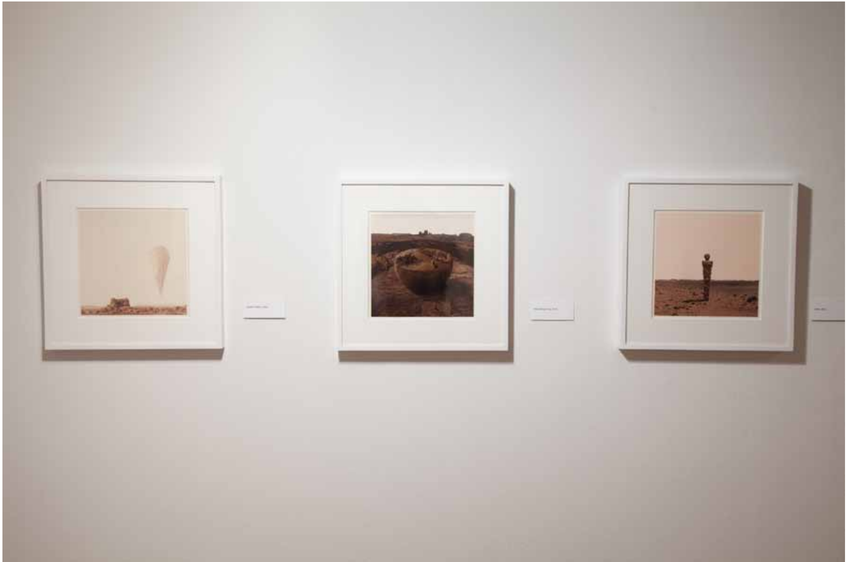
Installation shot, Museum of Contemporary Photography, 2011