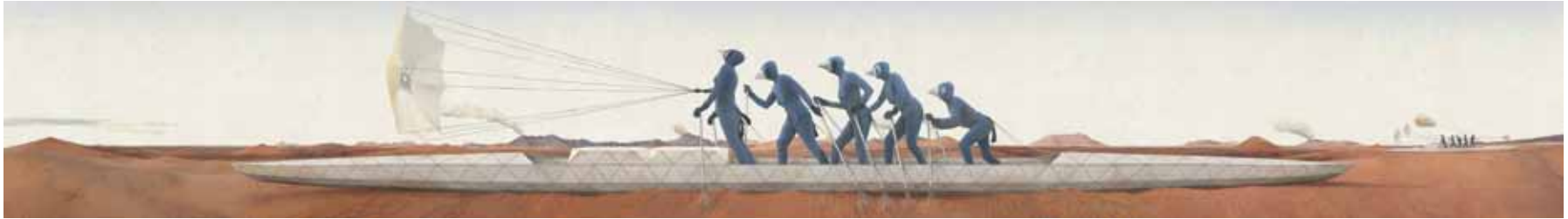
Kahn & Selesnick Sandboat , 2010