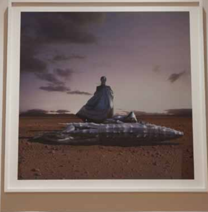
Installation shot, Museum of Contemporary Photography, 2011