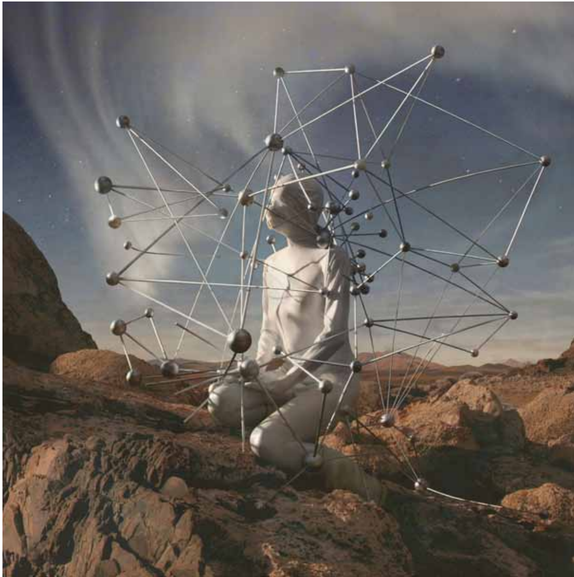
Kahn & Selesnick Constellation Matrix , 2010