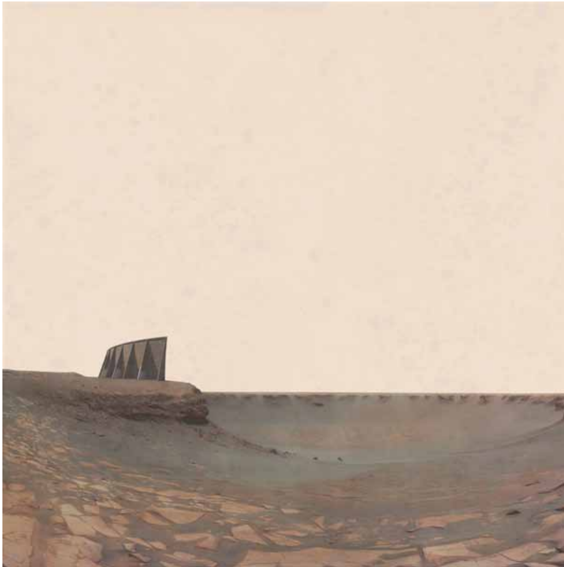
Kahn & Selesnick Concrete Ear 3, 2010