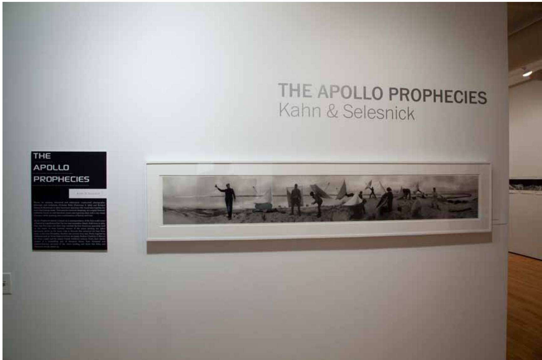
Installation shot, Museum of Contemporary Photography, 2011