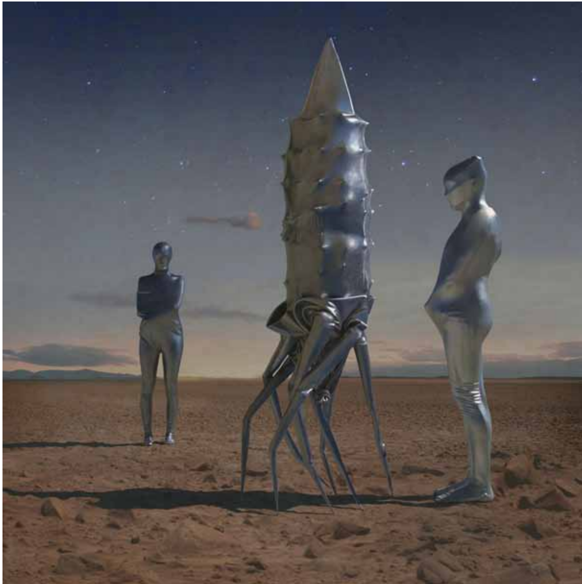
Kahn & Selesnick Squidnight , 2010