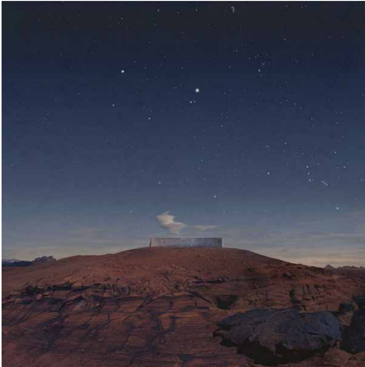
Kahn & Selesnick Concrete Ear 5, 2010