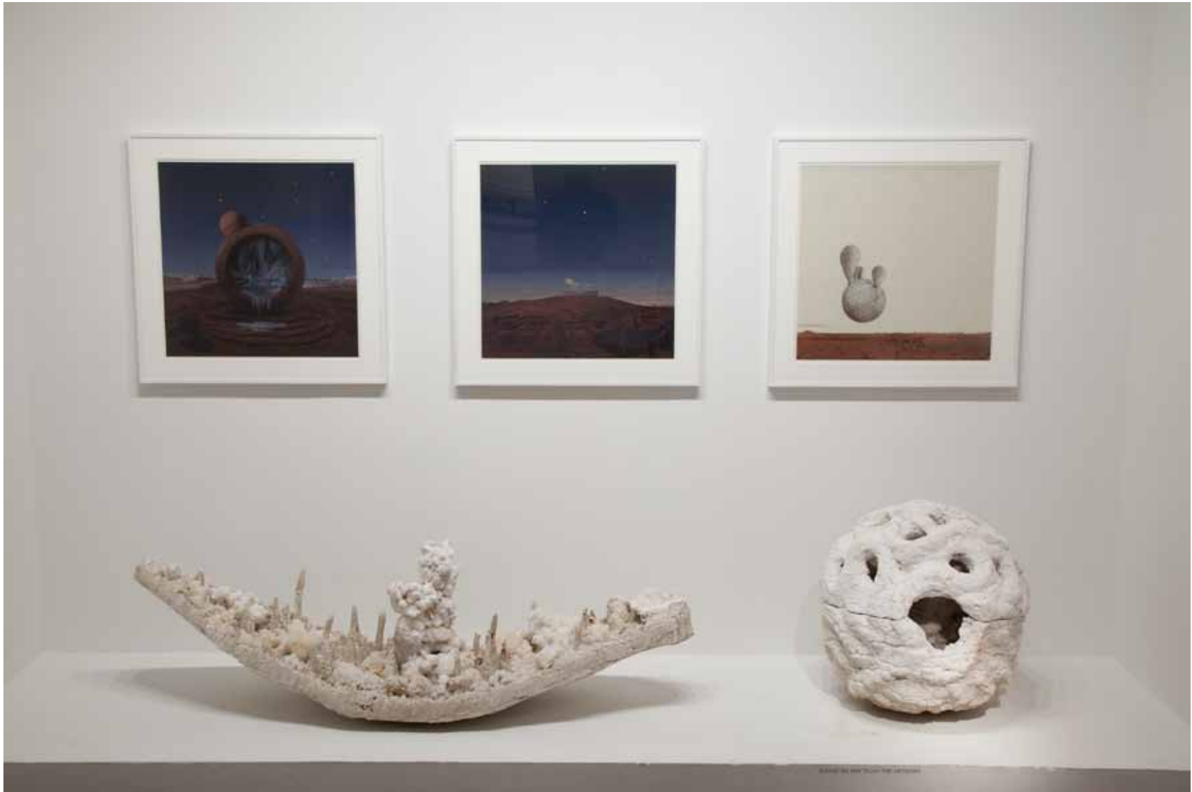
Installation shot, Museum of Contemporary Photography, 2011