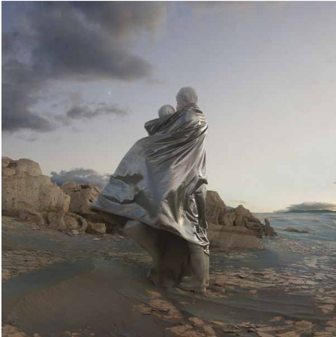
Kahn & Selesnick Earthrise , 2010