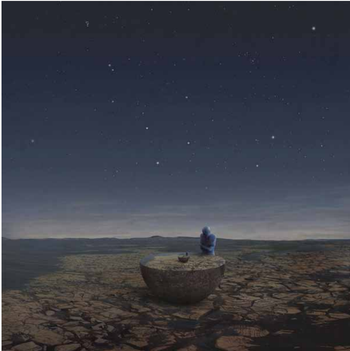
Kahn & Selesnick Oracle , 2010