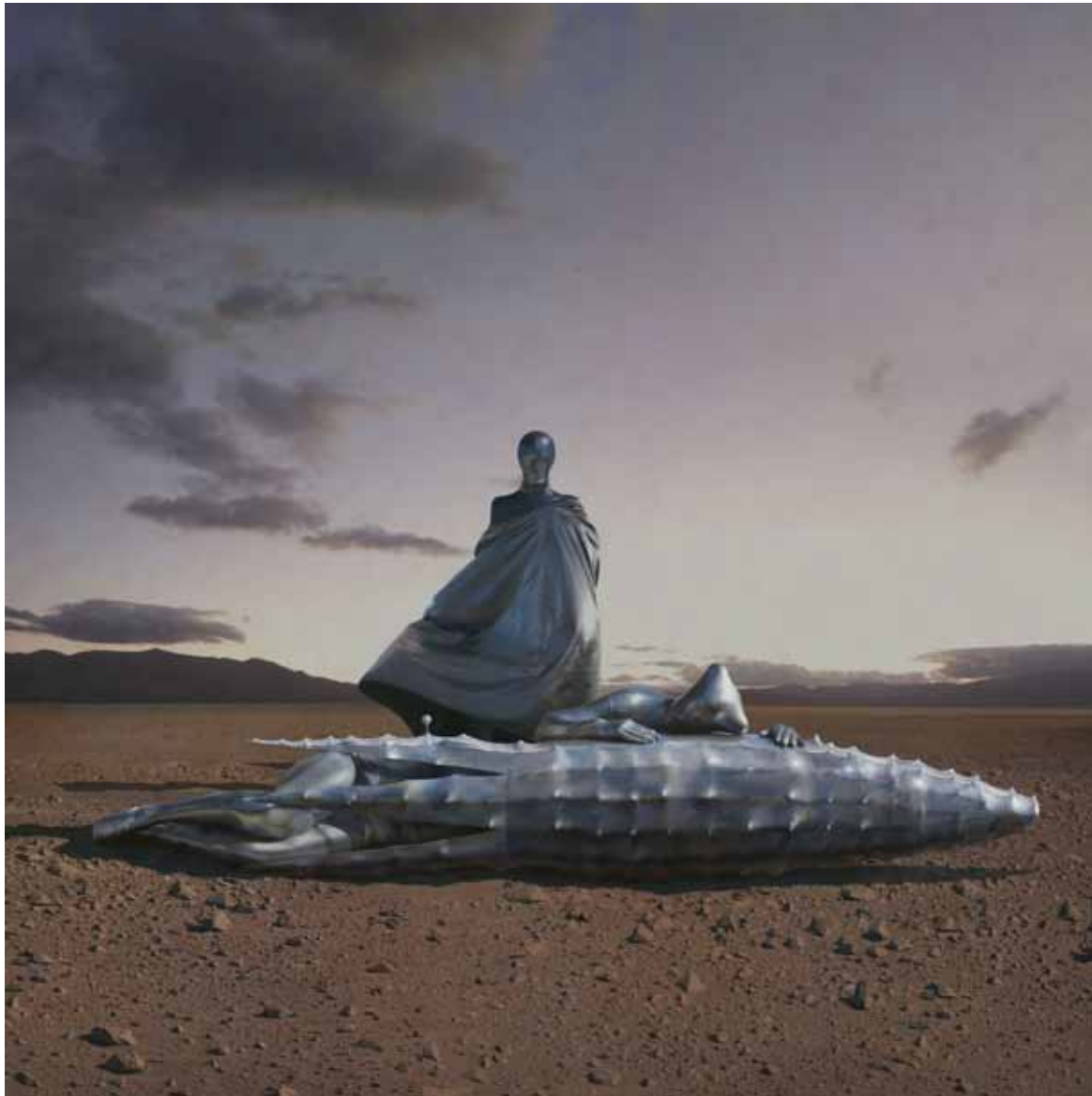
Kahn & Selesnick Stillborn , 2010