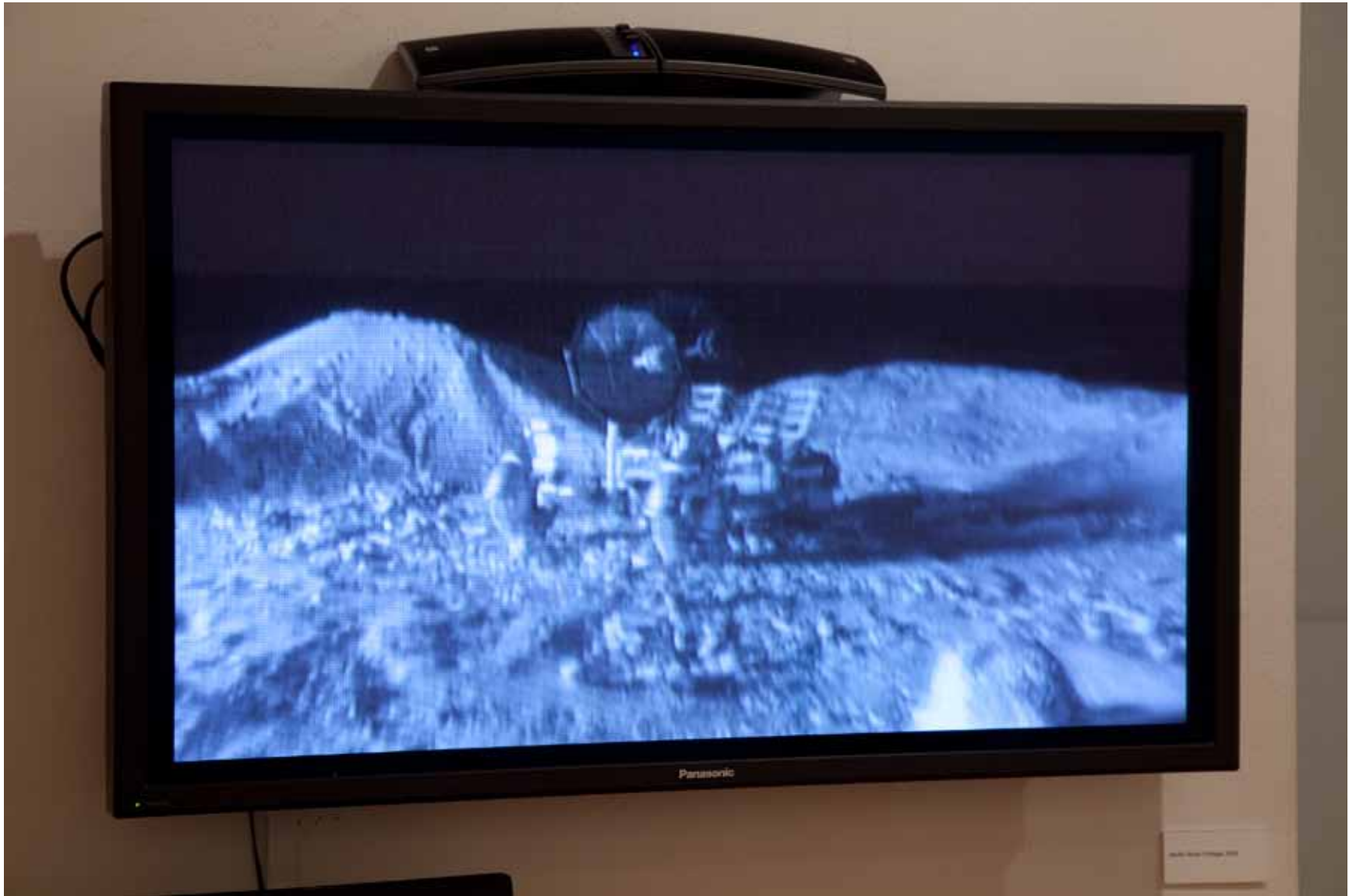
Installation shot, Museum of Contemporary Photography, 2011