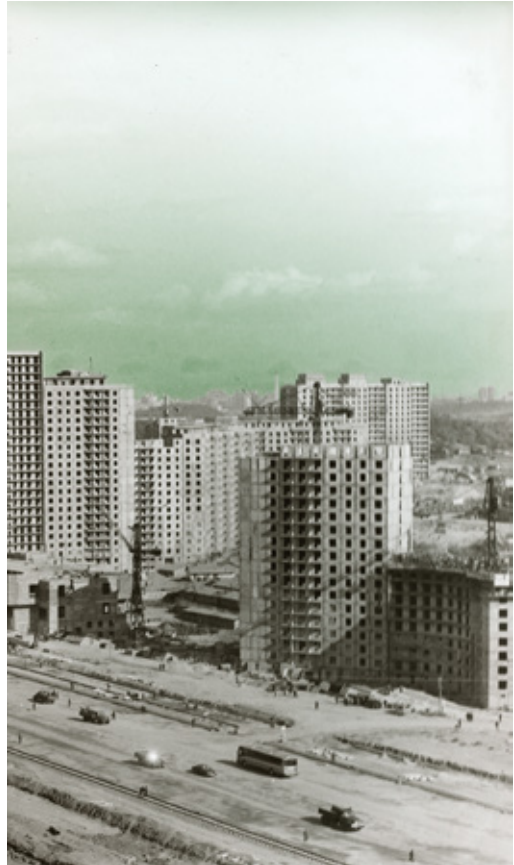
Artist: Seung Woo Back Title: Utopia #010 Medium: Archival Pigment Print Dimensions: 70 in x 128 in