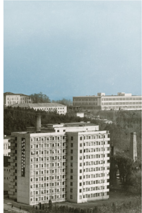
Artist: Seung Woo Back Title: Utopia #001 Medium: Archival Pigment Print Dimensions: 70 in x 128 in