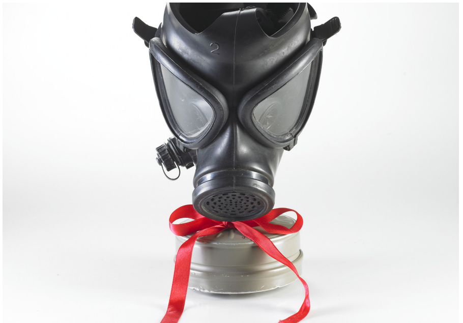
Shadi Ghadirian, White Square , 2009