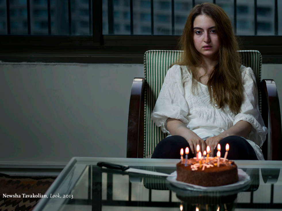
Newsha Tavakolian, Look , 2013