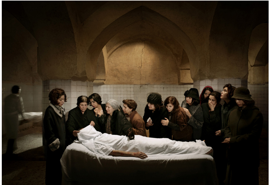
Azadeh Akhlaghi, Taghi Arani / 4 February 1940, 2012 , from the series By an Eye Witness

In her series By an Eye Witness , Azadeh Akhlaghi (b. 1978) creates images of past events for which photographs do not exist. Her process specifically comments on the many dramatic, tragic deaths that mark Iran's modern history. Pairing images with explanatory texts in both English and Farsi, each work is a thoughtful reconstruction of historical events using a combination of archived information, news reports and conflicting accounts from witnesses. Assassinations, torture, accidents, suspicious and natural deaths are all represented in the series; each death marks a moment in Iran's turbulent modern history, crossing political and factional lines, to which all Iranians can relate.