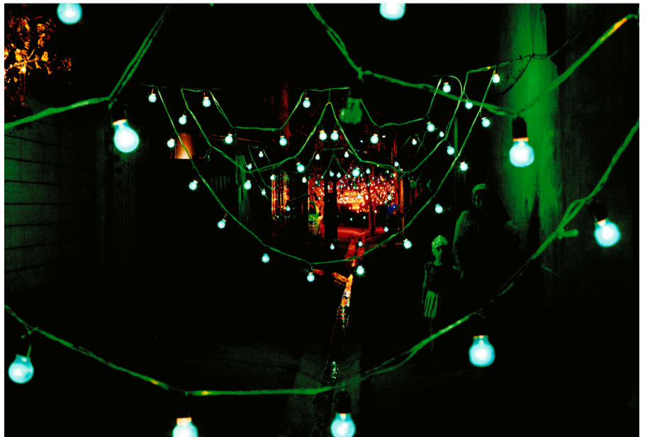
Abbas Kowsari, from the series Light , 2011