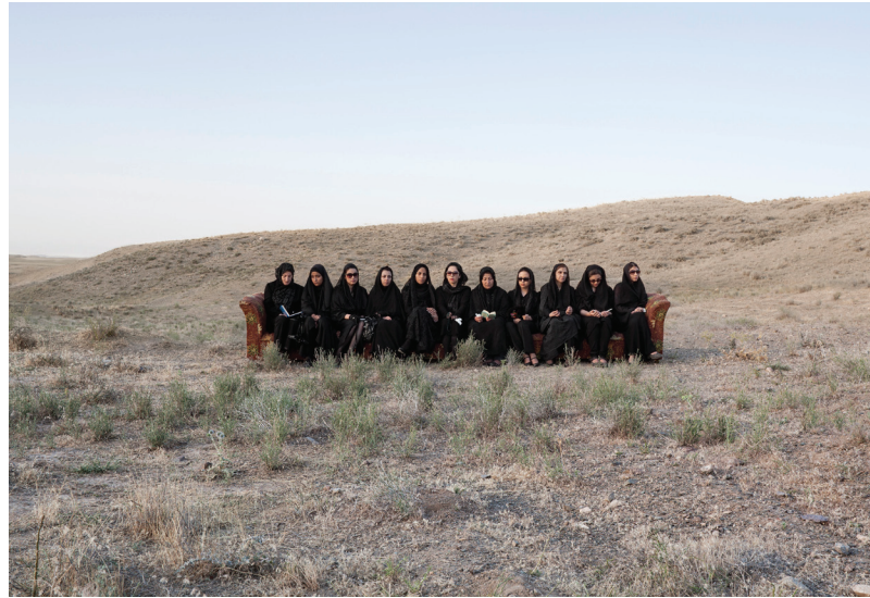
Gohar Dashti Iran, Untitled, 2013

This public-private dichotomy manifests itself in every aspect of contemporary life in Iran. For example, women must abide by the Islamic dress code and cover their hair and bodies appropriately. The arts and culture are also censored. Iranian