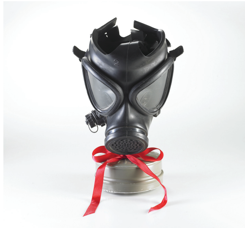
Shadi Ghadirian White Square , 2009

Shadi Ghadirian's Nil Nil series addresses the symbolic presence of political ideology and war within the home. Transforming the domestic space with the addition of military objects, she reminds us that war has a silent but powerful presence in people's minds and innermost private lives. In White Square , Ghadirian has photographed objects of military use—a helmet, canteen, ammunition belt, or grenade—that she decorates with a red silk ribbon. Recontextualized, these accessories of war become unfamiliar and appear at once menacing and delicate, their aggressiveness tempered by an element of the feminine.