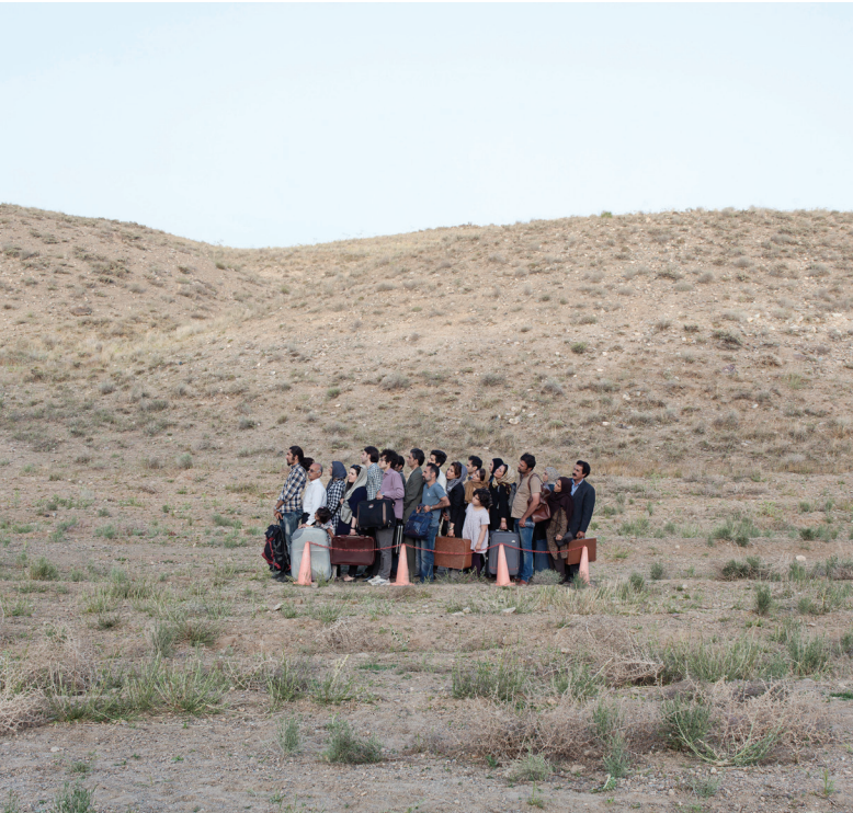
Gohar Dashti Iran, Untitled , 2013

Gohar Dashti explores fraught social and political issues through the carefully staged photographs of her series, Iran, Untitled . By tightly clustering groups of people such as travelers or soldiers in the middle of a desert landscape, Dashti creates mysterious tableaux that suggest the isolation of specific populations within Iranian society. At the same time, she underscores the insularity of her select groups by providing one element that compositionally binds the people together, such as a bathtub, a rug, or orange traffic cones. Dashti describes these images as haikus exploring the relationship between form and content. “It’s like objectifying a feeling; that is how an image reveals itself,” she explains. Ultimately, her work suggests the universal human need to bond with others, as well as the common urge to seek distance from the unfamiliar.