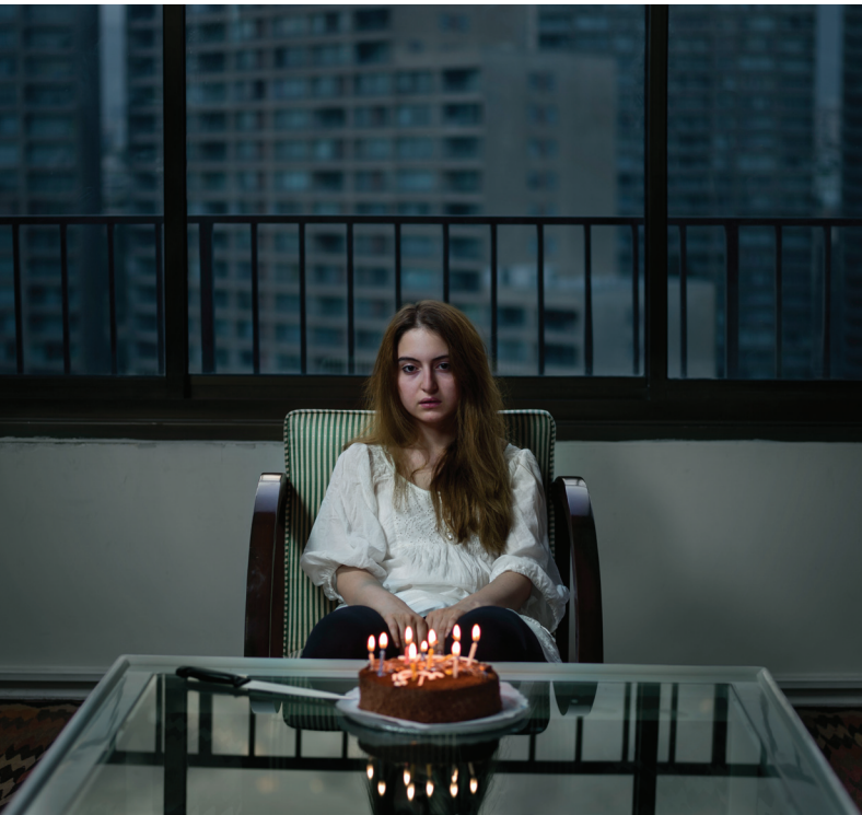
Newsha Tavakolian Look

In her series Look , Newsha Tavakolian delves into the unseen, private lives of Iranians. Peering into apartments in her building, she presents tenants who have lived within them for more than ten years. These photographs tell the story of middle class youths attempting to cope with their isolation from a conformist society, and battling with their lack of hope for the future. Over a period of six months, always at 8 pm, Tavakolian fixed her camera on a tripod in front of a window and tried to capture the moments that best illustrated her subjects' anxieties and concerns. Her neighbors are caught within the frame of that window, their images echoing the cold, nondescript buildings seen in the distance.