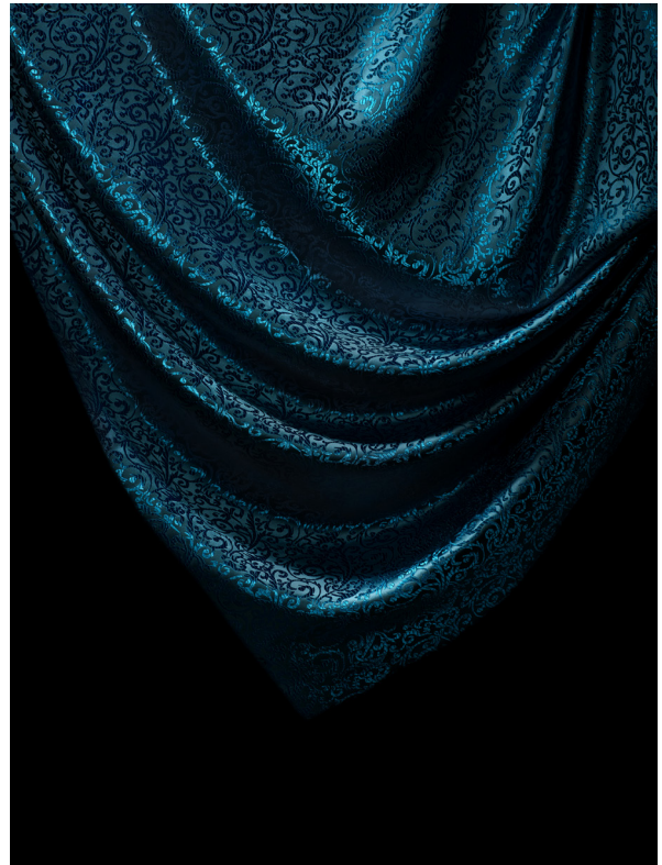
Lorenzo Triburgo, For Sidney , 2015

Working in a moment of complexity—when the spectrum of identities is broadening, becoming more visible and accepted, yet equal rights for all remains elusive in experience—these artists are navigating a space between validity and obscurity with pronounced sensitivity. Their works lay bare aspects of their private lives and those of their subjects, and in that willingness, invite our empathic attention. At turns triumphant and at other moments sorrowful or distressing, the artworks included present gender and sexuality as a panoply of possible variations—which for each of us reflect the ongoing complex influences of self, other, and image.