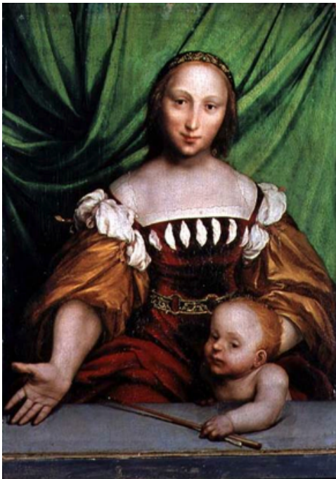
Hans Holbein the Younger's Venus and Cupid , 1524