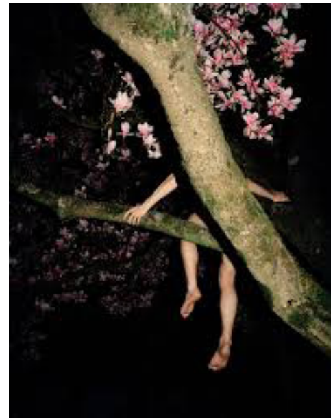
Alexandre Haefeli , Untitled , 2015