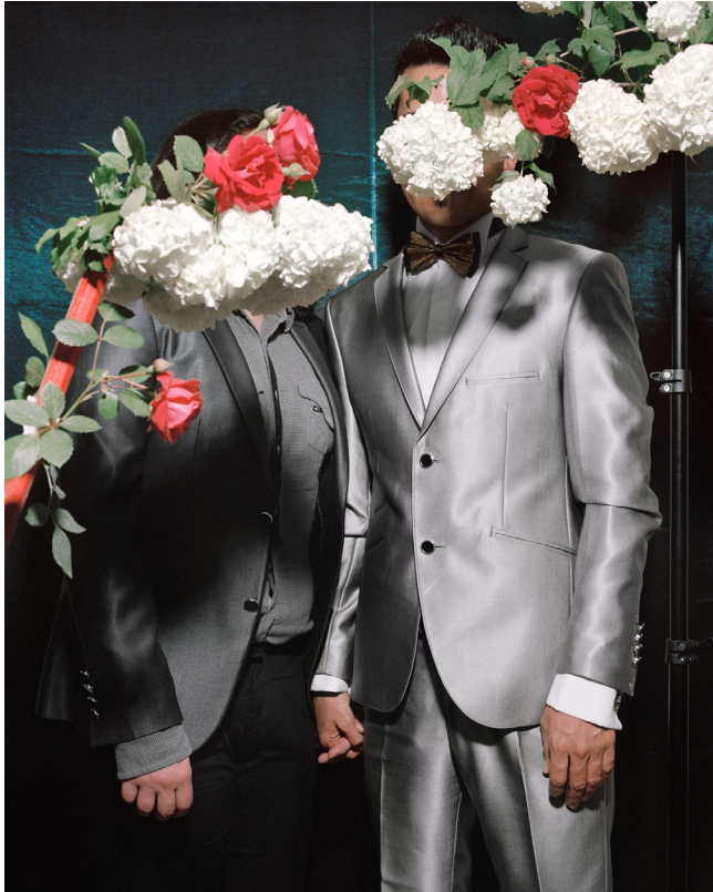
Laurence Rasti, Untitled , 2014

"In this context of uncertainty where anonymity is the best protection, this series of photographs questions the fragile nature of identity and gender concepts. It tries to give back to those people a face that their country has temporarily stolen."- Laurence Rasti