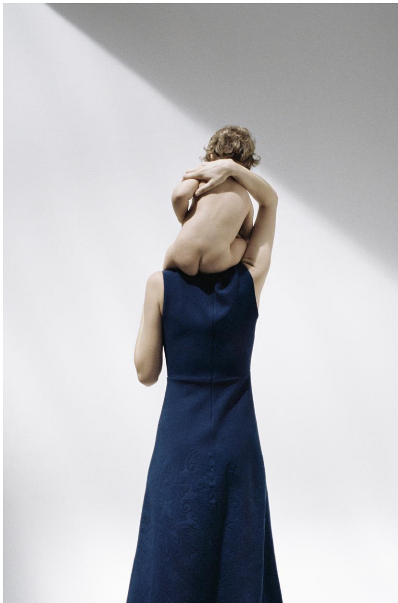
Hanna Putz Untitled (LL1) , 2012 Color Pigment Print