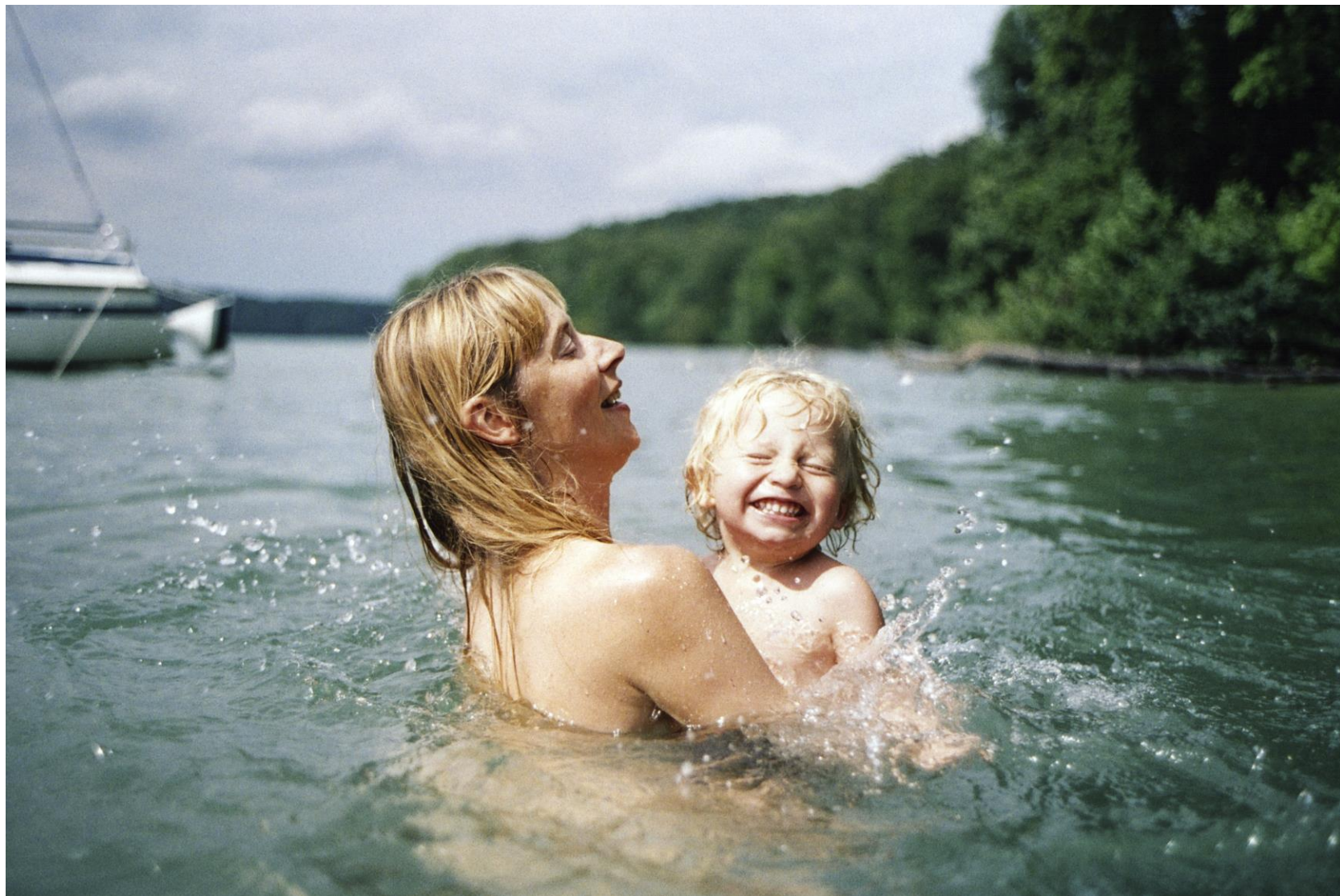
Fred Huning Untitled (Lake) , 2011