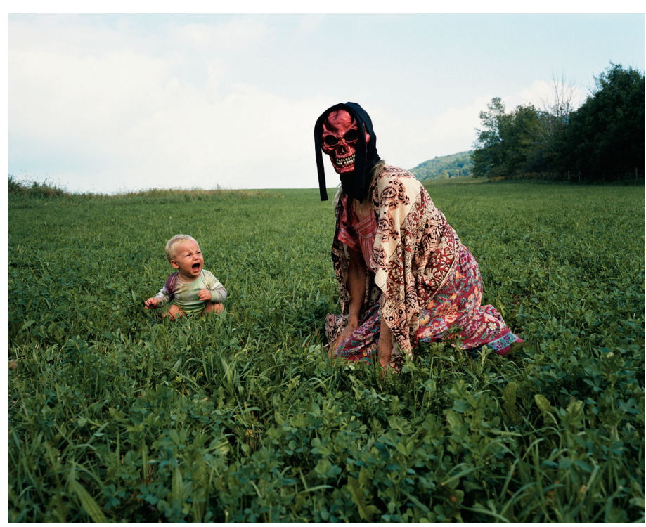
Tierney Gearon Untitled , from The Mother Project , 2006

The work in Home Truths reflects this relationship to photography and although often layered, discursive and