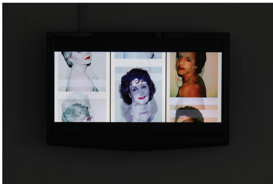
Still of Jan Tichy, Polaroids (Warhol) , 2012, video.

Jan Tichy: 1979:1 - 2012:21 at the Museum of Contemporary Photography