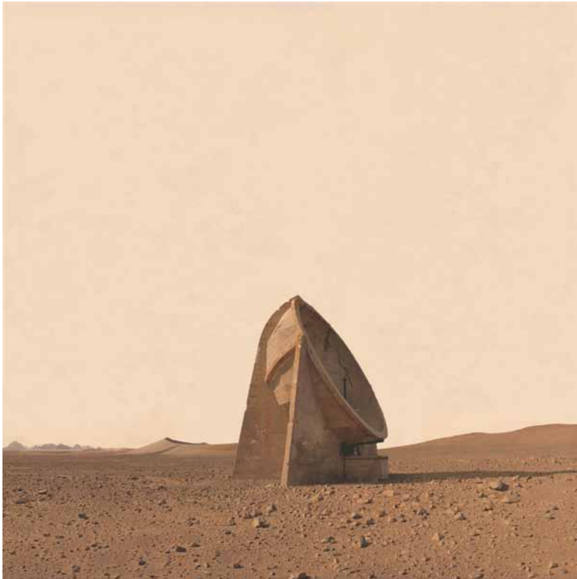
Kahn & Selesnick Concrete Ear 2 , 2010