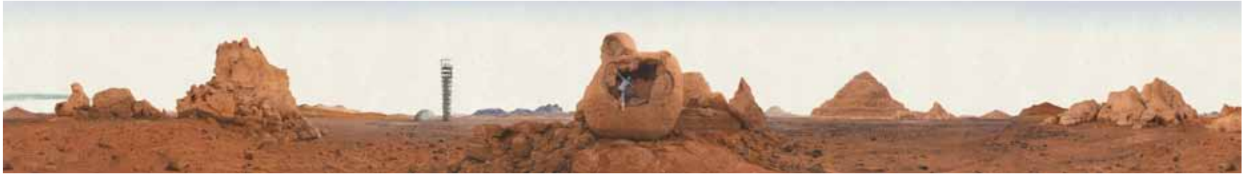
Kahn & Selesnick Et in Arcadia Ego 2 , 2010