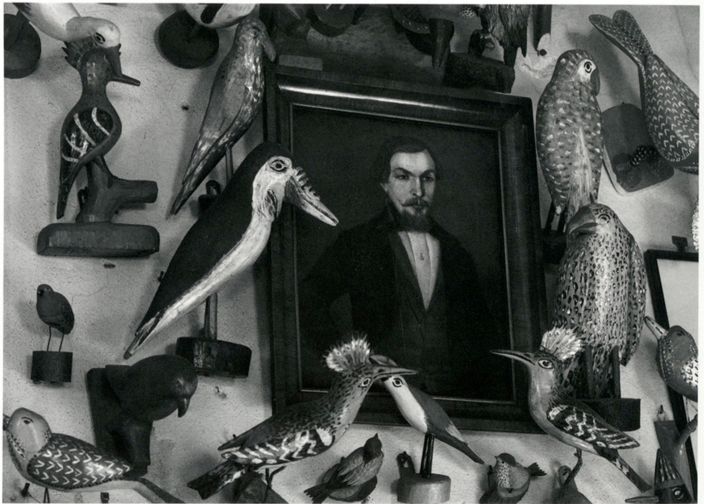
© Flor Garduño El Sr. de los Pájaros, Polonia , 1988 11-by-14 inches silver gelatin print Courtesy of the artist