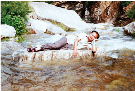
Thomas Sauvin Beijing Silvermine , 2010–present

For the past three years, collector Thomas Sauvin (French, b. 1983) has visited a Beijing recycling center each month and purchased color negatives for the value of the silver they contain, effectively rescuing discarded filmstrips from being melted down for silver nitrate. To date Sauvin has accumulated over a half a million photographic color negatives and has obsessively digitized each one to create an archive. The images are mostly snapshots taken by unknown photographers that were made within a twenty-year period—from the early 1980s when 35 mm color film became popular in China to the early 2000s, as consumer digital camera became ubiquitous—and thus Beijing Silvermine can be read as a unique portrait of China's capital city from the end of the Cultural Revolution to the country's rise in the global economy. Sauvin has discovered that the majority of the vernacular pictures document life's important occasions—