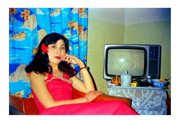
Thomas Sauvin From Beijing Silvermine , 2010-present C-print

the subjects of the images could be identified in the images; and whether to seek permission to use the images from the agencies that housed them and the individuals pictured.