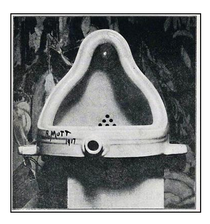
Marcel Duchamp, Fountain (documentation of sculpture),1917