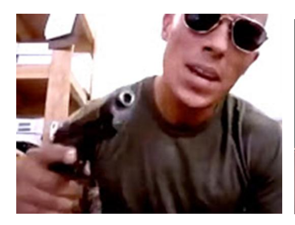
David Oresick Still image from Soldiers in Their Youth, 2009 Single-channel video installation

Simon Menner: Made images from potentially sensitive images from a government archive, used with permission from the agency that houses them but without the permission of those in the pictures. The identities of those in the pictures are obscured.