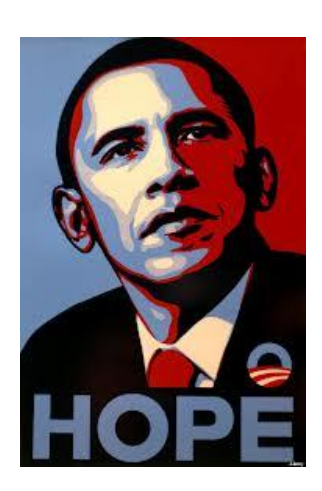
Shepard Fairey Hope ,2008