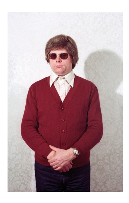
Simon Menner From a Seminar on Disguises Images from the Secret Stasi Archive, 2011–12 C-prints Copyright of the artist and the BStU, 2013

Simon Menner: Made images from potentially sensitive images from a government archive, used with permission from the agency that houses them but without the permission of those in the pictures. The identities of those in the pictures are obscured.