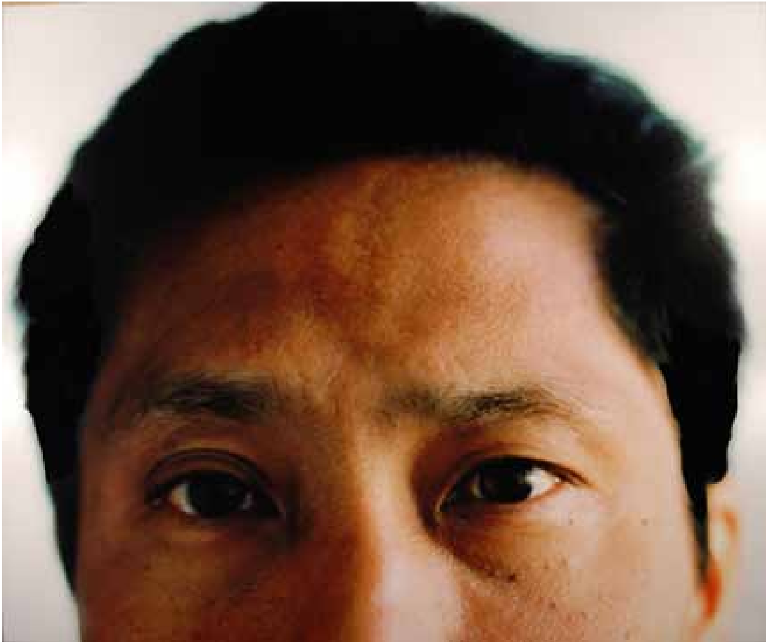
Juan Pacheco Untitled, from the "De Colores" series, 2007