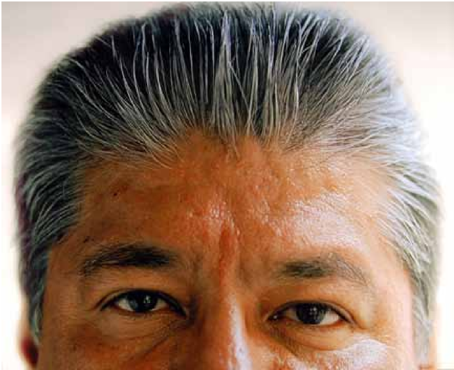
Juan Pacheco Untitled, from the "De Colores" series, 2007