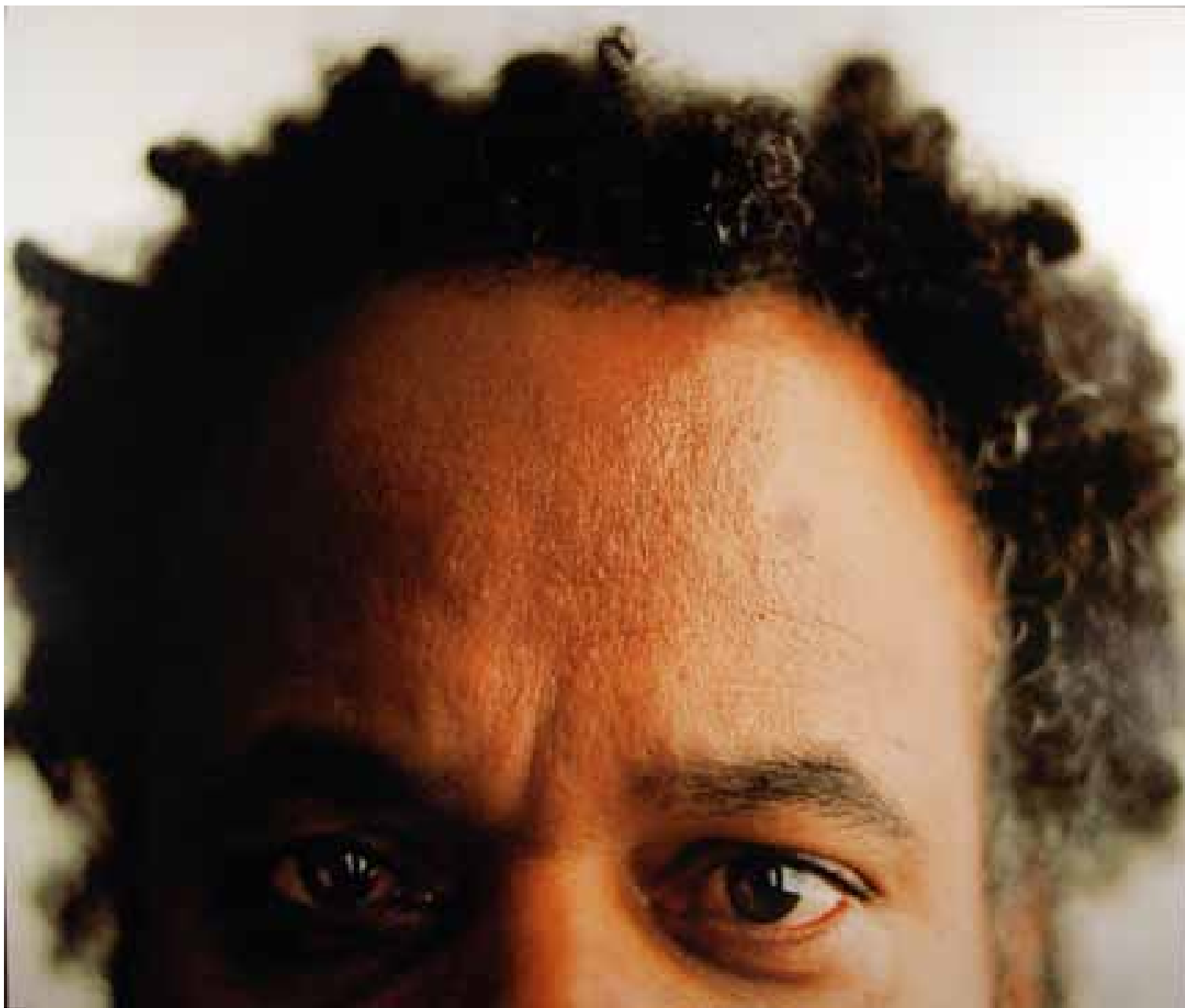
Juan Pacheco Untitled, from the "De Colores" series, 2007