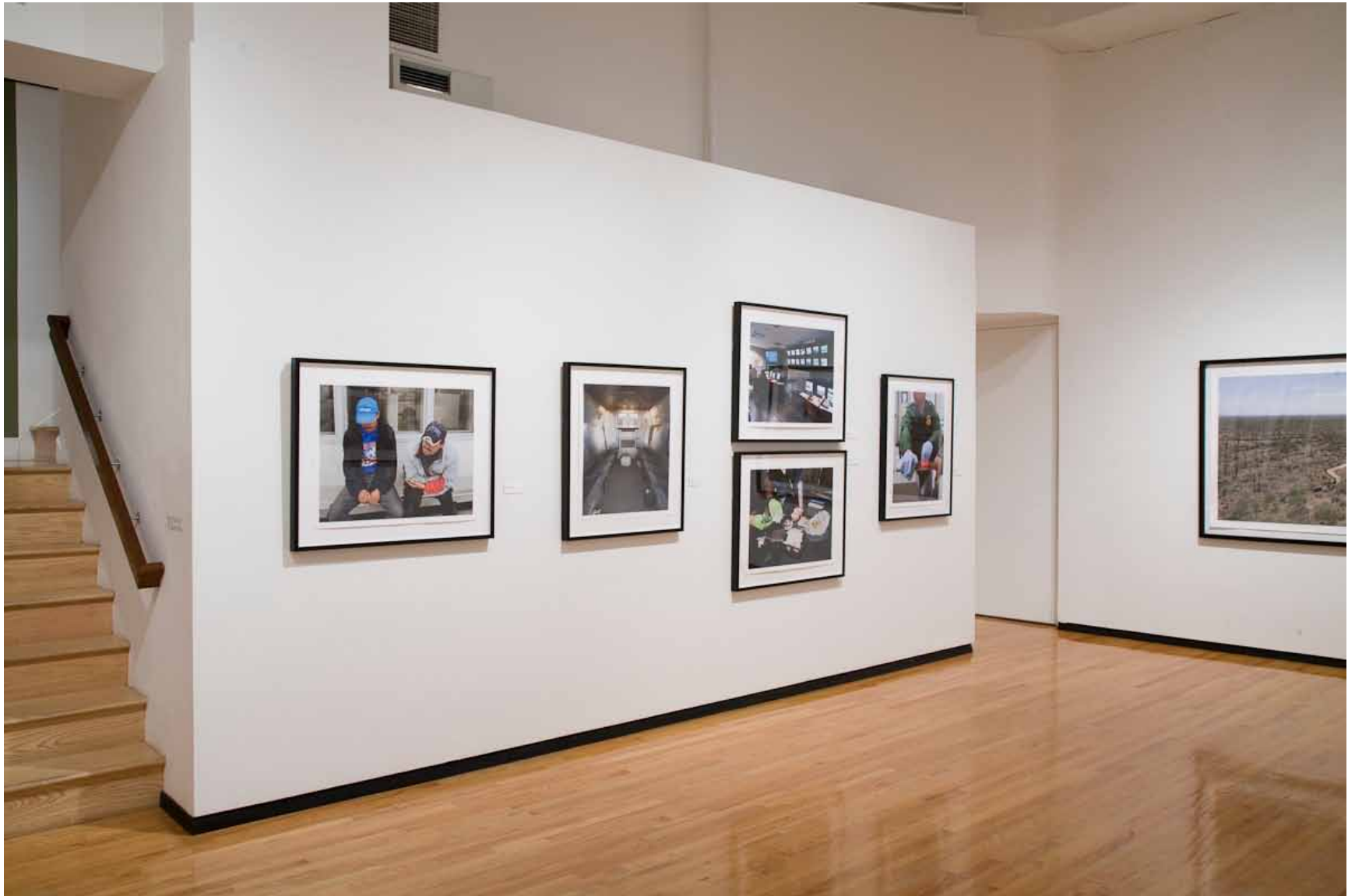
Installation shot, Museum of Contemporary Photography, 2010