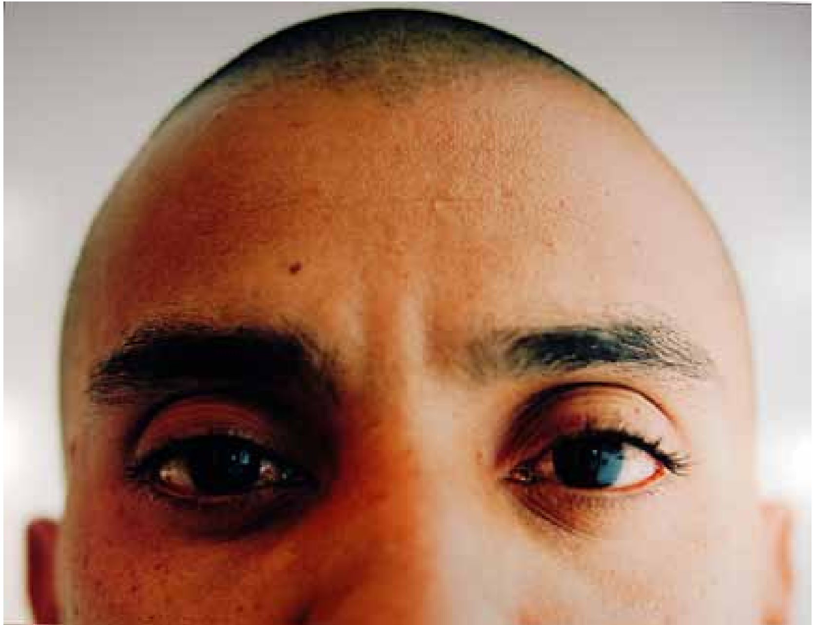
Juan Pacheco Untitled, from the "De Colores" series, 2007