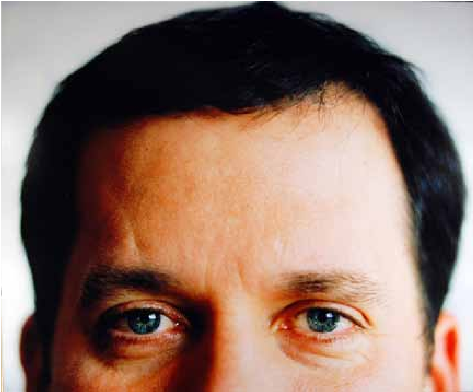
Juan Pacheco Untitled, from the "De Colores" series, 2007