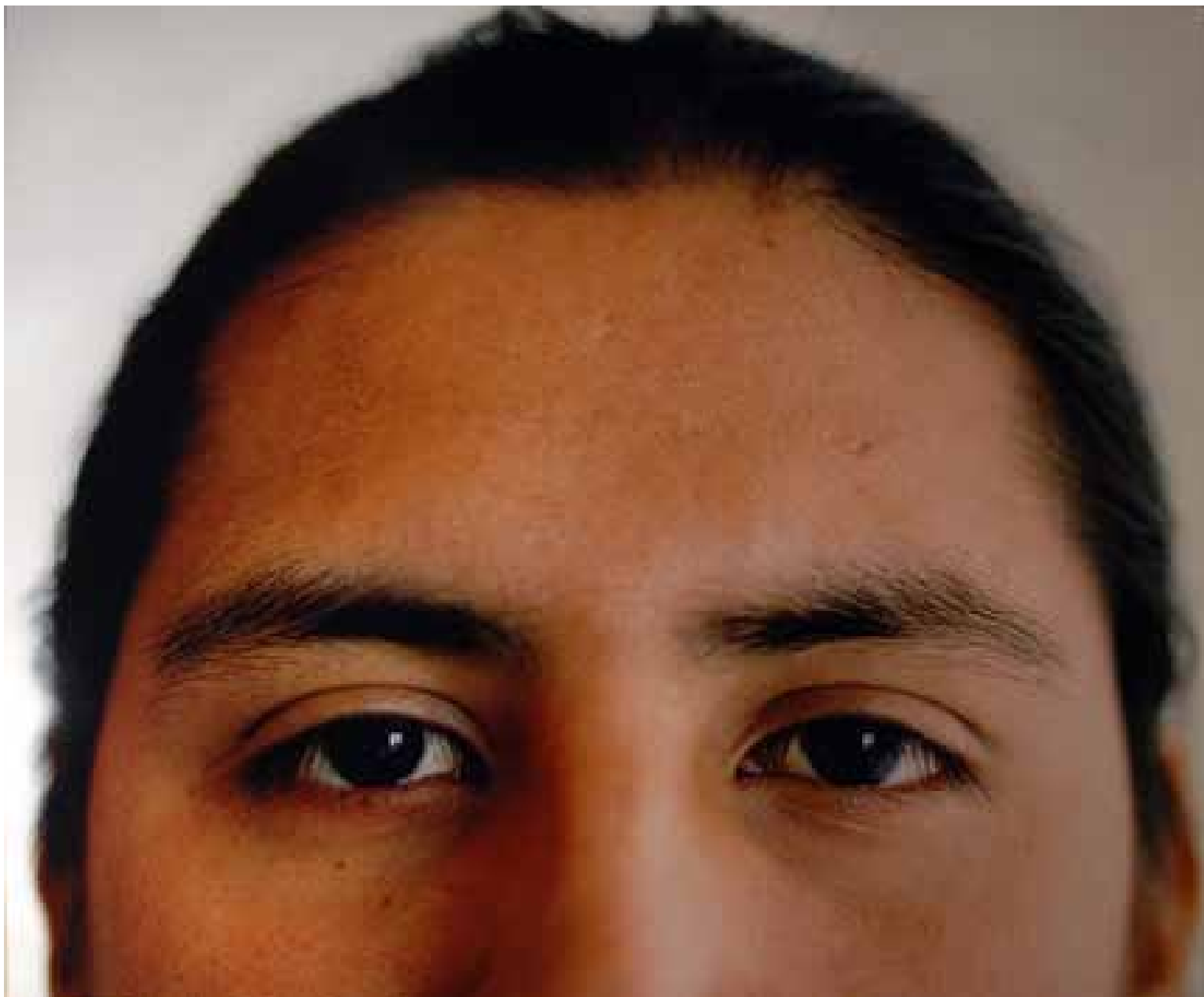
Juan Pacheco Untitled, from the "De Colores" series, 2007