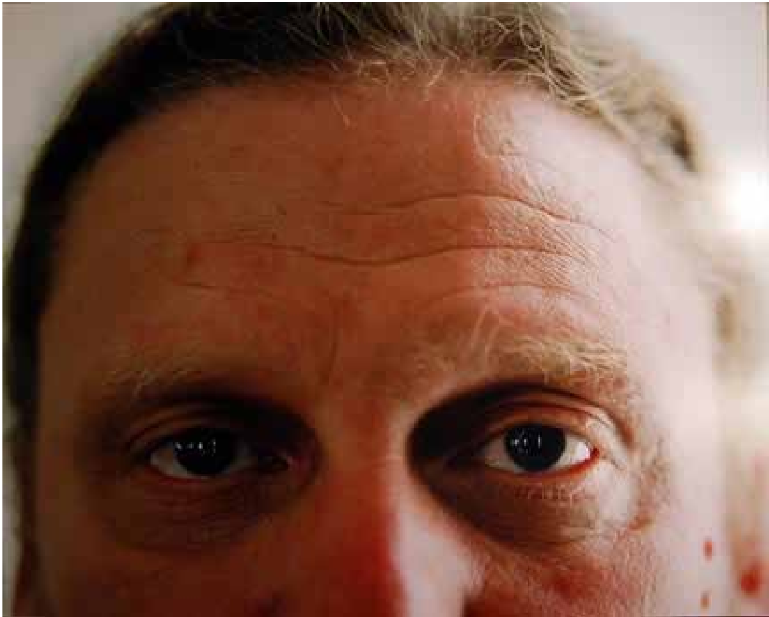
Juan Pacheco Untitled, from the "De Colores" series, 2007