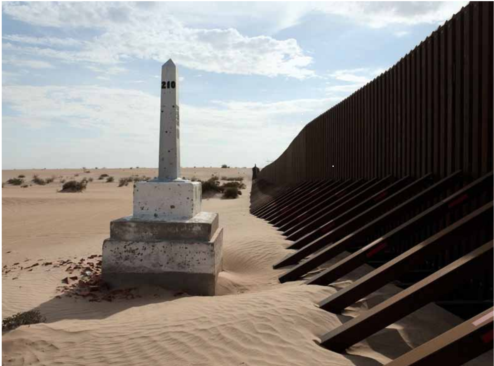
David Taylor Border Monument No. 210, 2009