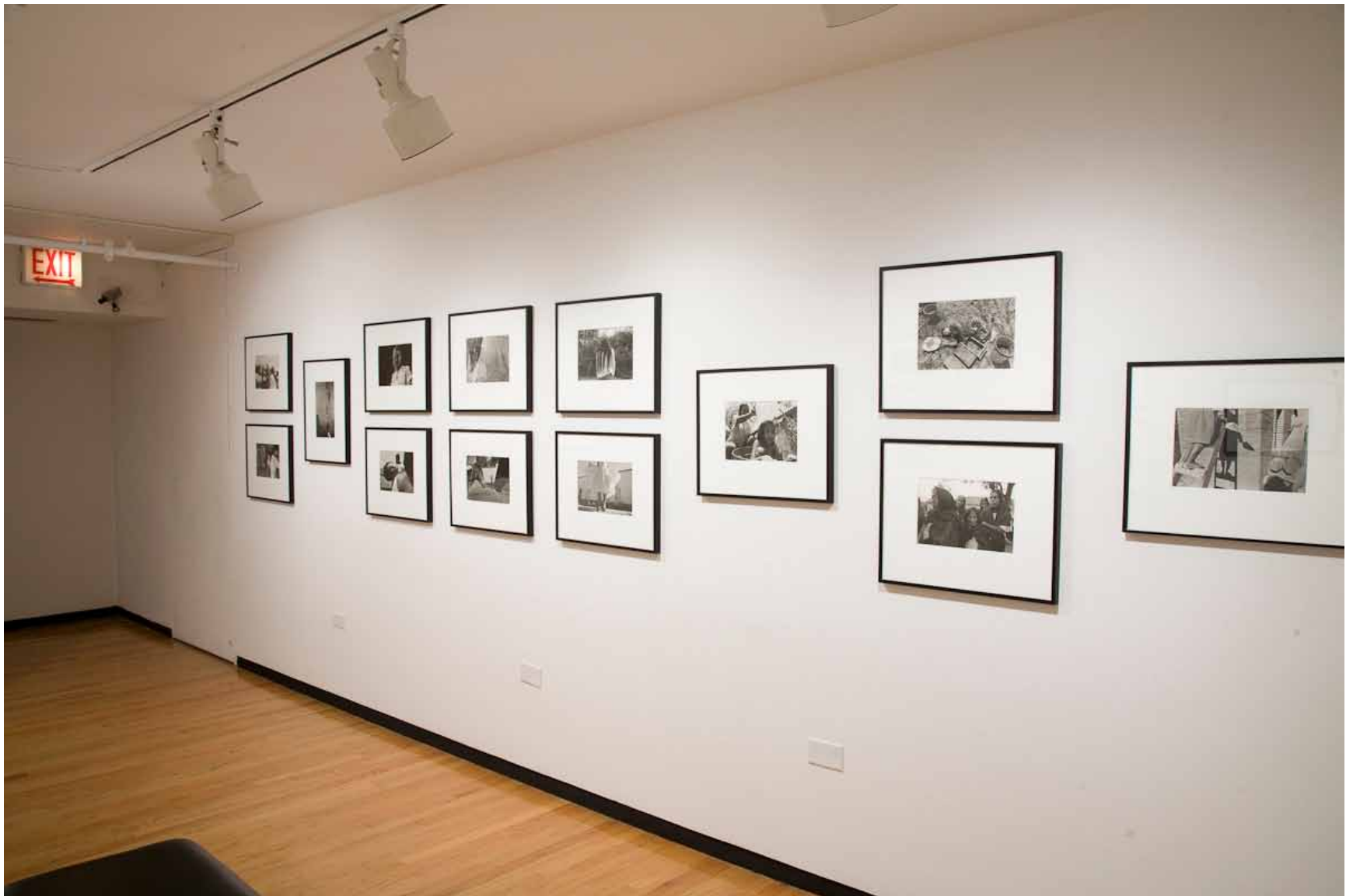
Installation shot, Museum of Contemporary Photography, 2010