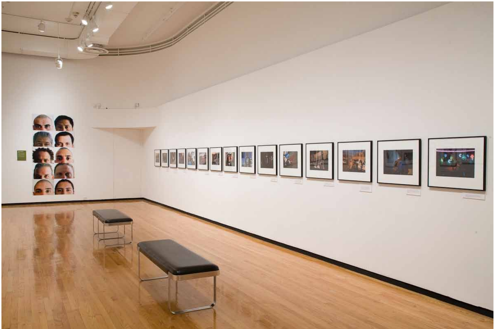
Installation shot, Museum of Contemporary Photography, 2010