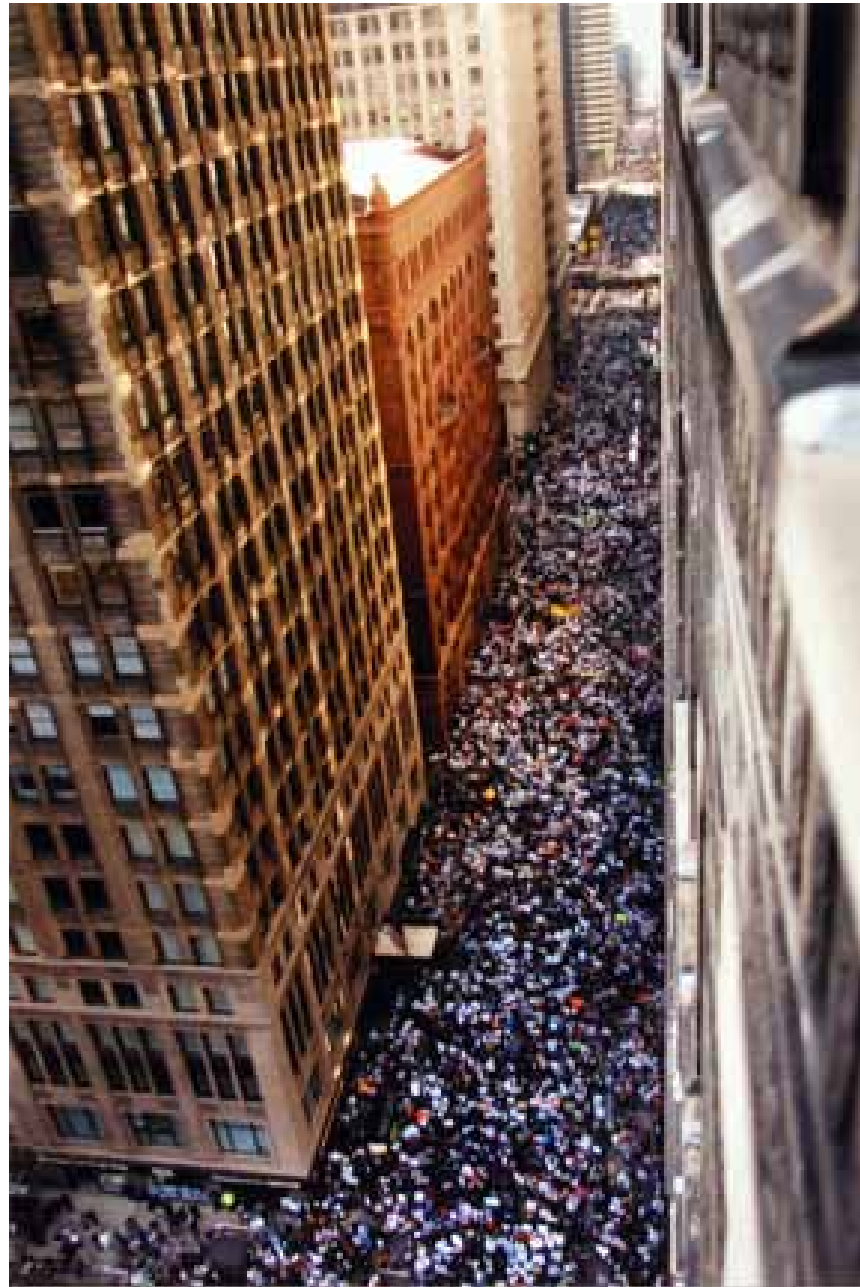
Antonio Perez Pro Immigration and Anti-HR 3347 Bill Rally of 100,000 People, March 10, 2006