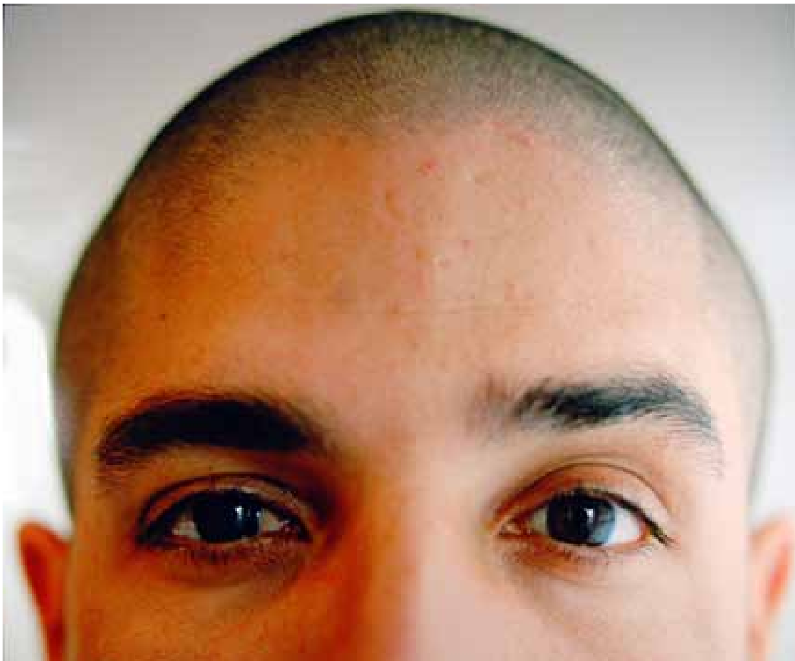
Juan Pacheco Untitled, from the "De Colores" series, 2007