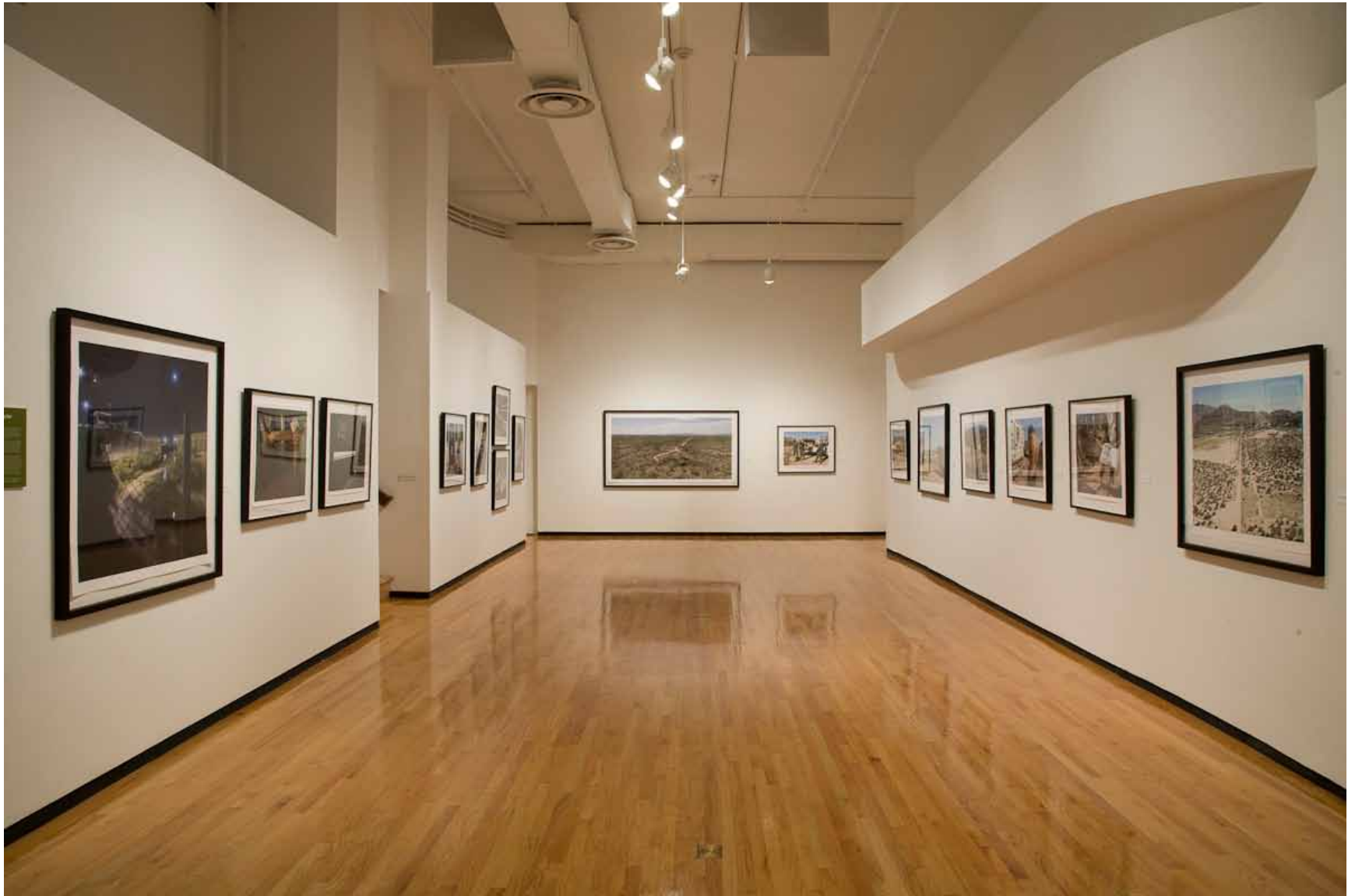
Installation shot, Museum of Contemporary Photography, 2010