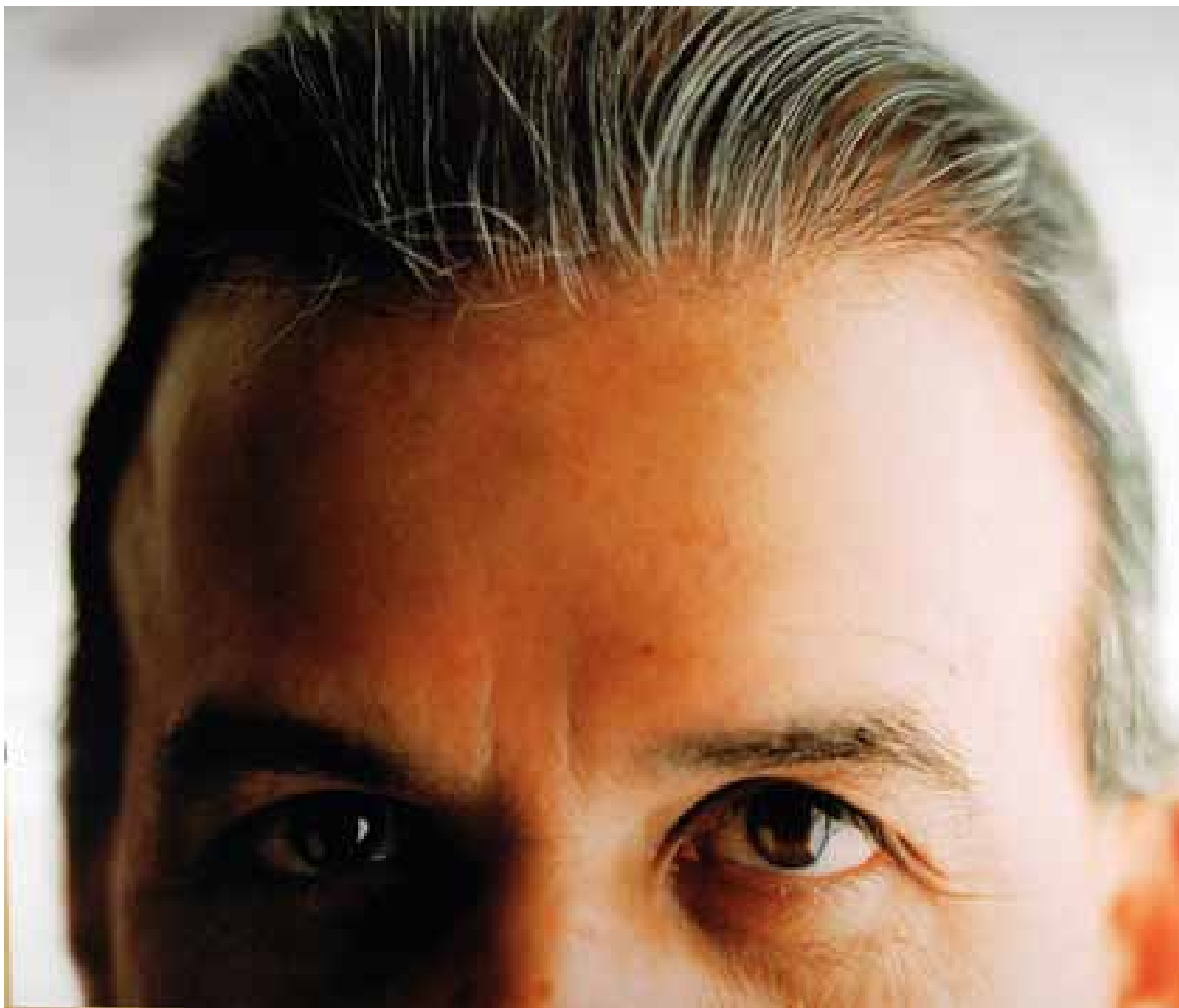
Juan Pacheco Untitled, from the "De Colores" series, 2007