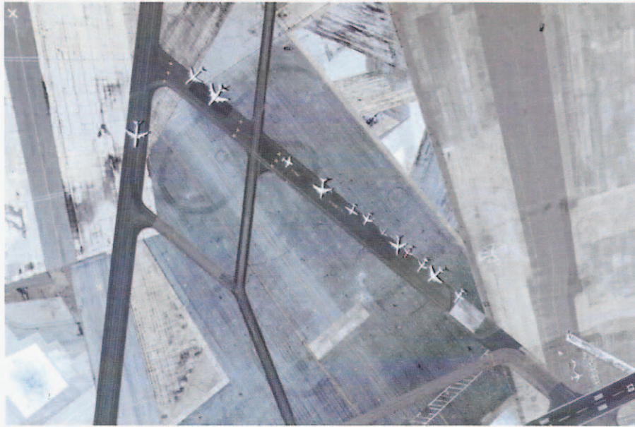
HUBERT BLANZ, X-PLANTATION , 2008. HUBERT BLANZ

Public Works at the Museum of Contemporary Photography in Chicago.