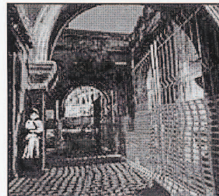
"At Portico of Octavia" was created through on-site slide projection.

The ruined grandeur of antiquity collides with the ephemeral figures of turn-of-the-century Roman Jews in 17 luminous photos by Shimon Attie, now on view at the Cleveland Institute of Art.