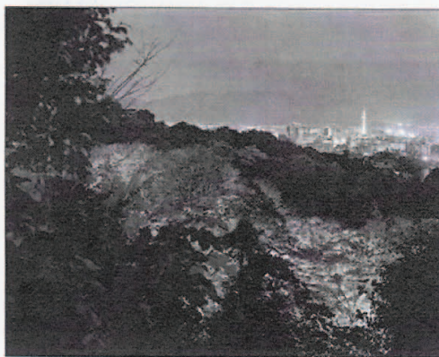
Fig 1 Christina Seely. Metropolis 35°00'N 135°45'E , 2007.

Simon Menner observes the makeshift shelters of those left out of the comfortable Western lifestyle. His project "Metacity" addresses the homeless communities of Chicago, Paris, and Mumbai. A small tent city lines the Seine, benches and storefront stoops become beds in downtown Chicago and the Indian capital. In choosing these three cities, Menner acknowledges a dispiriting truth of urban planning: despite the majestic designs of Burnham and Haussmann, Chicago and Paris face the same issues of displaced poor as the rapidly swelling, largely unplanned city of Mumbai. Plan or no plan, Menner would have us believe that poverty and struggle remain unavoidable.