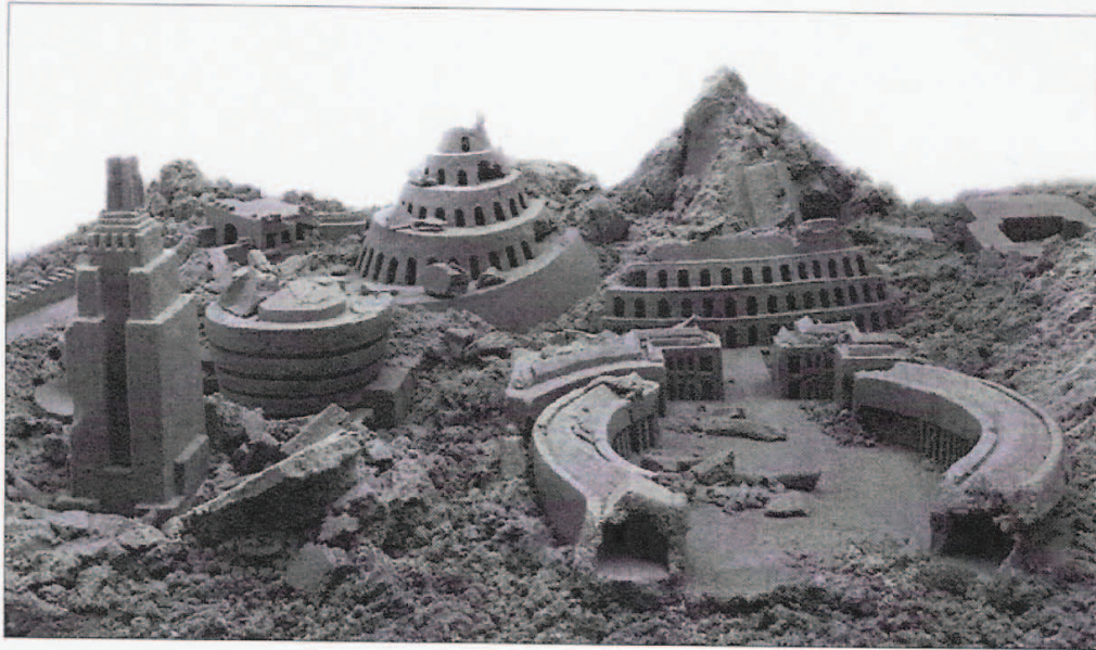
Fig 3 Liset Castillo. Pain is Universal but so is Hope (White) , 2007. Museum purchase.