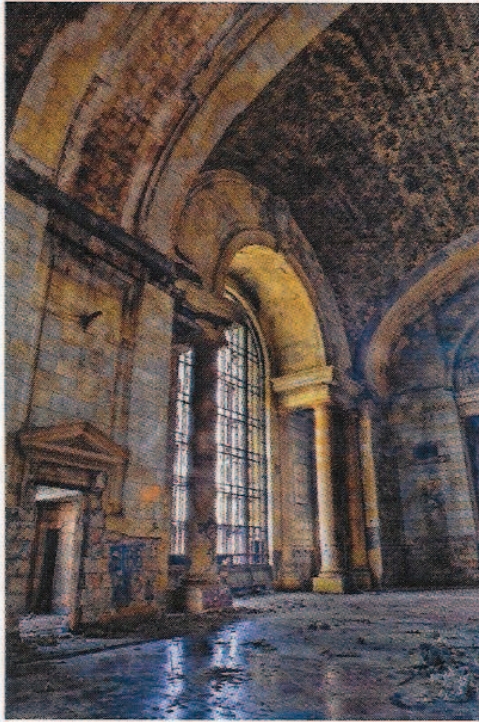
Eric Smith "Untitled," from the series "Michigan Central Train Station," 2008. Pigment Print, 20 x 30 inches.

The Museum of Contemporary Photography is proud to present "The Edge of Intent," an exhibition looking at the utopian aspirations of urban planners, and how their idealistic visions sometimes become static and incapable of adapting to changing environments and systems. The works in this exhibition warn us of the hazards of "thinking big," while urging us to consider the centrality of dynamism in successful urban design.