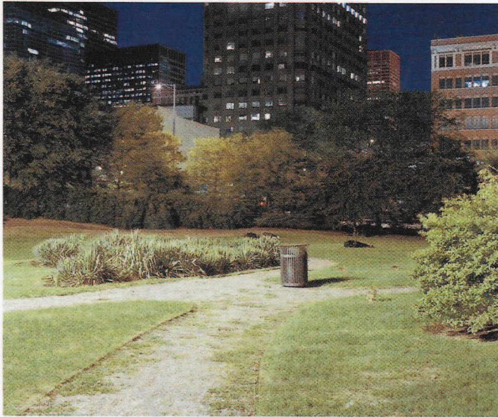
Simon Menner "Chicago Images: Wells and Harrison," 2005, Courtesy of the artist

into Lake Michigan, the Chicago River was reversed in 1900 due to the massive amounts of sewage and pollution that were poured into the river. While the pollution remains a constant, Long's photographs document the awkward proximity of leisure and commerce in this environment.