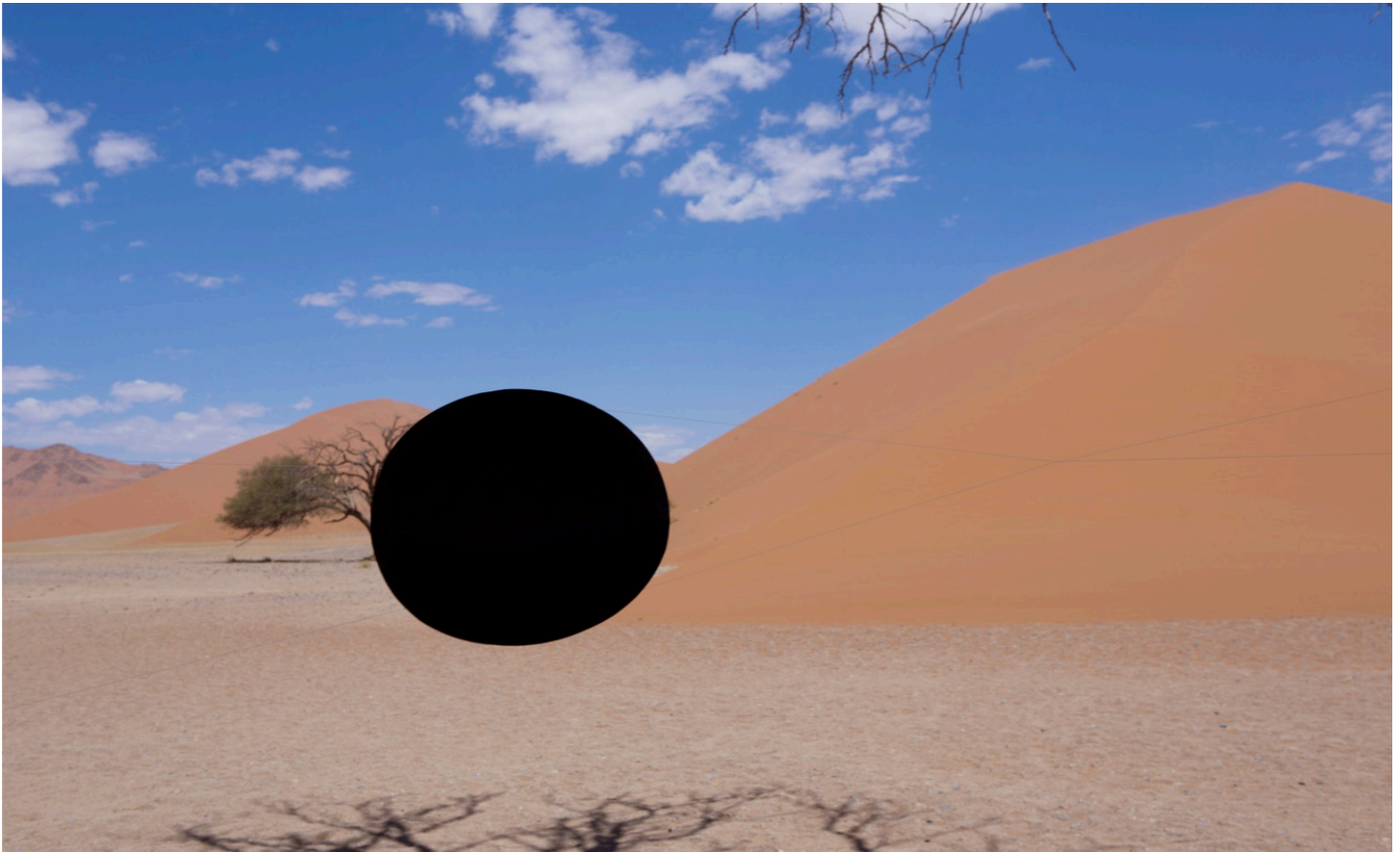
Viviane Sassen, Zone 01 , 2014