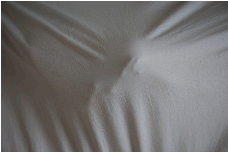
Viviane Sassen, Fingersheet , 2014