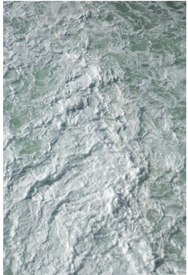
Viviane Sassen , Raging , 2013

Typical of Sassen's style are the abstract elements in her photographs, often including intertwined bodies, geometrical shapes, lush colors, and expressive shadows. Her work is visually tantalizing but also has a psychological depth that recalls surrealism, with references to mental disorientation or disorder, and even death. Although her personal history and memories play a role in everything she makes, her work expresses an uneasiness and anxiety that evoke emotions associated with contemporary life. Also timely are her experiments with abstraction in photography—right now, when so many artists are questioning the medium's traditional boundaries.