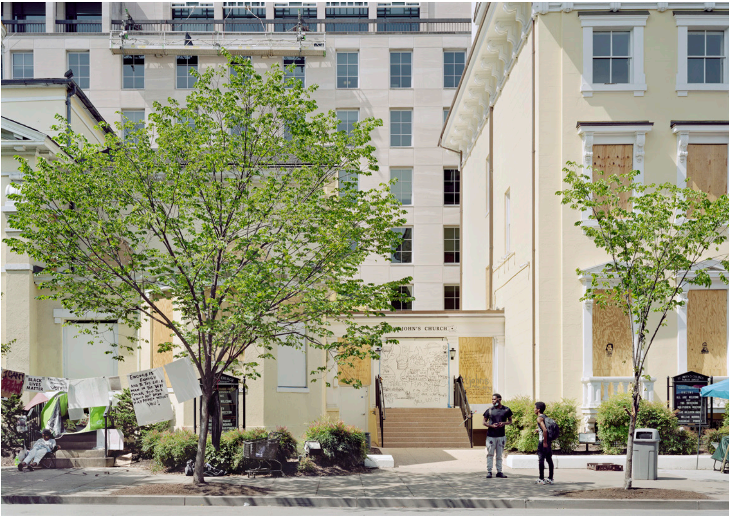
An-My Lê, St. John's Episcopal Church, Lafayette Square, Washington, D.C. , 2020