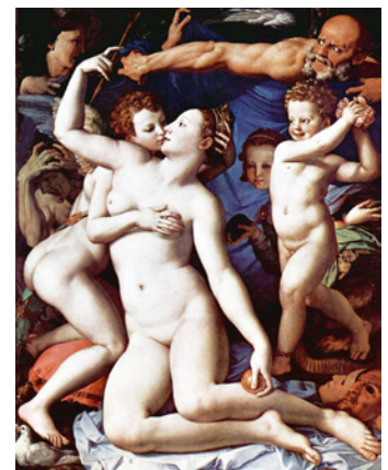
Left to right: Celestial dancer (Devata) mid-11th century, collection of the Metropolitan Museum New York; Agnolo Bronzino's painting, An Allegory with Venus and Cupid (c. 1545), collection of the National Gallery, London