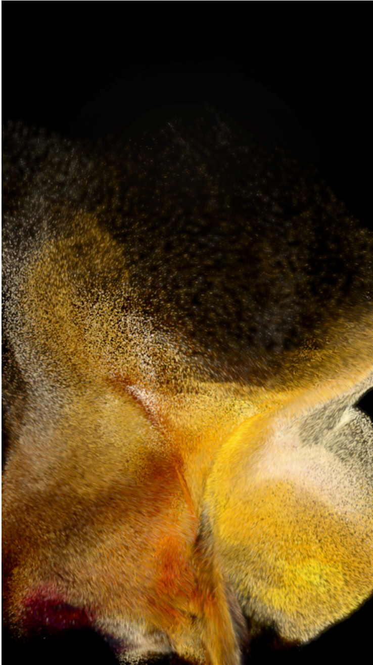
Shahzia Sikande, Reckoning , 2020 (animation still)