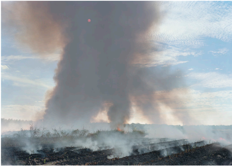
An-My Lê, Sugar, Cane Field, November 5, Houma, Louisiana, 2016

Similarly considering a damaging capitalist relationship with nature and its resources, An-My Lê points to the violent history of sugar cane farming on plantations in the American South—and the still profitable and problematic labor practices of modern-day sugar production. Sugar is a labor-intensive crop that grows in tropical or subtropical regions, nicknamed “white gold” for its high monetary value. In the 1800s plantations in Louisiana were rapidly expanded with slave labor, as the state became one of the highest producers of sugar worldwide. To this day, sugar is a $3 billion business in Louisiana alone. Here Lê engages with the land to present it as a site of trauma by ominously featuring a red sun shining through large plumes of smoke from the burning and charred fields below.