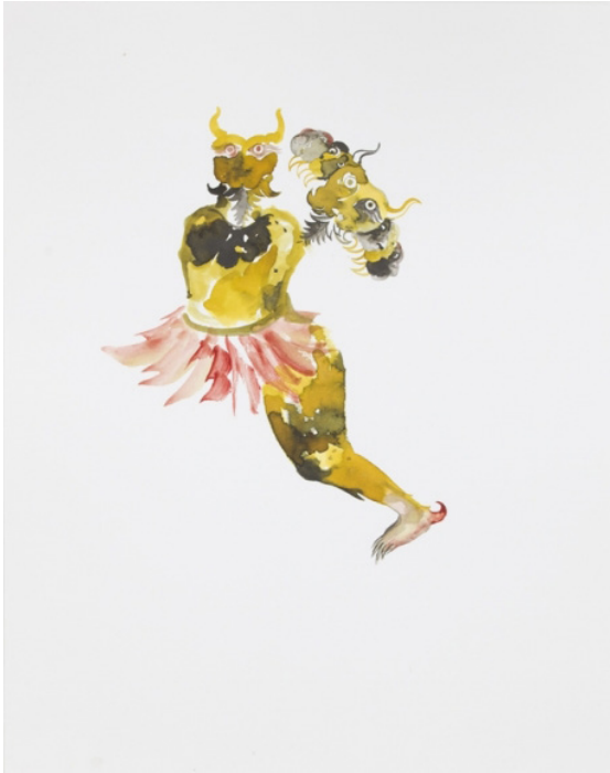
Shahzia Sikander, Of Masks and Bull 1 , 2017 © Shahzia Sikander Courtesy: the artist and Sean Kelly, New York

—Walt Whitman, "Song of the Open Road, 2"