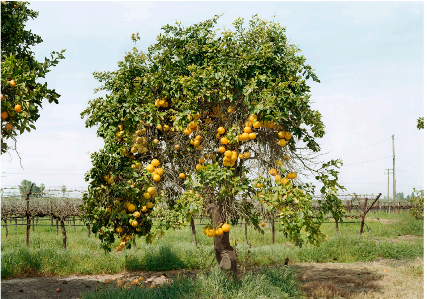
An-My Lê, Citrus Tree , Fowler, California, 2019