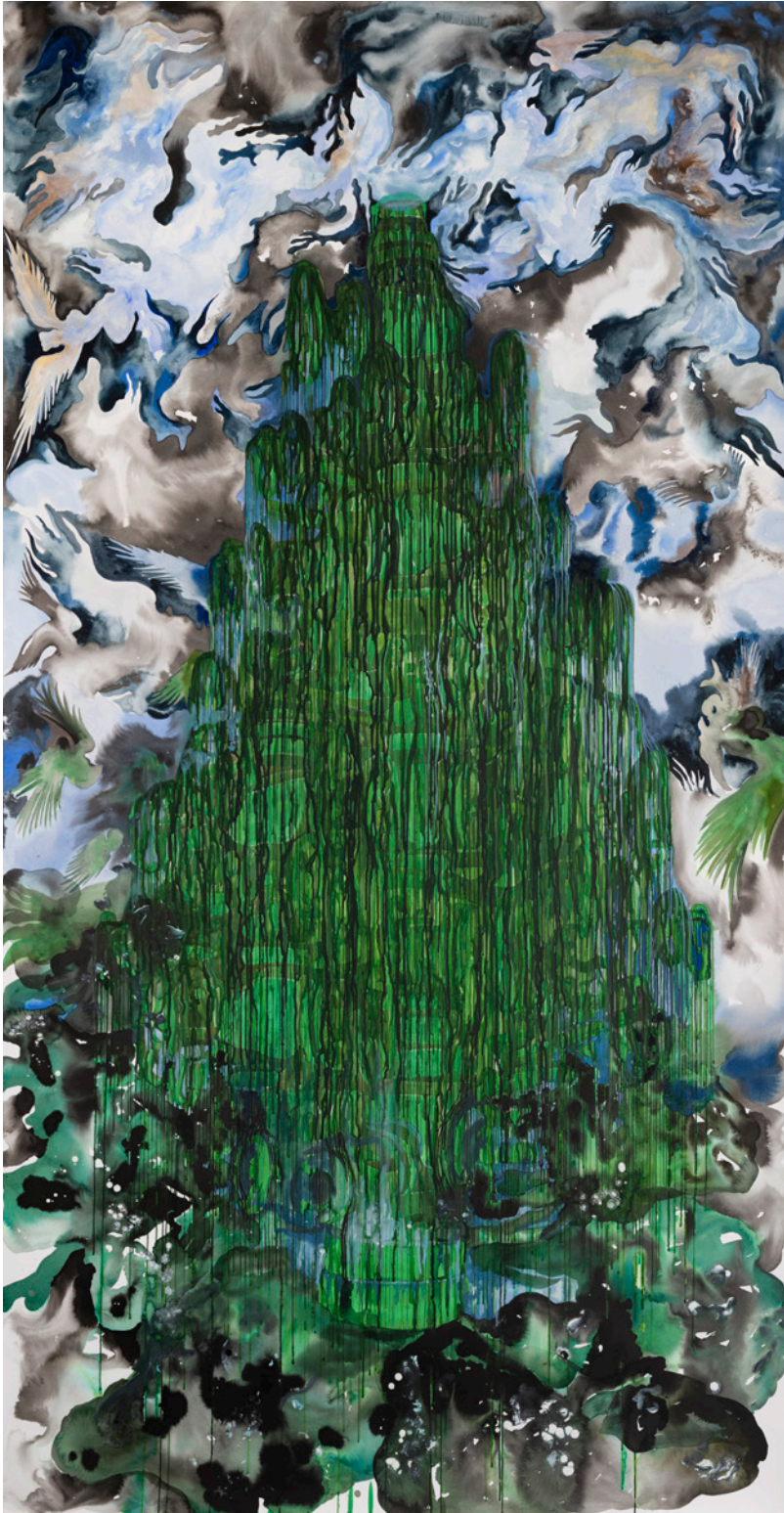
Shahzia Sikander, Shroud , 2020