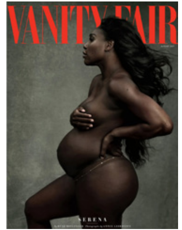
Image captions from left to right: I Love Lucy show (1952); Demi Moore in Vanity Fair magazine, (1991); Beyoncé (2017); Serena Williams in Vanity Fair magazine, (2017). (images not in the exhibition)

Ask students to consider some of the ways they have seen the pregnant body depicted in magazines, television, and movies.