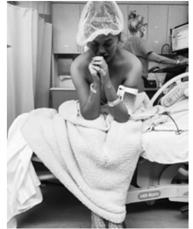
(image not in exhibition)

Statistically ten to fifteen percent of all pregnancies end in miscarriage—and one woman in 100 experiences repeat miscarriages. Yet, few people publicly address this form of loss, which can cause many women to feel ashamed or to grieve alone. xx On October 1, 2020 model and actress Chrissy Teigen posted images to Instagram that announced the loss of her child in the fifth month of her pregnancy. Teigen received mixed responses, with many praising her for the bravery in posting such a private moment and others criticizing her for being too open. Teigen's post has since caused many more women to come forward to publicly share their stories of pregnancy loss with others.