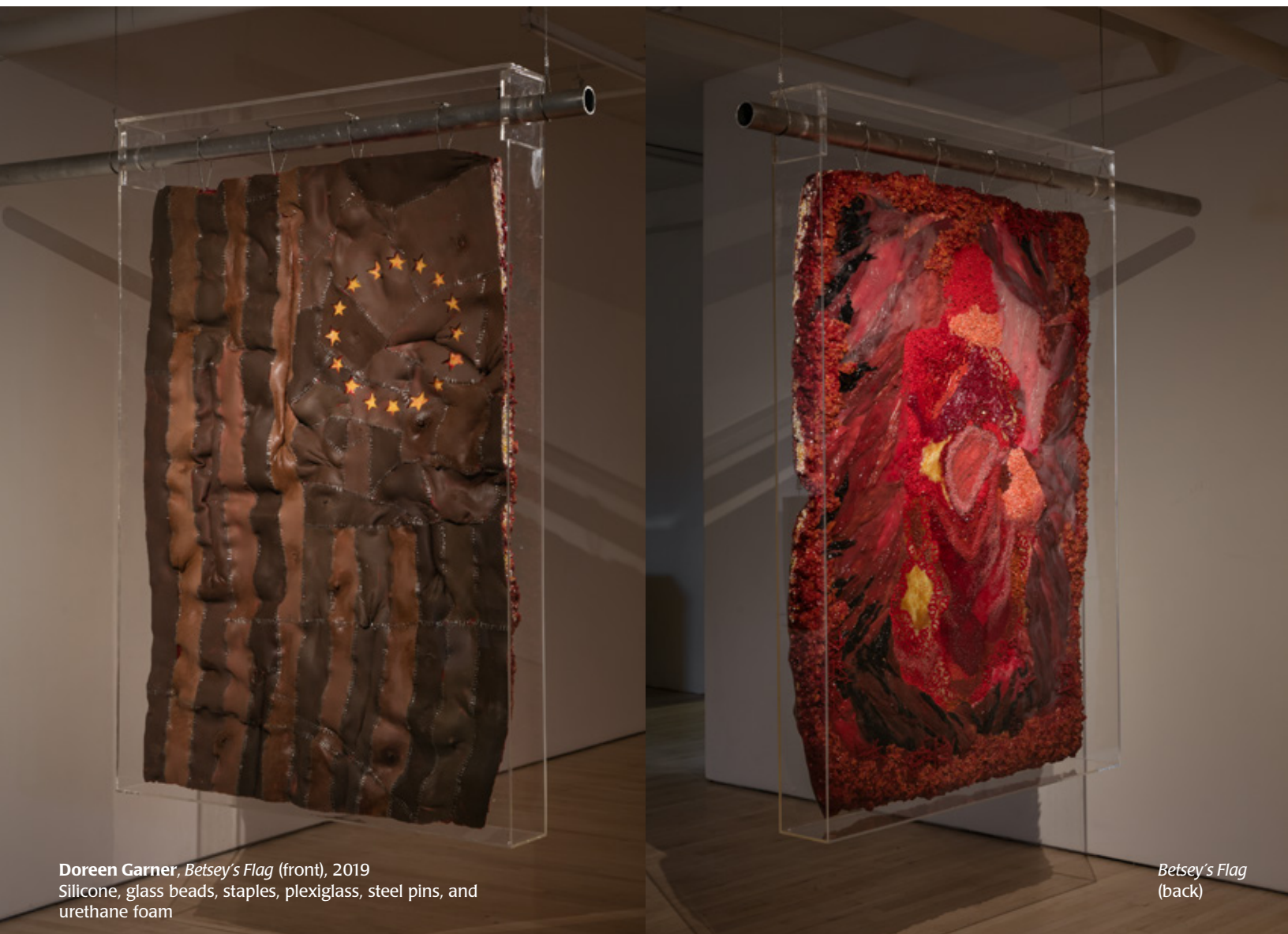
Doreen Garner, Betsey's Flag (front), 2019 Silicone, glass beads, staples, plexiglass, steel pins, and urethane foam

Garner’s piece, Betsey’s Flag , pays tribute to three women largely unacknowledged in the history of gynecology—Anarcha, Lucy, and Betsey—all of whom were made subject to Sims’s experiments. By titling this work for Betsey in Sims’s experiments, the artist makes a satirical but also deadly serious nod to Betsy Ross, the creator of the first US flag. Instead of symbolizing the thirteen original US colonies, this flag features sixteen stars that represent the number of beds in Sims’s laboratory.