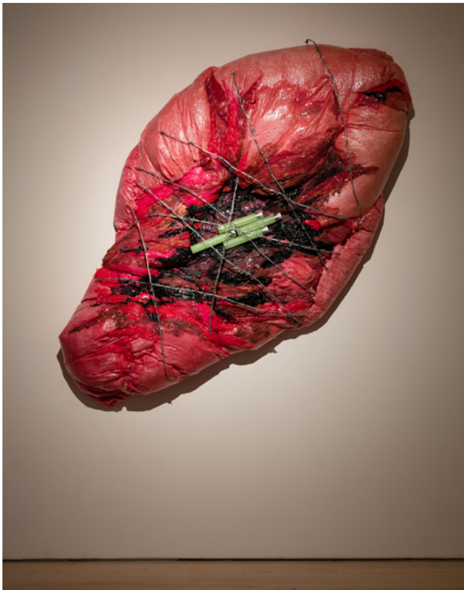
Doreen Garner , Henrietta: After the Harvest , 2019 Urethane foam, plastic, silicone, steel pins, barbed wire, and glass beads 71 x 38 x 10 inches