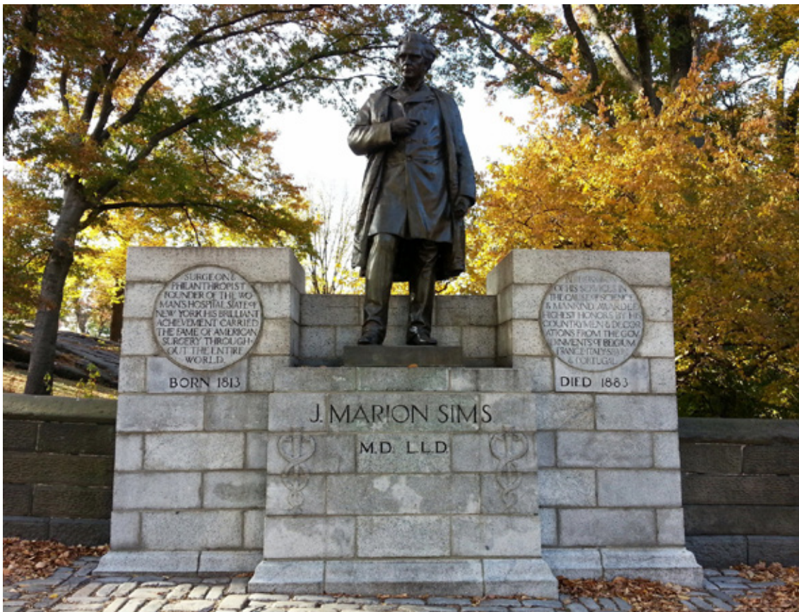
Monument to J. Marion Sims, New York