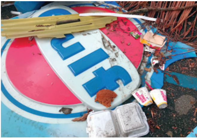
SUPAKID Combo Familiar, 2017