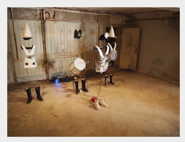
Jompet Kuswidananto, Third Realm Venice Series #2, 2011,

Jompet Kuswidananto (Indonesia, b. 1976) explores the complex history of colonialism in his homeland of Indonesia. Using video and multimedia installations, he examines the ways in which outside influences have transformed the country's social and political fabric. In his series, Java's Machine: Family Chronicle (2011), the artist investigates how one's ties to tradition are threatened by the rise of globalization. Using the family unit as a metaphor for national loyalties, a traditional father and modern son are presented as estranged from one another, dramatizing the tensions between old and new in contemporary Indonesian society.