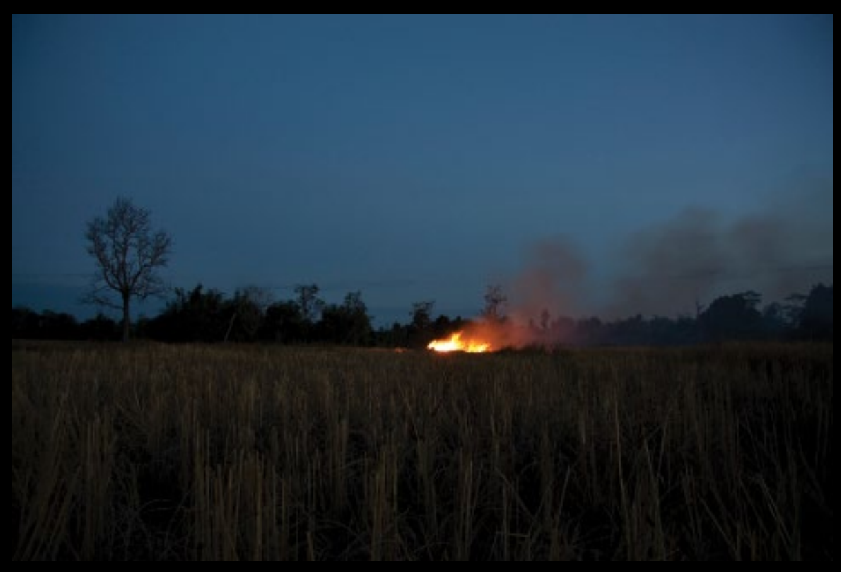
Apichatpong Weerasethakul, The Field, 2009