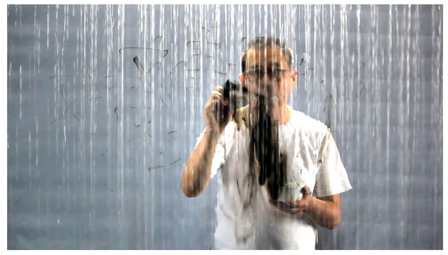
FX Harsono, Still from Writing in the Rain, 2011

Born and raised in Indonesia, FX Harsono (Indonesia, b. 1949) is ethnically Chinese, a minority that has historically been discriminated against by the Indonesian majority. In Writing in the Rain (2011), Harsono writes his name in Chinese characters on a clear wall, as both an assertion of identity as well as a nod to the cultural significance of calligraphy in Chinese culture. The connection between one's name and culture is especially pertinent for the author; as a teenager in the 1960s, an official cultural assimilation measure (which remained in effect until 2000) pushed him to change his given name to one that was more Indonesian-sounding. In the video, as rain eventually begins to fall, dissolving the text, Harsono continues writing, highlighting the persistence necessary to retain cultural identity when one is not part of the dominant culture. The piece emphasizes the delicate nature of identity, suggesting the sense of loss that comes with being culturally erased within one's own nation.