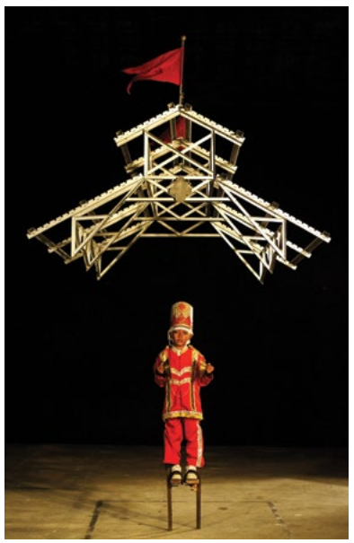
Jompet Kuswidananto, Family Chronicle #1, from the Java's Machine: Family Chronicle project, 2011

Jompet Kuswidananto (Indonesia, b. 1976) explores the complex history of colonialism in his homeland of Indonesia. Using video and multimedia installations, he examines the ways in which outside influences have transformed the country's social and political fabric. In his series, Java's Machine: Family Chronicle (2011), the artist investigates how one's ties to tradition are threatened by the rise of globalization. Using the family unit as a metaphor for national loyalties, a traditional father and modern son are presented as estranged from one another, dramatizing the tensions between old and new in contemporary Indonesian society.