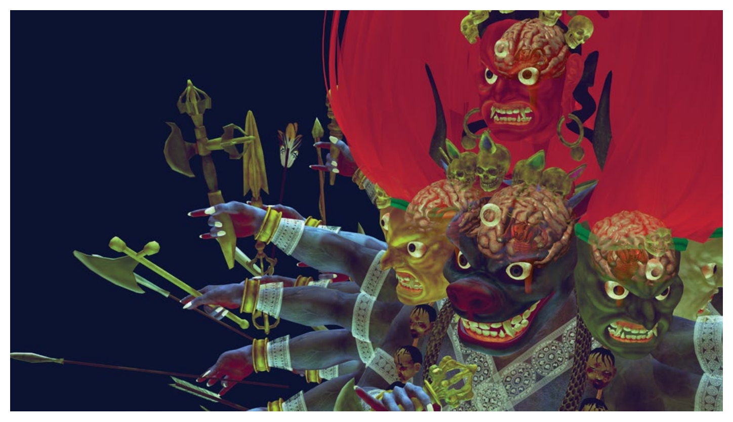
Lu Yang, Still from Wrathful King Kong Core, 2011

In Wrathful King Kong Core (2011), Lu Yang (China, b. 1984) explores the intersection of science and religion. In this film that recalls the appearance of virtual reality and video games, brightly-colored digital animations of Tibetan Buddhist deities populate the screen. These figures, while demonic in appearance, represent mercy in the Buddhist faith and are motivated by compassion. The film methodically analyzes the Buddhist figures, alongside imagery of the brain's response to anger. This imagery was created with technologies that map cognition. Collectively, the film implies that that through state-of-the-art biotechnology, even the spiritual realm can be digitized.