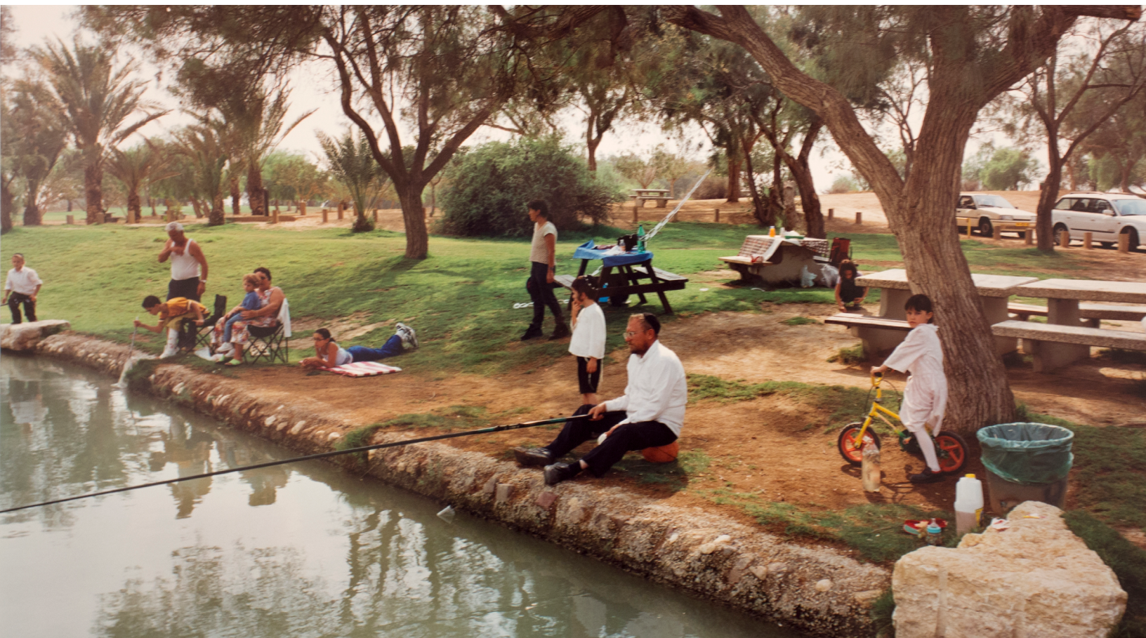
Eshkol Park, 2002

In her Leisure Time in Israel series (1997), Orit Siman-Tov documents people enjoying public leisure sites that have been stripped of cultural and natural markers and intentionally designed for universal appeal with only slight traces of the country evident around the edges of the frame. Though depicting leisure, the images convey an uncomfortable tension, as the act of establishing any park in a politically contested area is itself a marking of territory.