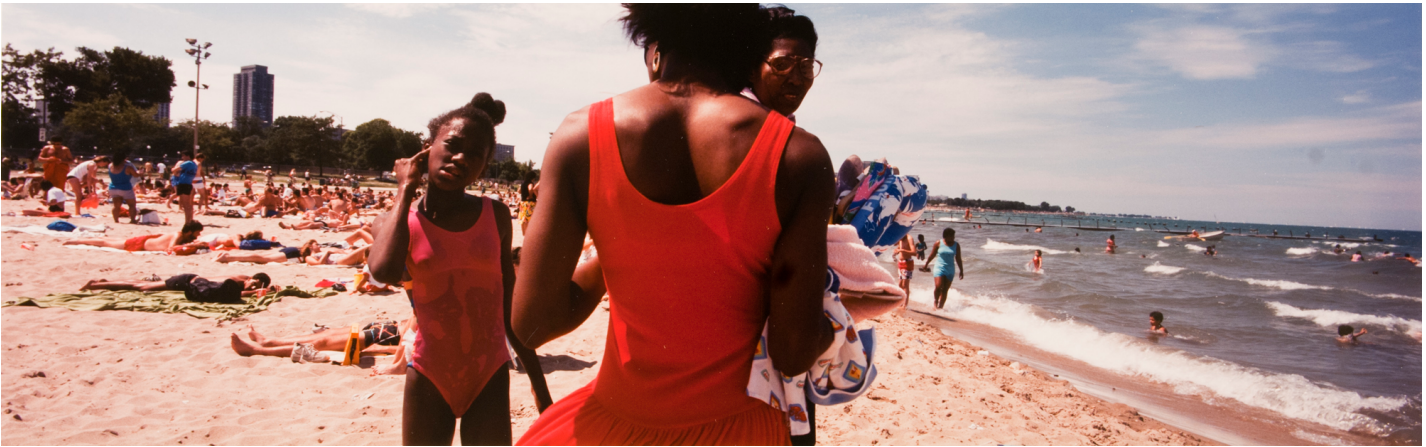
David Avison, North Avenue Beach, Chicago, 1988 , (top) North Avenue Beach, Chicago, 1987 (bottom)

Using a hand-built panoramic camera, David Avison conveys the scope and density of the crowds along the beaches of Lake Michigan in Chicago. These pictures were included in the large-scale, 1987 documentary project Changing Chicago . One of the largest documentary photography projects ever organized in a US city, Changing Chicago commissioned thirty-three photographers to document life throughout Chicago's diverse urban and suburban neighborhoods. Avison's images show Chicagoans during the dog days of summer and reflect how communities naturally form when people are outdoors.