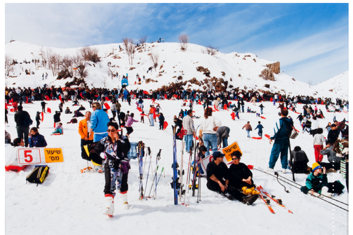
Mount Hermon, Israel, 1996

In her Leisure Time in Israel series (1997), Orit Siman-Tov documents people enjoying public leisure sites that have been stripped of cultural and natural markers and intentionally designed for universal appeal with only slight traces of the country evident around the edges of the frame. Though depicting leisure, the images convey an uncomfortable tension, as the act of establishing any park in a politically contested area is itself a marking of territory.