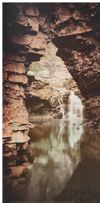
LEFT: William Henry Jackson, Falls in Nay Aug Park-Scranton, Pennsylvania, c. 1900 RIGHT: William Henry Jackson, Yucca Cactus at Hesperia, California, c. 1900

Photochrom prints are created by using lithographic limestone plates to add color to black-and-white negatives with each color requiring its own plate. Used as the world’s first postcards, photochroms were cheaply sold, collected, and mailed, primarily from the late 19th century until the end of World War I. Adding color to Jackson’s images helped people further picture the unknown western landscape, though the colors are represented from memory—much like Moran’s idealized paintings.