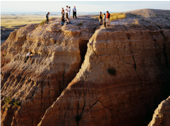
Greg Stimac, Badlands (Christian Bus Group) , 2007

Greg Stimac is interested in idiosyncratic, but very specific American behaviors—from meticulously mowing lawns, to shooting a gun, to “peeling out” cars on a blacktop. One of the most frequent themes in Stimac’s pictures is the American road trip. On a trip to the Badlands, South Dakota, during one of Stimac’s cross-country drives, Stimac witnessed a group of tourists edging dangerously close to the side of a cliff, not noticing a fallen fellow traveler as he scrambles to return to safety. The image reveals individuals eclipsed by nature and struggling to experience it or contain it as a tourist experience.