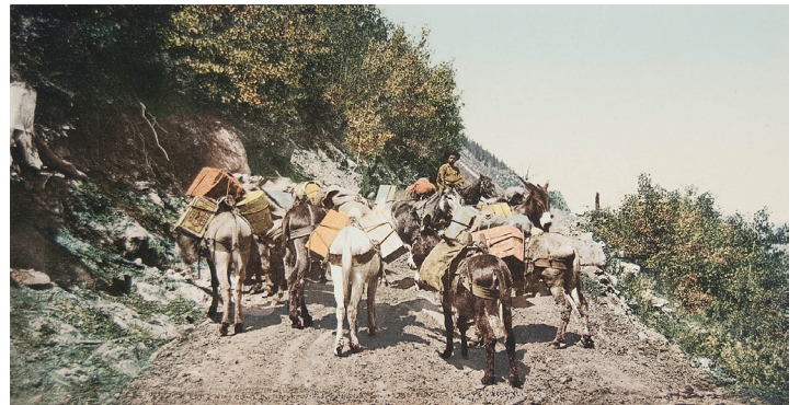
William Henry Jackson, Pack Train on Mountain Road , c. 1870

Using 8x10-inch plate-glass negatives, Jackson's equipment weighed around 300 pounds and had to be carried on the backs of mules. Each negative needed 45 minutes to set in his portable darkroom, making his task both arduous and time-consuming. The wet-plate collodion process was invented and used in the mid-19th century and was famously utilized by the photographers of the Civil War.