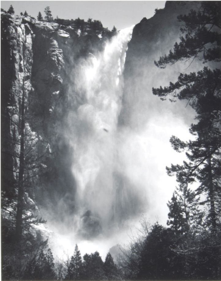
Bridalveil Fall, Yosemite National Park, California, 1927