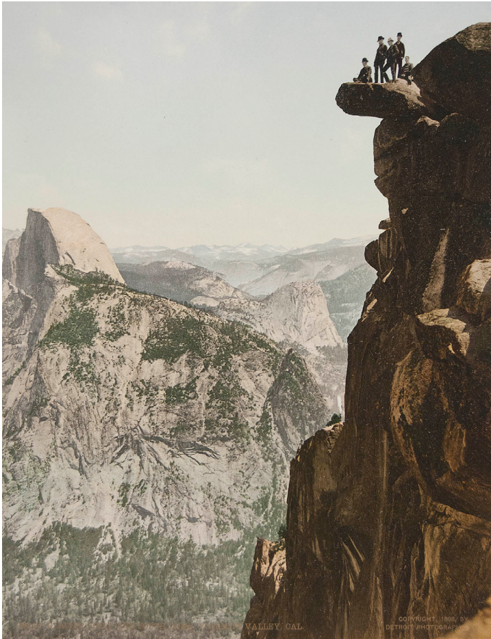
William Henry Jackson, Glacier Point and South Dome, Yosemite Valley, California, 1898

William Henry Jackson created some of the first photographs of the American West in 1871, when he participated in a federally funded expedition with geologist Ferdinand Hayden and a group of approximately thirty-five other men, including renowned painter Thomas Moran. The expedition covered areas in present-day Wyoming, Oregon, Colorado, and Utah that had previously remained unexplored by non-Native people to dispel claims that the West—rich with bubbling hot springs and spouting geysers—was hellish and to be feared. Jackson’s photographs and Moran’s paintings portrayed the remarkable beauty of the land and were included in a comprehensive report Hayden presented to the US Congress to argue against its sale at public auction. Their efforts were effective, and in 1872, President Ulysses S. Grant signed the Act of Dedication, establishing Yellowstone as the first National Park, protecting 2,219,789 acres of land as “pleasuring ground for the benefit and enjoyment of the people.” 1