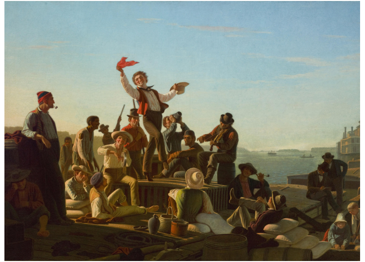
George Caleb Bingham, Jolly Flatboatmen in Port, 1857 , Collection of the Amon Carter Museum of American Art

In 2015, the Amon Carter Museum of American Art commissioned Terry Evans to document the Trinity River as it passed through the museum's hometown of Fort Worth, Texas. The resulting photographs were then presented alongside paintings and drawings by the mid-19th-century painter George Caleb Bingham. Bingham's paintings feature idyllic portrayals of daily life along the Missouri River during American westward expansion, differing from Evans's depictions of the same area over a century later. Mirroring Bingham's approaches to pose, gesture, and light, Evans illustrates the intimacy and conviviality of the riverbed as a gathering place for the nearby communities, even among a heavily engineered and polluted landscape.