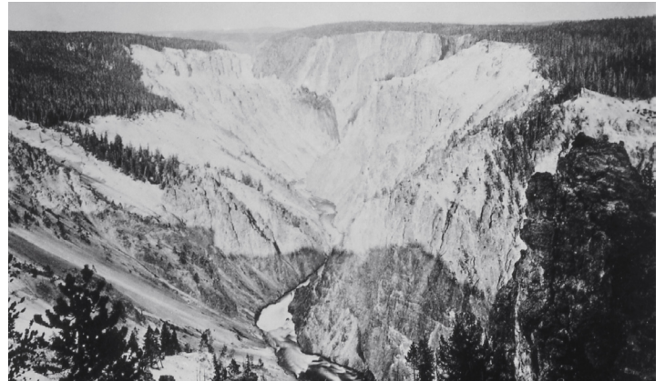
William Henry Jackson, Grand Canyon of the Yellowstone , 1871

Photography, which was only invented in 1839, was still a bit of a novelty at the time of Hayden's expedition. In contrast to Thomas Moran's paintings—which could be viewed as overly romanticized interpretations—William Henry Jackson's photographs provided indisputable proof of the look of the landscape.