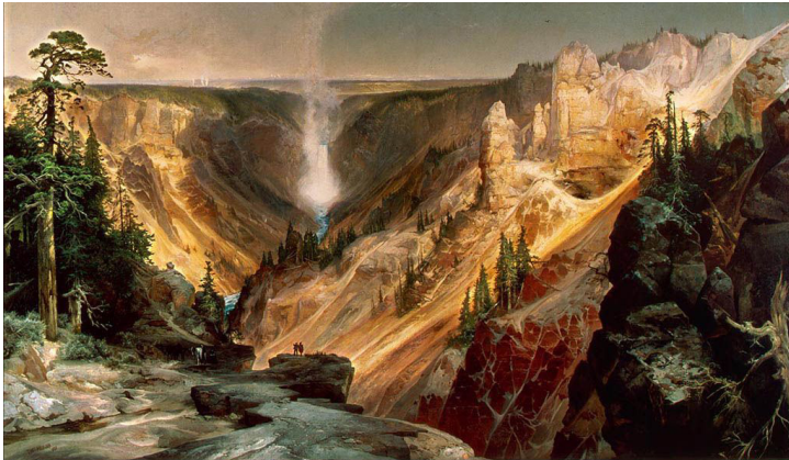
Thomas Moran, The Grand Canyon of the Yellowstone , 1872, Collection of the Department of the Interior Museum