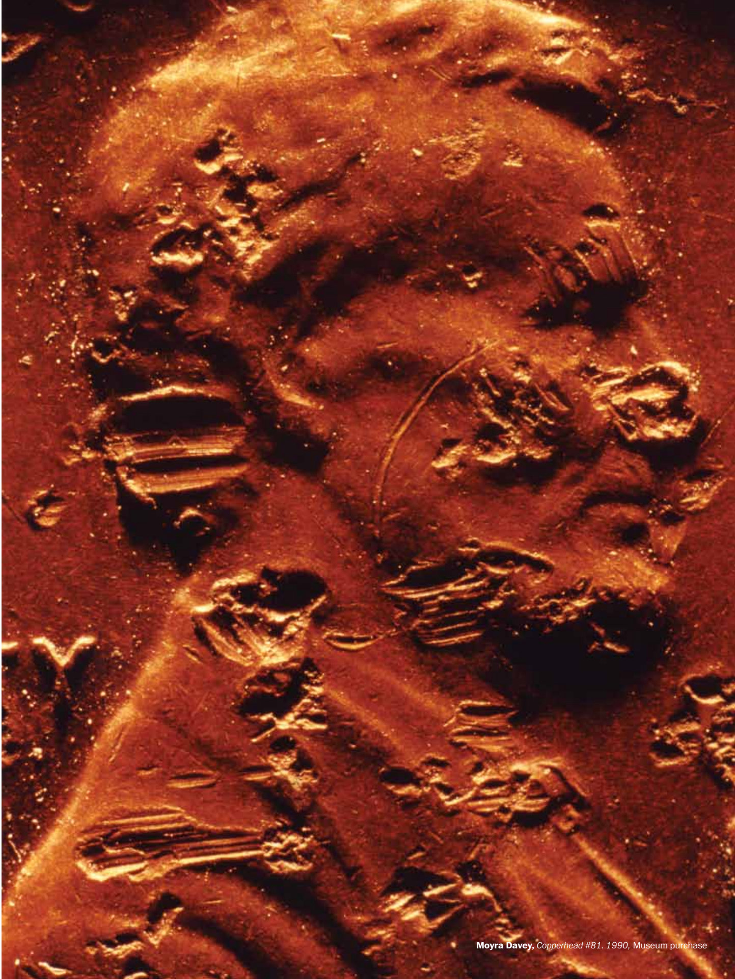
Moyra Davey, Copperhead #81. 1990, Museum purchase

Public Works examined geographically and chronologically diverse examples of built infrastructure captured through the lenses of mid-20th century to contemporary artists.