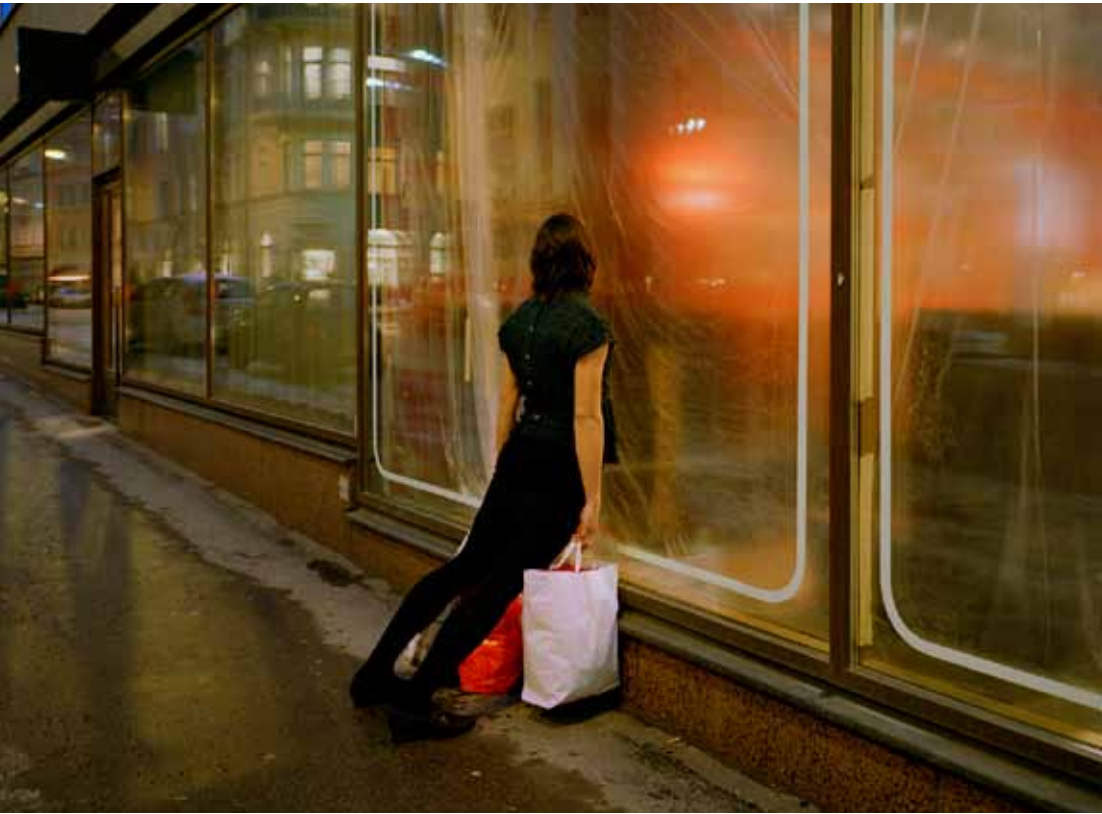
Top: Sally Mann , Untitled , from the America: Now and Here portfolio, 1995, Museum purchase Bottom: Carrie Schneider , Recession , 2009, Gift of Andreas Waldburg-Wolfegg Cover: Penelope Umbrico 7,626,056 Suns From Flickr (Partial) 9/10/10, 2010, Museum purchase