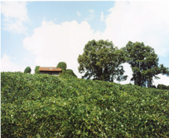
William Christenberry Kudzu and House, Tuscaloosa County, AL, 1989 From the collection of the MoCP