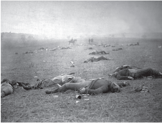
Matthew Brady Battle of Gettysburg, 1863 (not held in the MoCP collection)