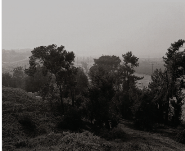
Robert Adams Expressway near Colton, California, 1982