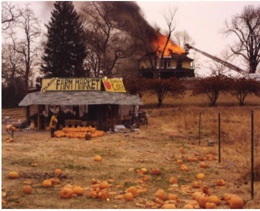
Joel Sternfeld McLean Virginia, 1978