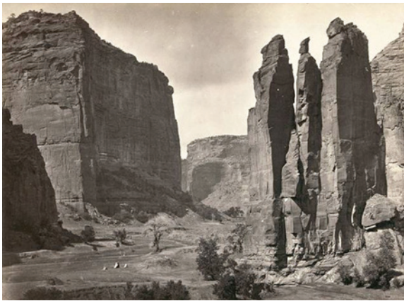
Timothy O'Sullivan Cañon de Chelle. Walls of the Grand Cañon about 1200 Feet in Height, 1873 Not held in the MoCP collection

Landscape photography is a form of documentary photography that describes the geography of an area or conveys and evokes a sense of place. Artists working in this genre might document the built environment, vernacular structures, nature, or evidence of the presence or impact of people on the land.