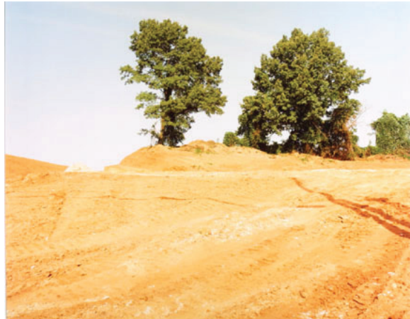
William Christenberry Site of Kudzu and House, Tuscaloosa County, AL (view II), 1992.