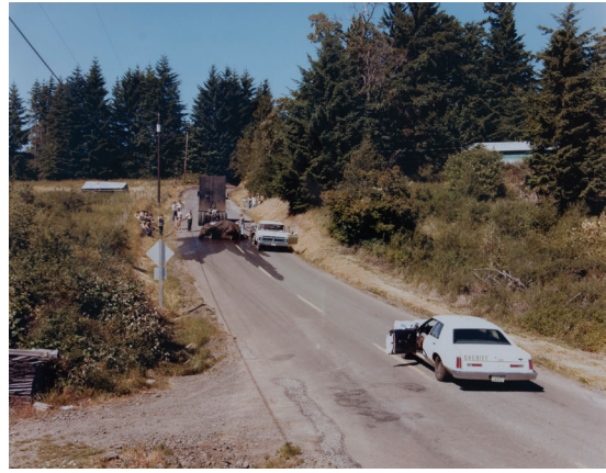
Joel Sternfeld Exhausted Renegade Elephant, Woodland, Washington, 1979