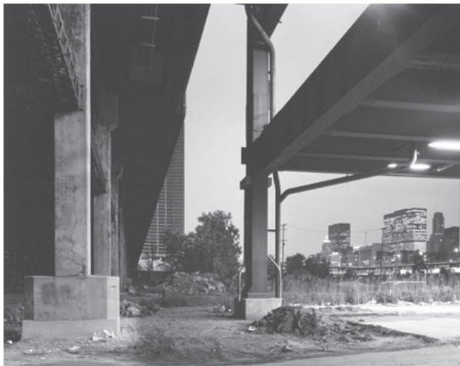
Bob Thall Chicago beneath the Outer Drive at Lake Street, 1982