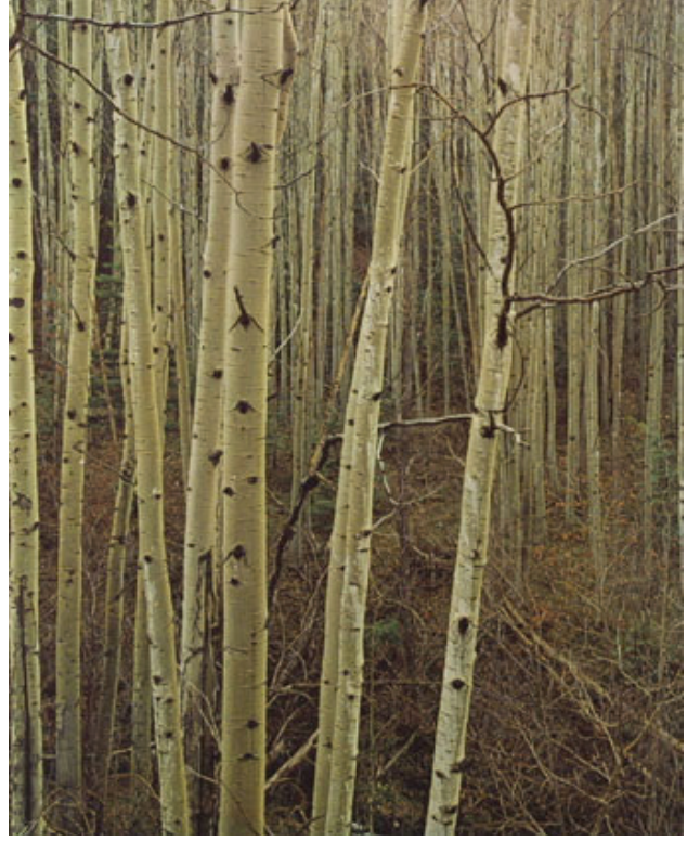
Eliot Porter Aspens in Early Spring, New Mexico, 1957

In the early to mid-twentieth century, photographers including Ansel Adams and Eliot Porter emphasized the beauty of the America landscape using large format cameras and advanced darkroom skills to create highly descriptive photographs that depict an often sublime view of beauty in nature, often by avoiding evidence of what had become by then pervasive human presence in the landscape. In an era of rapid development, their idealized views were often circulated by environmental organizations such as the Sierra Club in efforts celebrate the American landscape and show the public what might be lost if our natural resources are not protected and preserved.