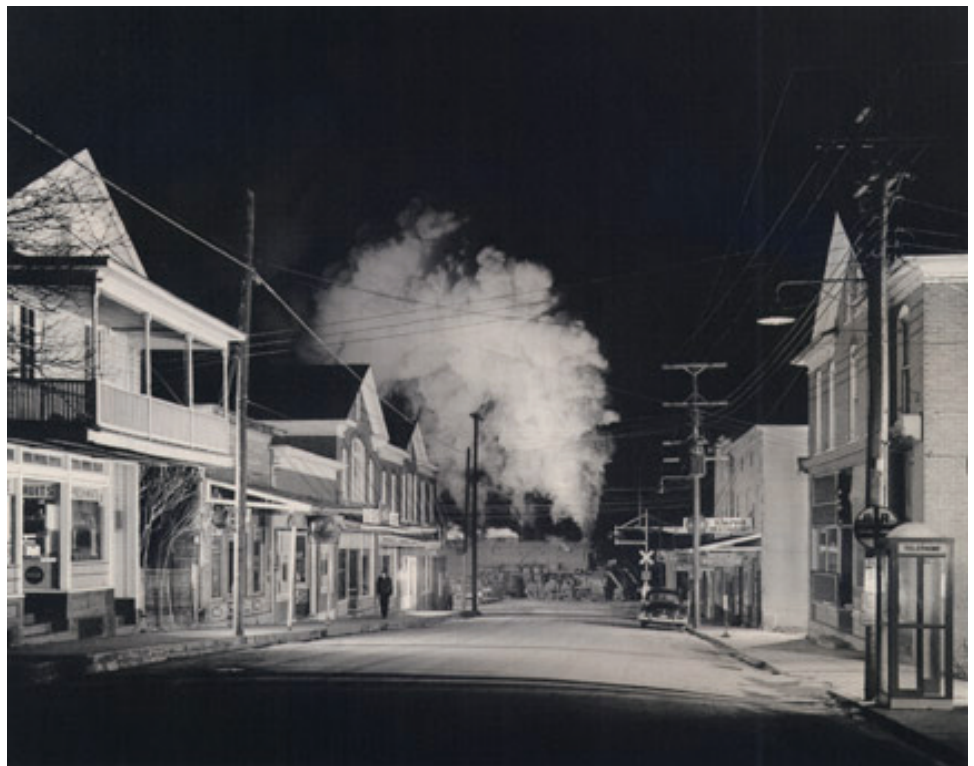
O. Winston Link

This resource is aimed at integrating the study of landscape photography into secondary and post-secondary fine arts, language arts, and social science curriculum. This guide contains, historical information, questions for looking and discussion, classroom activities, and suggested readings related to images from the permanent collection of the MoCP and is aligned with Illinois Learning Standards Incorporating the Common Core and can be adapted for use by younger students. A corresponding set of images for classroom use can be found at www.mocp.org/education/resources-for-educators.php . Additional images and biographies of the artists featured here can be found on the MoCP's searchable database at http://www.mocp.org/collection.php . The MoCP