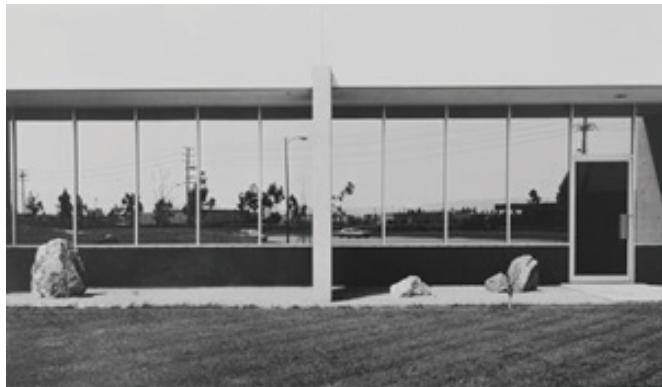
Lewis Baltz New Industrial Parks #10, from the portfolio New Industrial Parks near Irvine, California, 1974