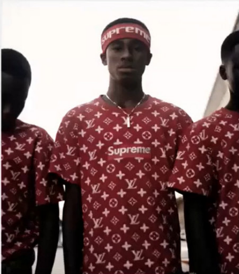
Higlanjobiery, Street Wear Culture, Ghana 2017