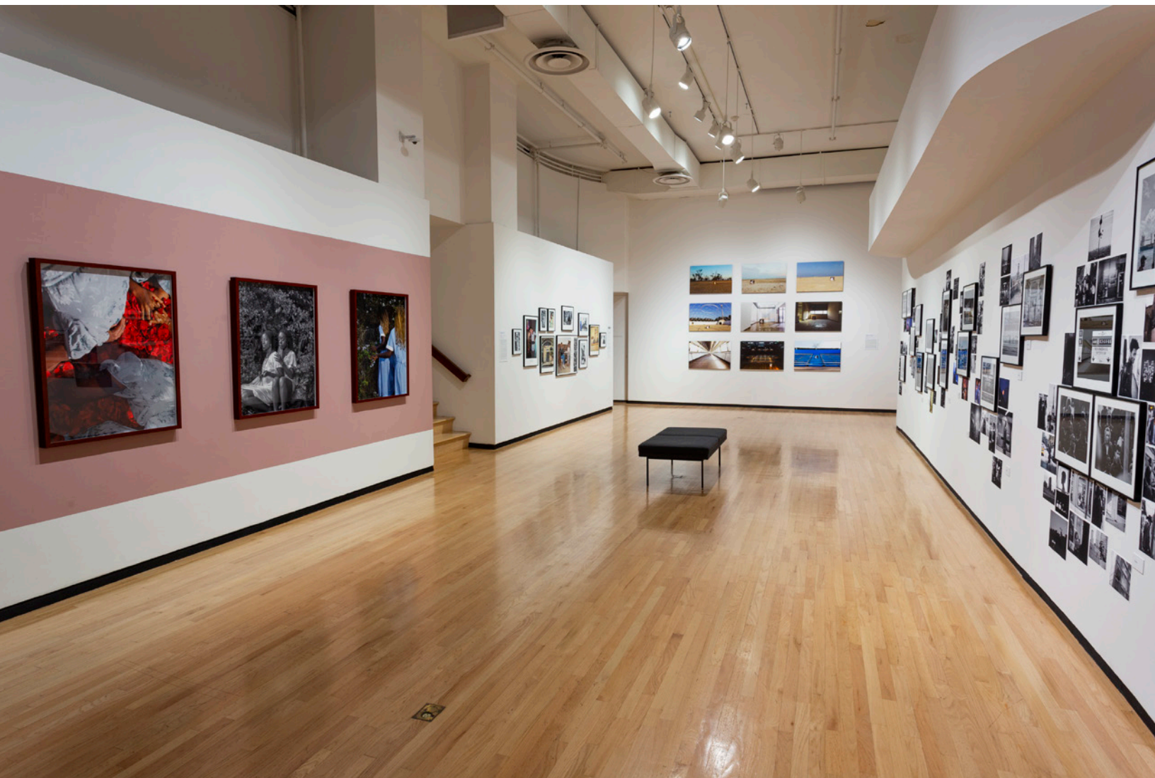
Installation view of Beautiful Diaspora/You Are Not the Lesser Part , MoCP, March 2022

Based on the themes in the MoCP exhibition Beautiful Diaspora/You Are Not the Lesser Part , this section of Arts, Activism, Policy, Power challenges students to broaden ways people are categorized or separated based on their nation, state, or cultural backgrounds. Students will engage with two artists in the exhibition who shun the label “minority,” and use photography to add visual presence to stories that fall outside of conventional representations of any one place or identity. This framework was built to encourage students to harness the power of self-authorship, while outlining ways that photography can be used as a tool to broaden preconceived notions of identity or belonging.