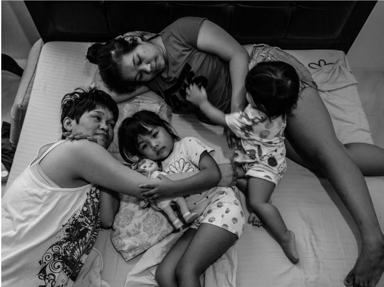
Xyza Cruz Bacani, Three Generations , from the series We Are Like Air , 2018