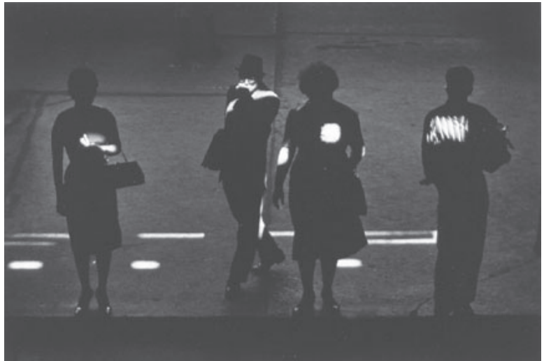
Kenneth Josephson Chicago , 1961

Aimed at middle school, high school, and college students, this resource is aligned with Illinois Learning Standards for English Language Arts Incorporating the Common Core and contains information on the artists and artistic traditions featured, questions for looking and discussion, and classroom activities. A corresponding image set can be found here . The MoCP is a nonprofit, tax-exempt organization accredited by the American Alliance of Museums. The Museum is generously supported by Columbia College Chicago, the MoCP Advisory Committee, individuals, private and corporate foundations, and government agencies including the Illinois Arts Council, a state agency.