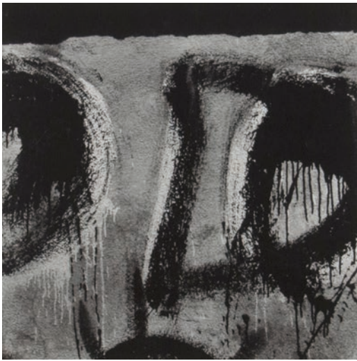
Aaron Siskind Jalapa 66 , 1974, from the series Homage to Franz Kline