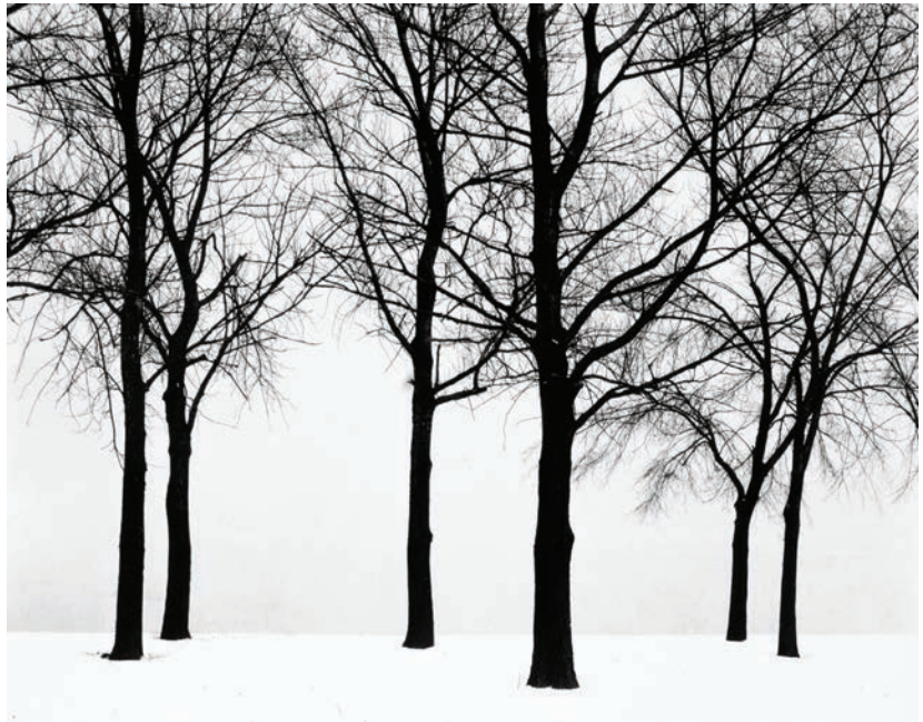
Harry Callahan, Chicago , 1950