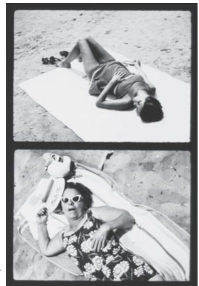
Ray K. Metzker Couplet , 1969

Ray Metzker's (1931-2014) images question the nature of the photograph and photographic "reality." Through cropping, multiple imagery, and other formal inventions, his work explores options for transforming photographs. "When you look at the multiples, you are aware of patterning and so forth," he says, "but there is still identifiable subject matter; frequently there are people there; there is a rhythm to those people." For his 1959 thesis project, My Camera and I in the Loop , Metzker took downtown Chicago as his subject, but renders it in experiments that tell more about photography than they do about the city. Between graduating from the Illinois Institute of Technology (MS, 1959) and 1983, Metzker taught at the Philadelphia College of Art, the University of New Mexico, and Columbia College Chicago.