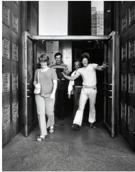
Barbara Crane, from People of the North Portal , 1970

Chicago-native Barbara Crane (b. 1928) began photographing in 1947 while completing an undergraduate degree in art history at New York University. In 1964, after showing her portfolio to Aaron Siskind, Crane began classes at the Institute of Design, earning her master's degree in 1966.