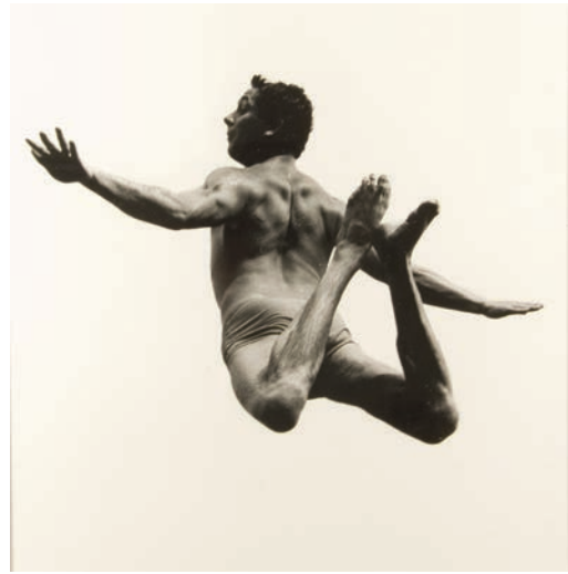
Aaron Siskind Pleasures and Terrors of Levitation #99 , 1961

Aaron Siskind (1903-1991) began his photography career as a documentarian in the New York Photo League in 1932 where he contributed to photographic essays such as Harlem Document , and Dead End . In the early 1940s, his work shifted to the abstract and metaphoric as Siskind cultivated friendships with such Abstract Expressionists as Franz Kline, Barrett Newman, and Mark Rothko, and began to exhibit work at the Charles Egan Gallery (which specialized in Abstract Expressionism). On the invitation of Harry Callahan, Siskind joined the faculty of the Institute of Design in Chicago in 1951, taking over as head of the photography program when Callahan left in 1961.