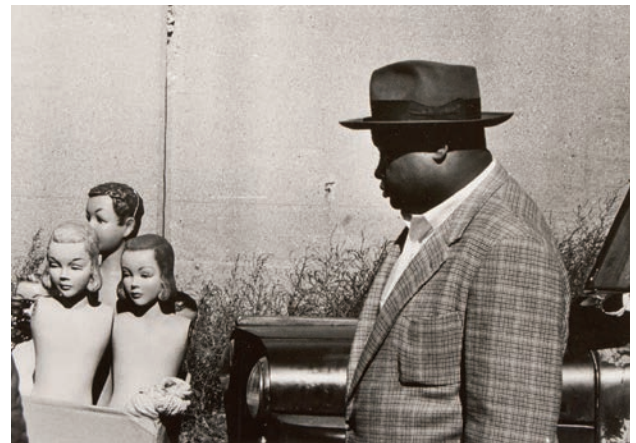
Yasuhiro Ishimoto, Untitled from Chicago, Chicago , 1960

American-born Yasuhiro Ishimoto (1921-2012) moved to Chicago in 1945 to study architecture after he was released from the Amachi Japanese Internment Camp in Colorado, where he was detained during World War II. In 1948, after encountering Moholy-Nagy's Vision in Motion , Ishimoto enrolled at the Institute of Design, and studied photography under Harry Callahan. While at the ID, Ishimoto photographed extensively on the streets of Chicago, often documenting scenes that showed the inequality and tension between African Americans and whites in this very segregated city. Though Ishimoto returned to Japan in 1953, he maintained close ties to Chicago, returning to photograph on a fellowship from 1959 to 1961 and publishing two books of photographs called Chicago , Chicago . Moving through Chicago as both citizen and visitor, Ishimoto created documents that speak eloquently for the culture of the city in the 1950s and 60s. His photographs present highly original visual spaces, which nonetheless suggest the politics, mentality, and history of the city.