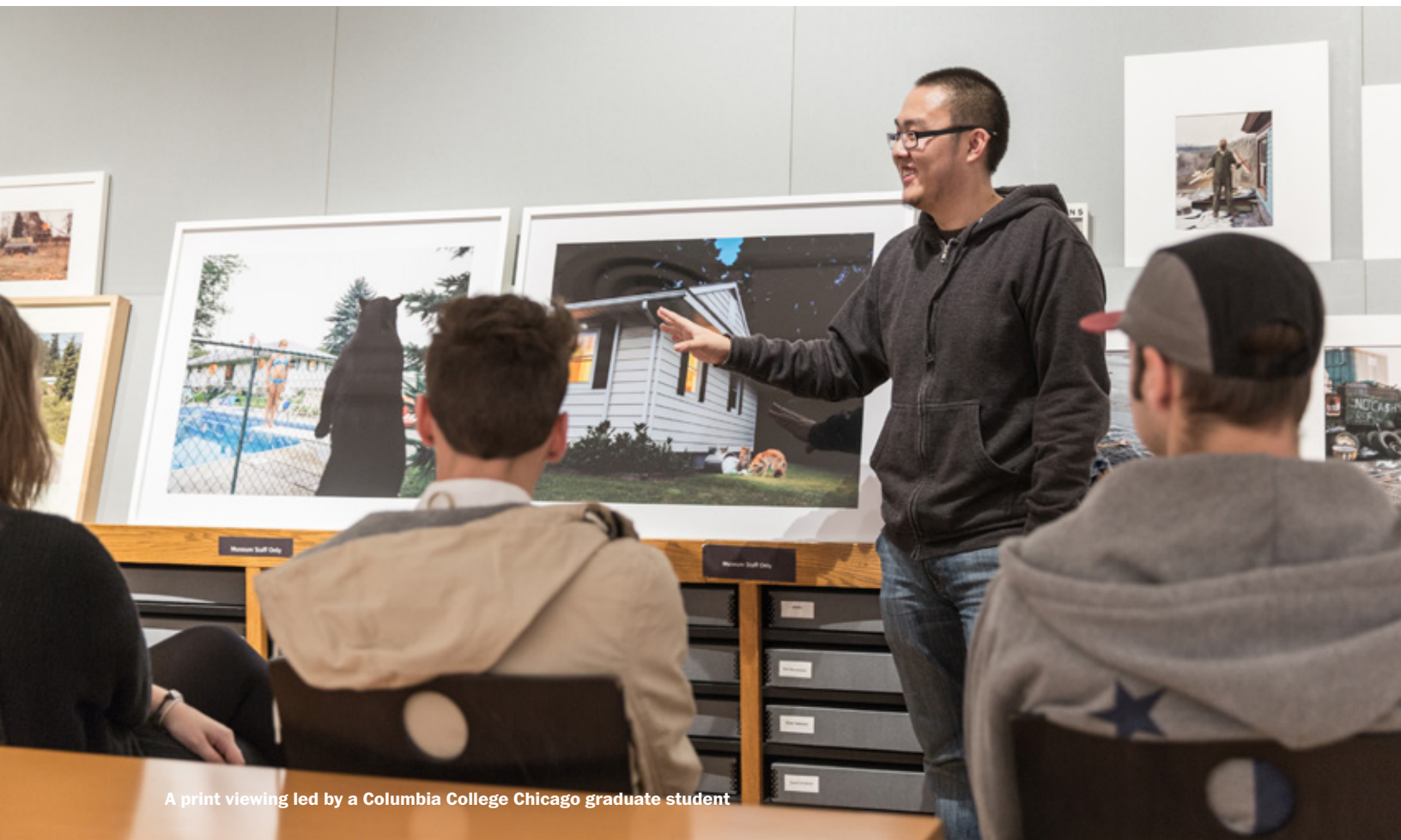
A print viewing led by a Columbia College Chicago graduate student