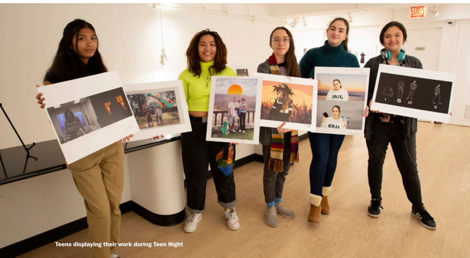
Teens displaying their work during Teen Night

MoCP Behind the Lens is an entirely virtual program hosted on Zoom that provides participants the unique opportunity to get a sneak peek into the artist’s studio and ask questions about their work.