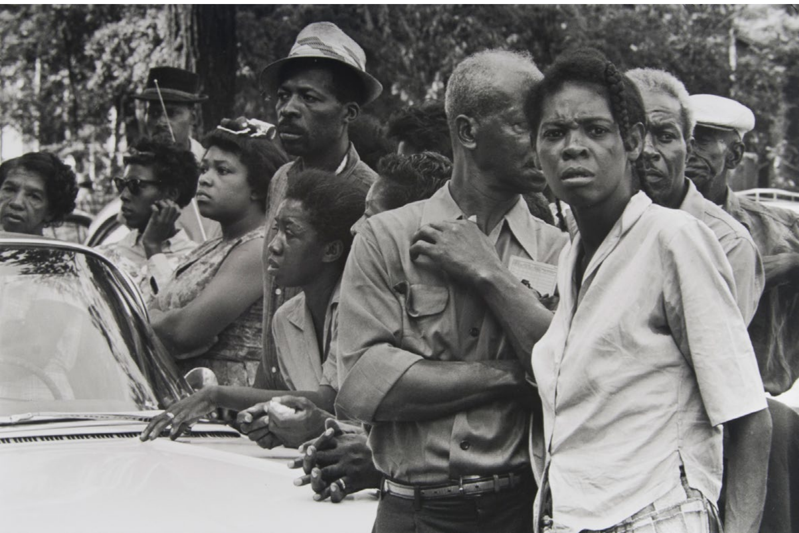
Danny Lyon, Birmingham, Alabama, 1963, Crowds Wait Along the Funeral Route of the Girls Murdered in the 16th Street Baptist Church Bombing, 1963 , Collection of the Museum of Contemporary Photography, Gift of Peter Chatzky, 2012:142 (not in exhibition)