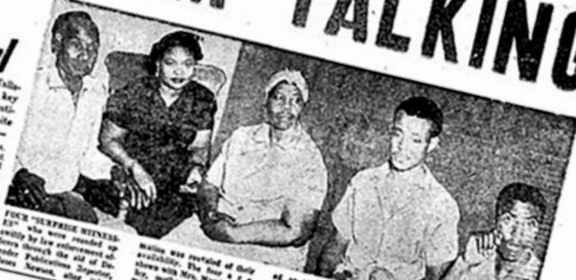
Mrs. Bradley (left) and other witnesses at the trial. Mrs. Bradley says she was told the witness would be given a $5000 bribe to make her talk at the trial.