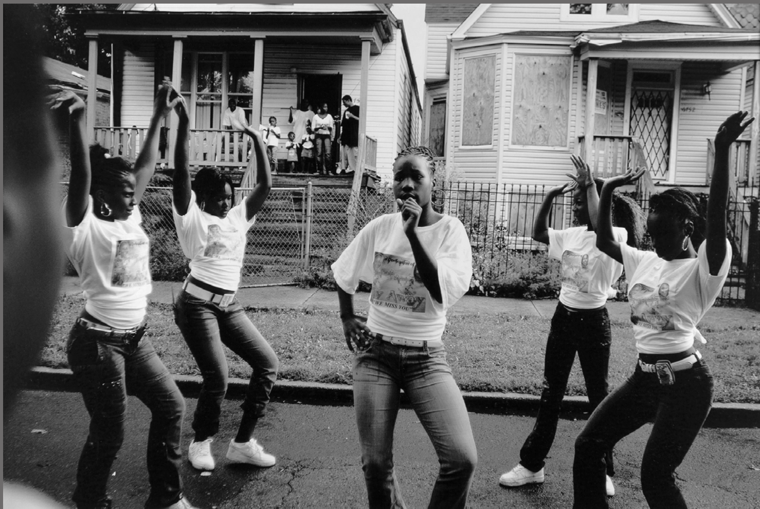
Carlos Javier Ortiz, Girls Dancing , Englewood, Chicago, 2008. Museum purchase, 2018:10