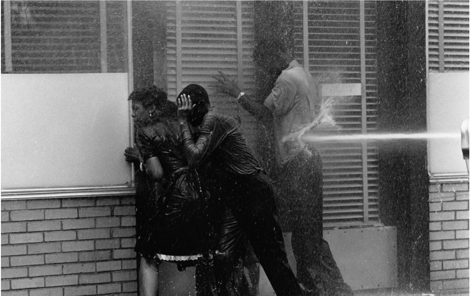
Charles Moore, Untitled [Firemen blast protesters with a high-pressure water hose to break up a Civil Rights demonstration, corner of Fifth Avenue North and 17th Street, Birmingham, Alabama] , 1963, ©Charles Moore/Masters/Getty Images. Courtesy of the Ryerson Image Centre, Toronto, Canada.

This image of people being blasted by fire hoses during the Children's Crusade taken by Charles Moore was published in Life magazine. It became a rallying tool for African Americans to join King's movement. On taking the image, Moore stated that the image "was likely to obliterate in the national psyche any notion of a 'good southerner'." 1 President Kennedy described what he saw in the published images as "shameful: and "so much more eloquently reported by the news camera than by any number of explanatory words." 2