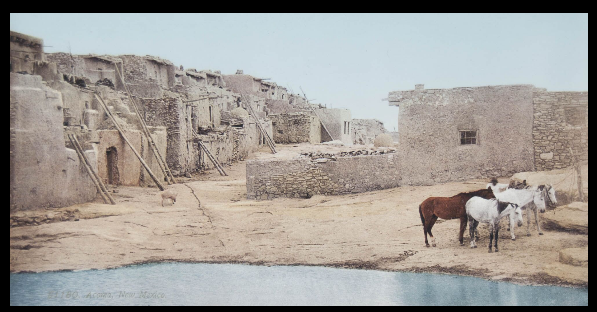
William Henry Jackson "Acoma, New Mexico" c.1900