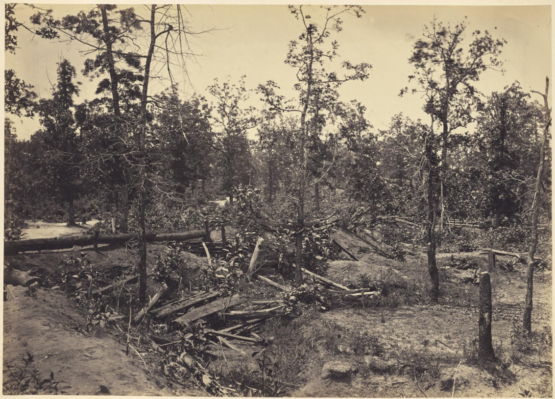
DI . 0 . D 022 D 1