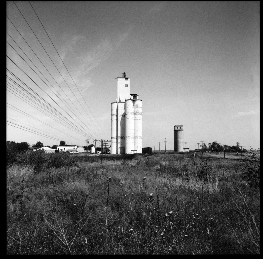
Frank Gohlke "Grain Elevator, Series III, Bison, Oklahoma" 1973