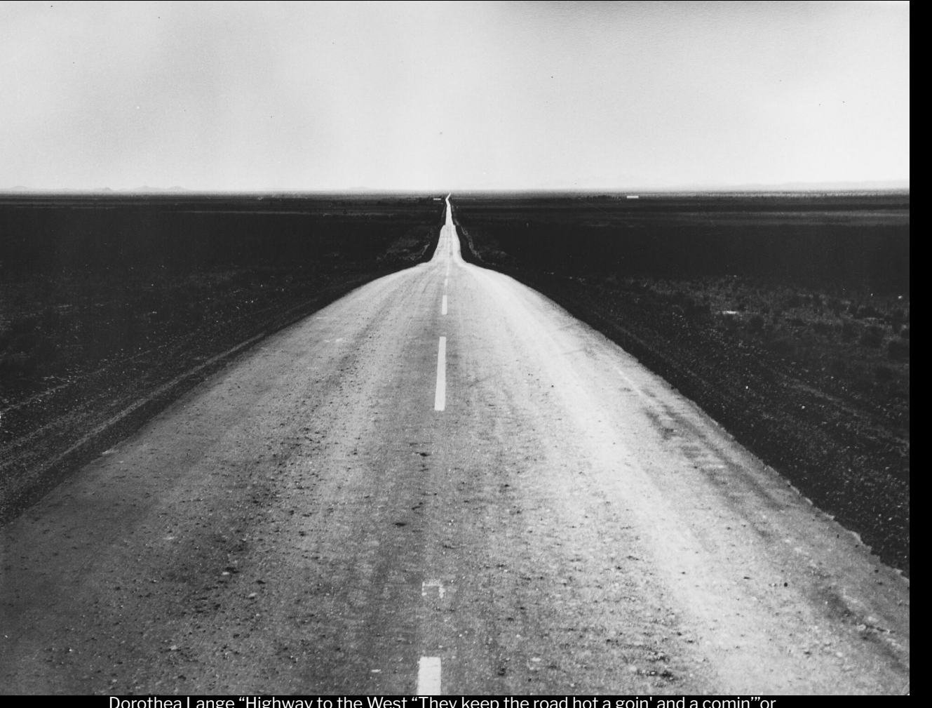
Dorothea Lange "Highway to the West "They keep the road hot a goin' and a comin" or "They've got roamin' in their head." US 54 in southern New Mexico" 1938