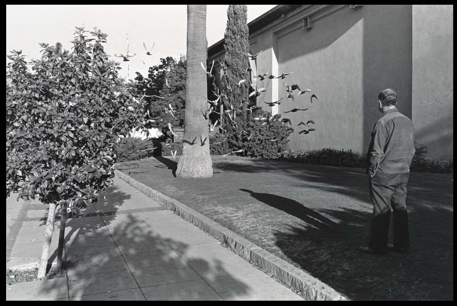
Henry Wessel Jr. "Santa Barbara, California" from The New California Views portfolio, 1977