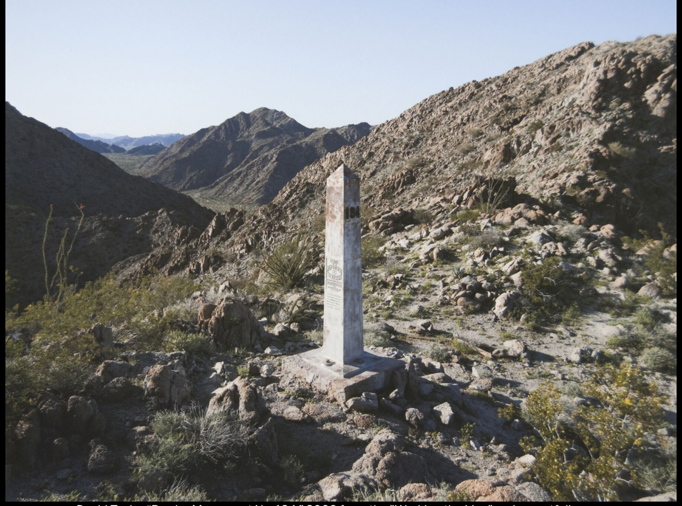
David Taylor "Border Monument No. 184," 2009 from the "Working the Line" series portfolio