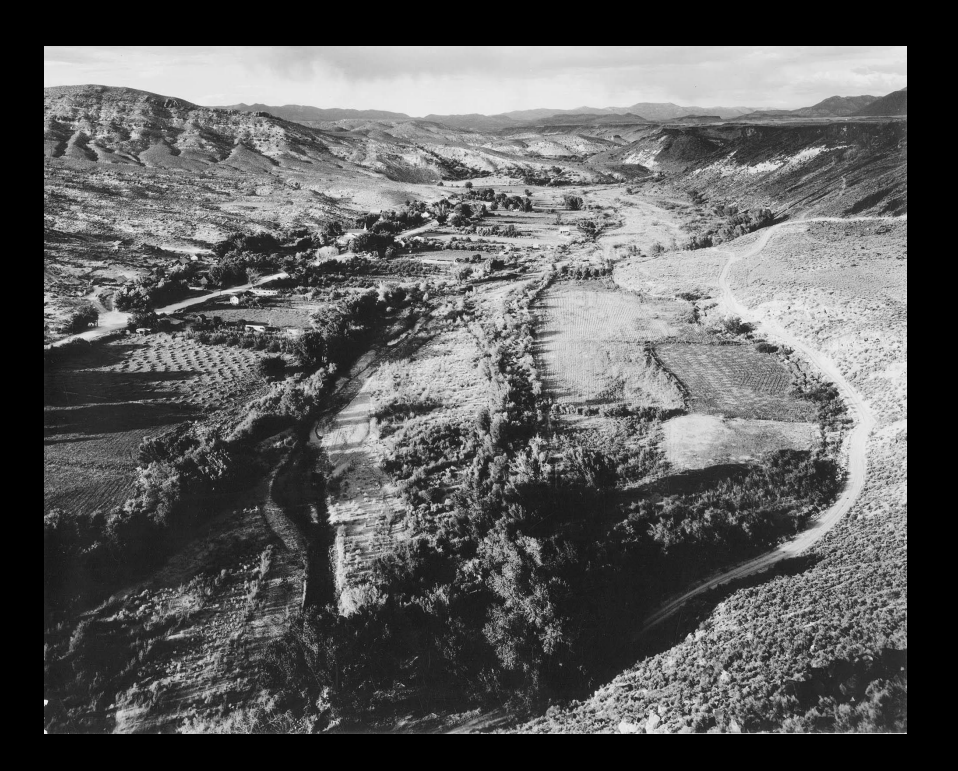
Ansel Adams "Gunlock, Washington County, Utah" 1953