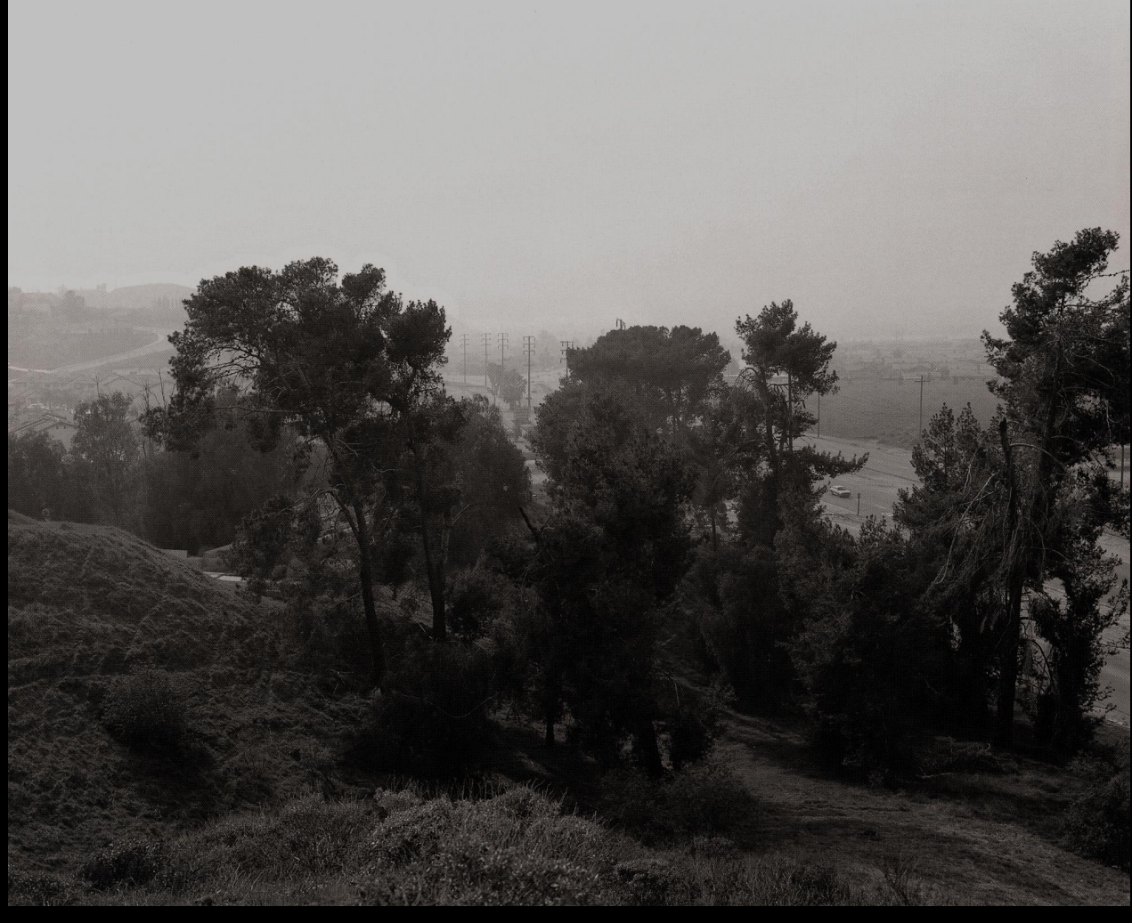
Robert Adams "Expressway near Colton, California" 1982