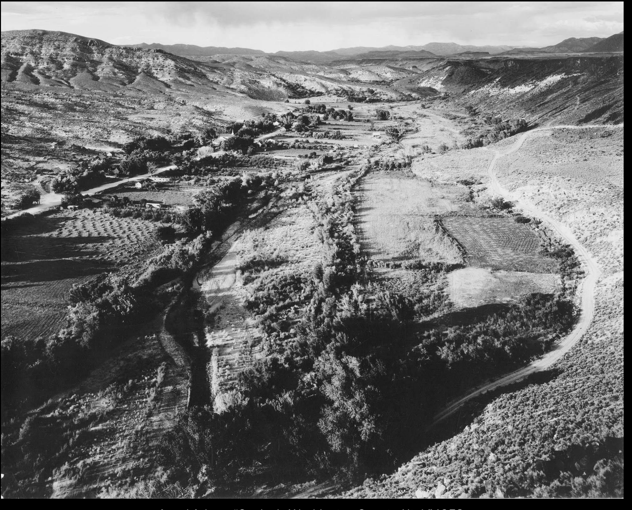
Ansel Adams "Gunlock, Washington County, Utah" 1953