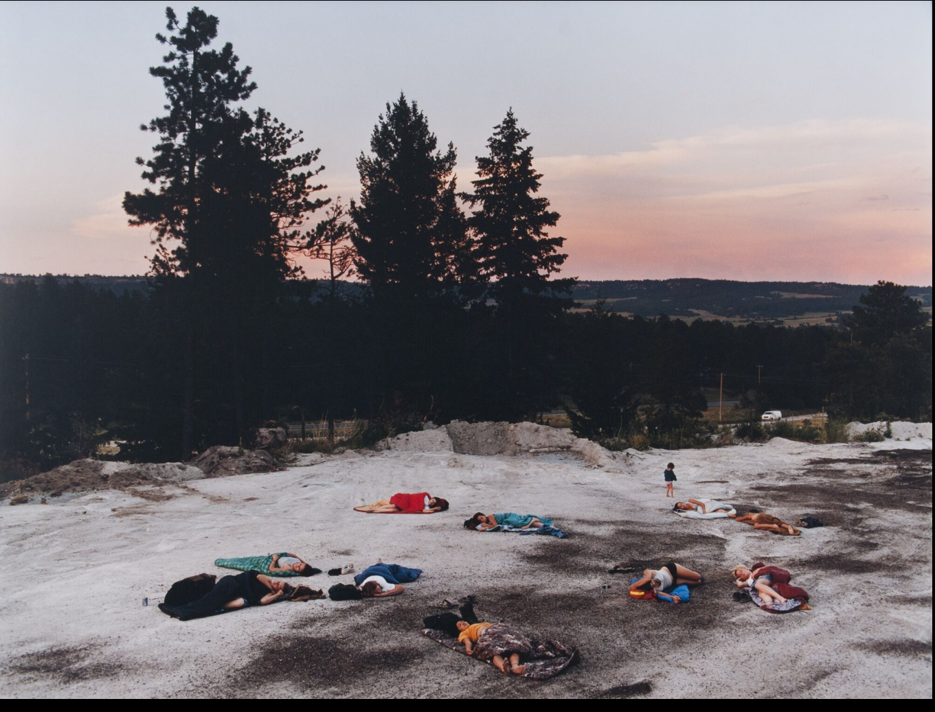
Justine Kurland,, "Slumber Party (Denver Colorado)" 2000