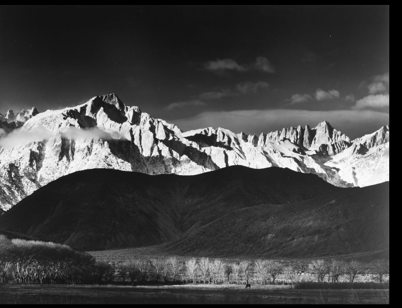
Ansel Adams "Winter Sunrise, Sierra Nevada, from Lone Pine, California" 1944, Printed 1980