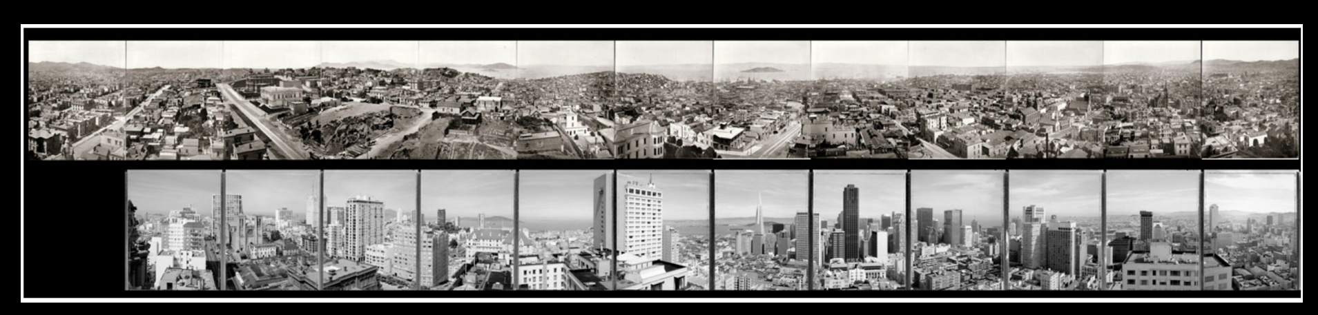
(Top)Eadweard Muybridge "Panorama of San Francisco from California Street Hill" 1877

(Bottom) Mark Klett "Panorama of San Francisco," 1990 from the "California Street Hill" portfolio