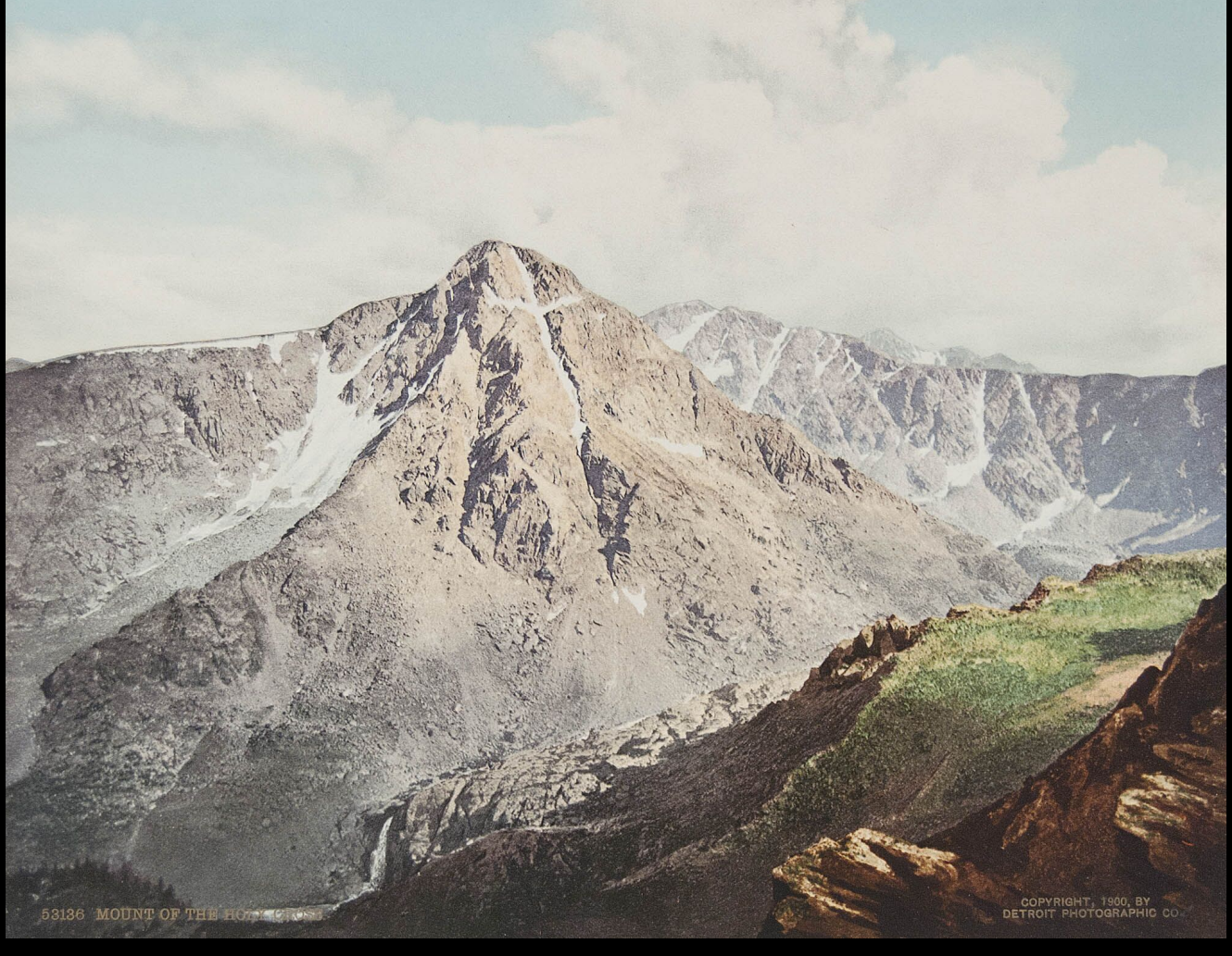
William Henry Jackson "Mount of the Holy Cross" 1901