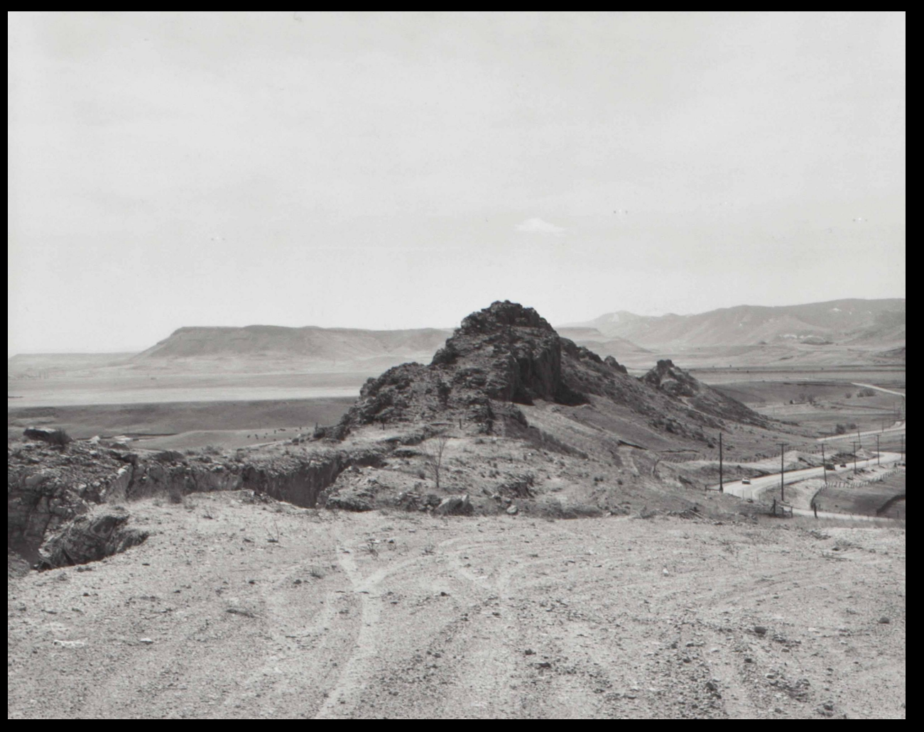
Robert Adams "South From the Rocky Flats, Jefferson County, Colorado" 1977