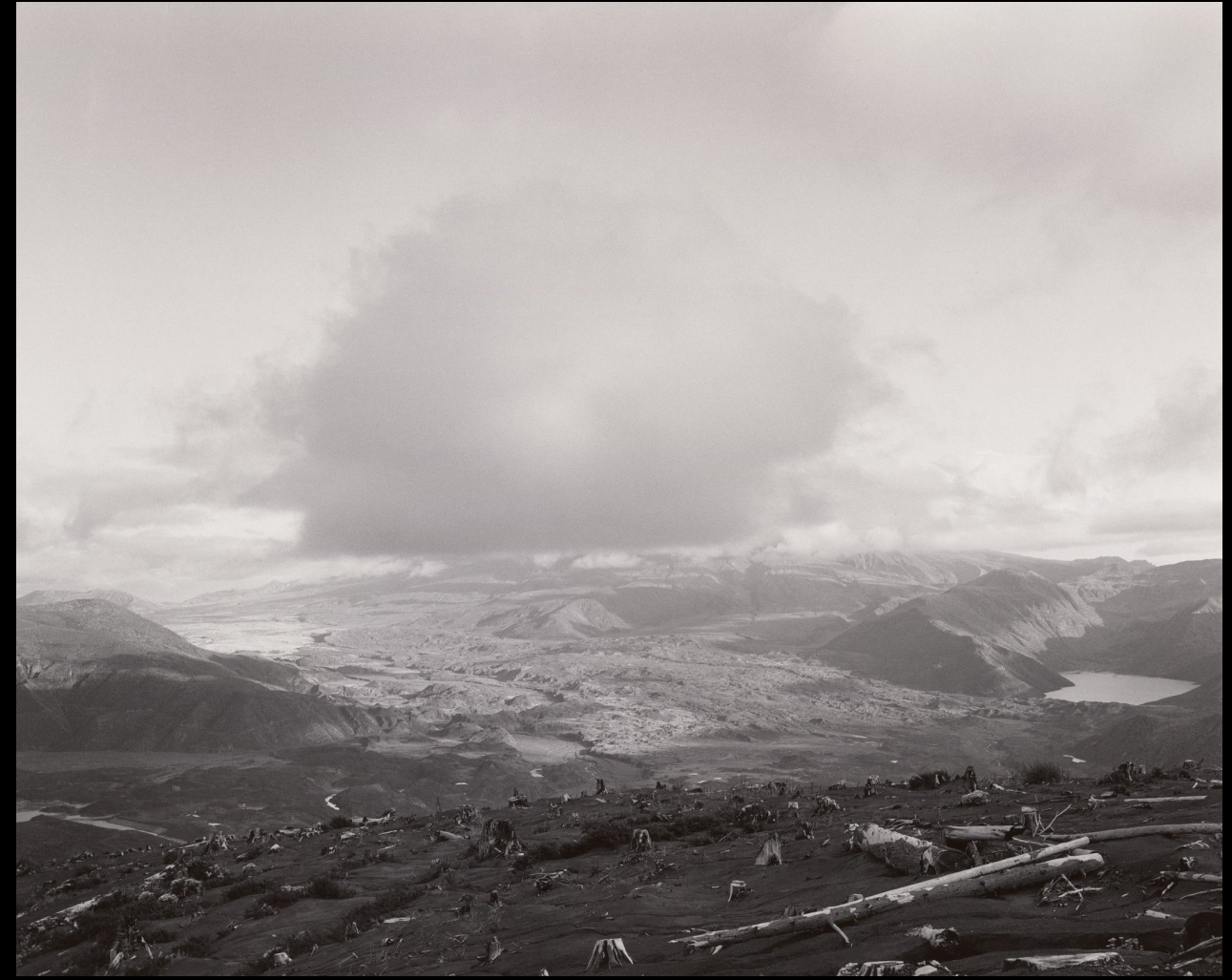
Frank Gohlke "Mt. St. Helens Shrouded In Its Own Cloud-From a Point 6 Miles NW of Mt. St. Helens, Washington" 1983. Printed 1989