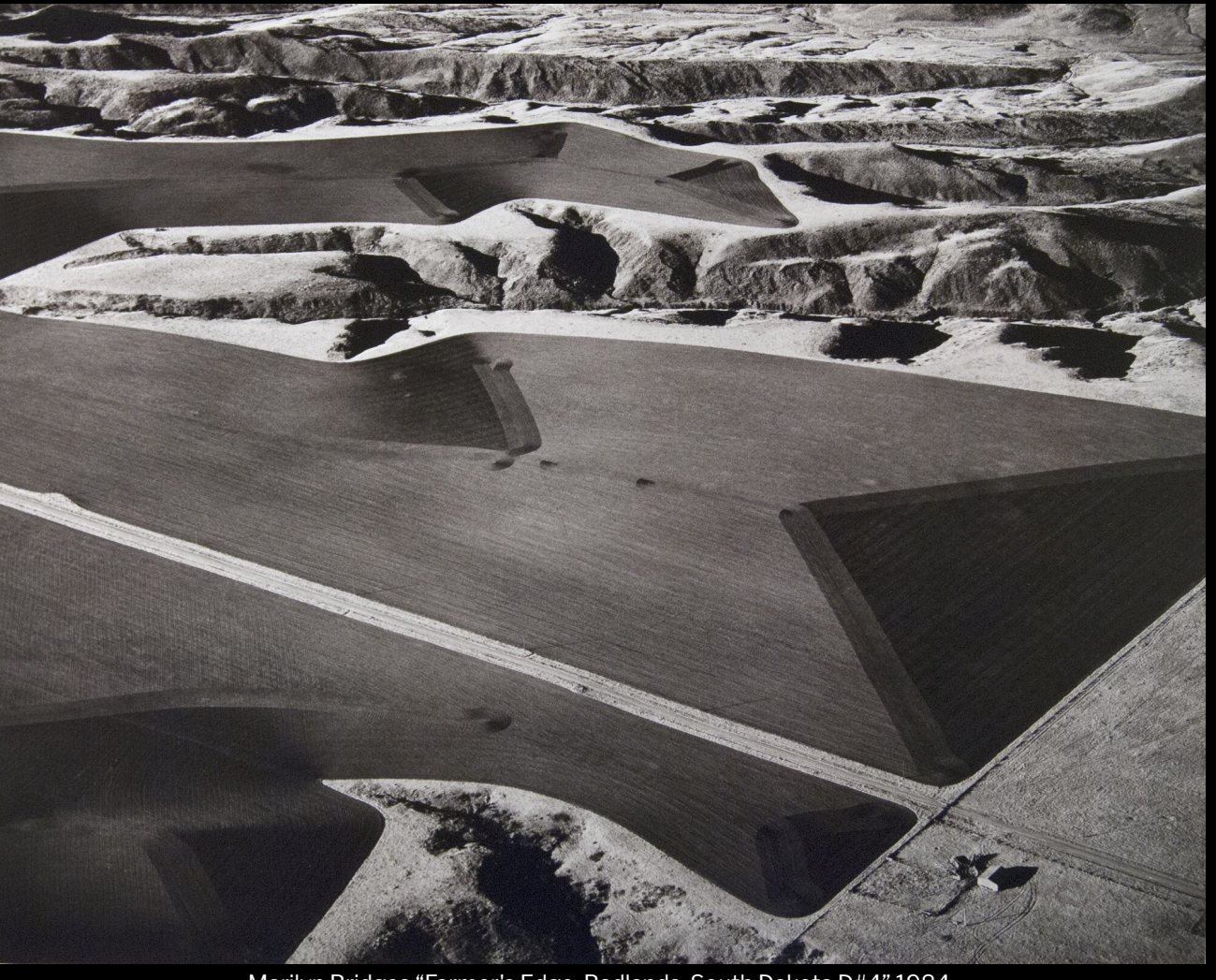
Marilyn Bridges "Farmer's Edge, Badlands, South Dakota D#4" 1984