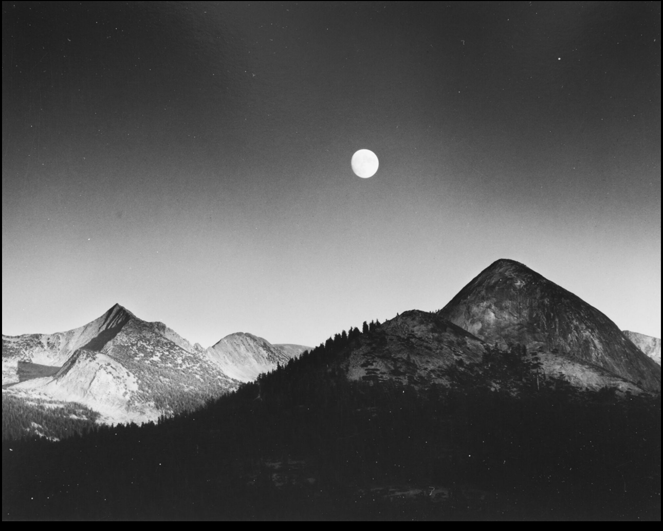
Ansel Adams "Moonrise from Glacier Point, Yosemite National Park, California" 1959