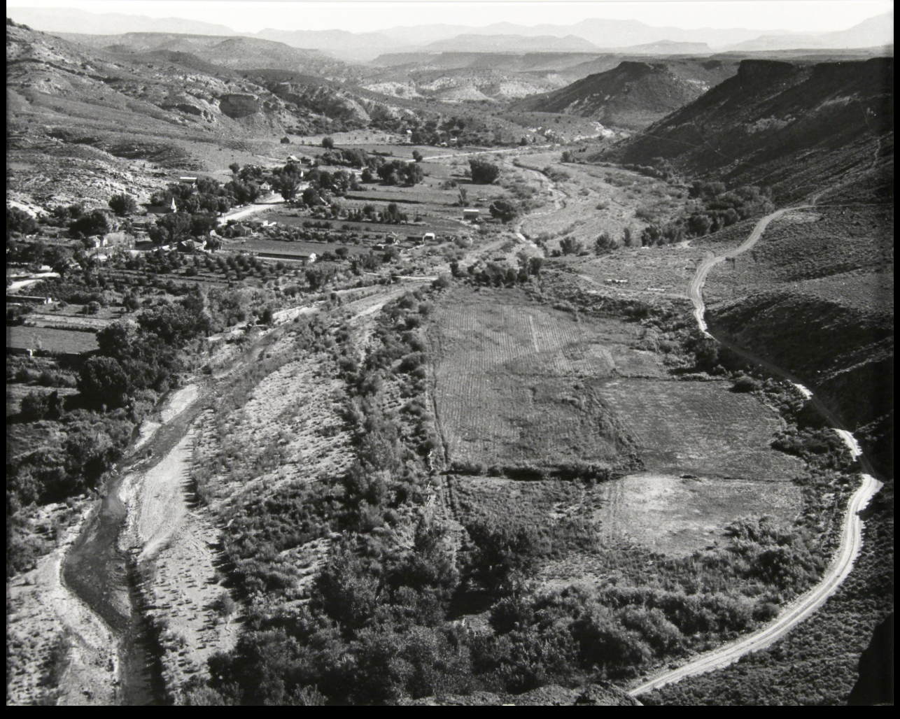
Dorothea Lange "Gunlock, Washington County, Utah" 1953