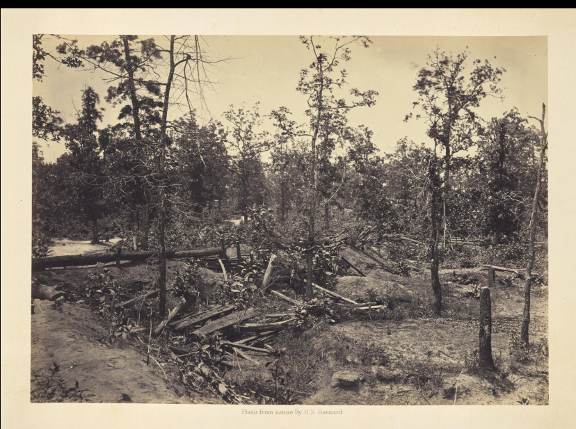
BATTLE FIELD OF ATLANTA, GAJULY 22, 1864 No.