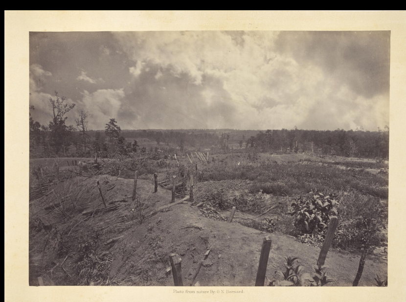
BATTLE FIELD OF ATLANTA, GAJULY 22º 1864 Nº